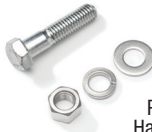
Plated Hardware (Available only with the BumpStep®XL with Plated Hardware)