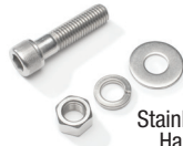
Stainless Steel Hardware (Available only with the BumpStep®XL with Theft Deterrent Stainless Hardware)