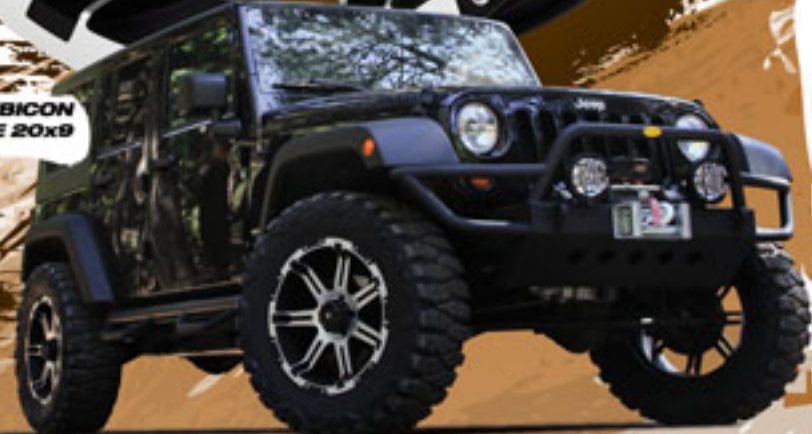
JEEP RUBICON OVERDRIVE 20x9