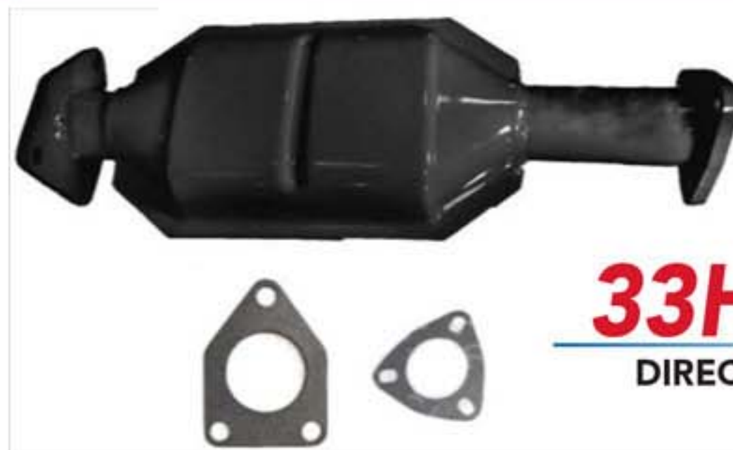
33H9024 DIRECT FIT, REAR