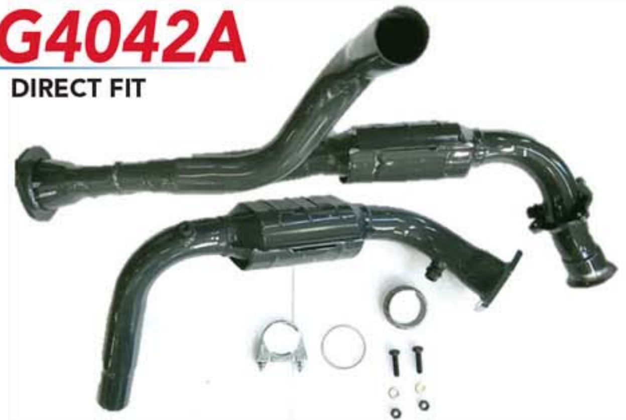
33G4042A DIRECT FIT