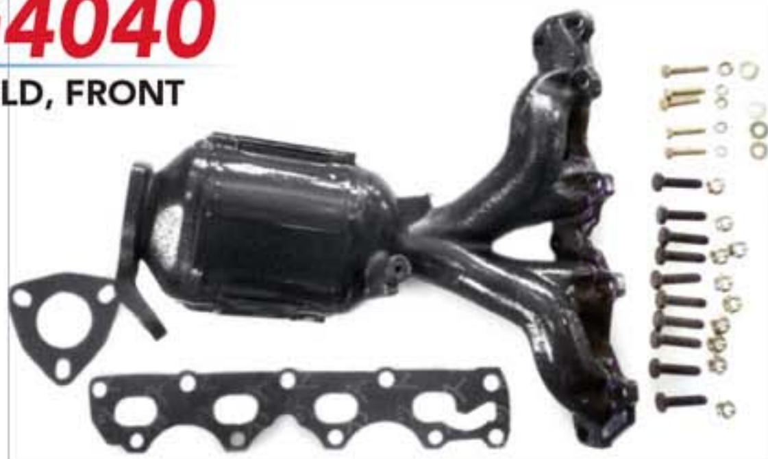
33G4040 MANIFOLD, FRONT