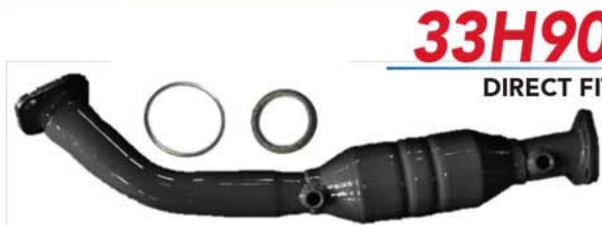
33H9025 DIRECT FIT