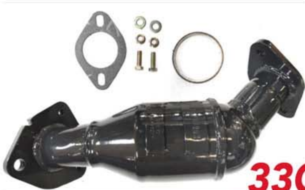
33G4039 DIRECT FIT, FRONT RIGHT