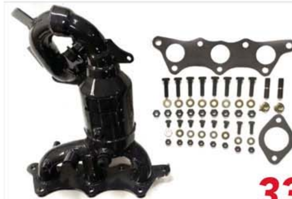
33H9026 MANIFOLD, FRONT RIGHT