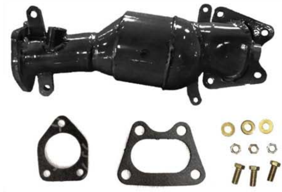
33H9021 MANIFOLD, FRONT RIGHT