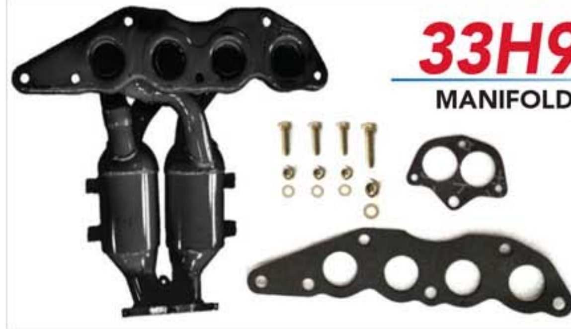
33H9022 MANIFOLD, FRONT