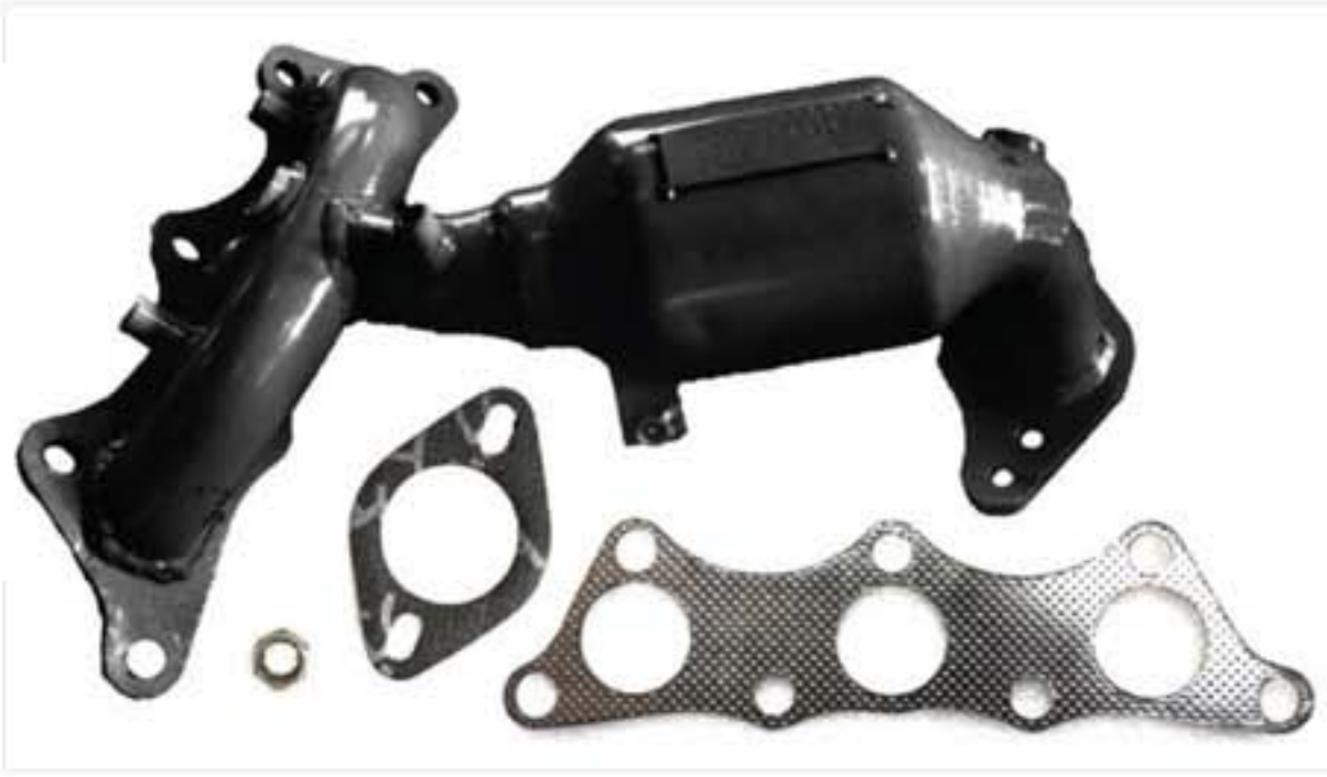
33H9014 MANIFOLD, FRONT LEFT