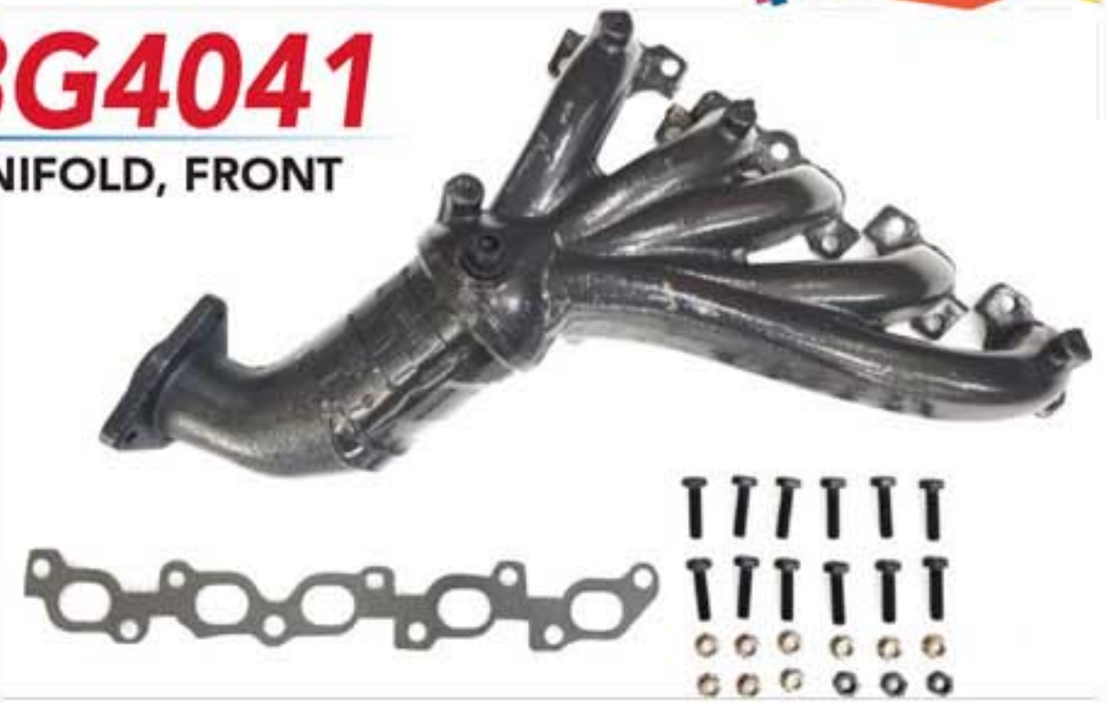
33G4041 MANIFOLD, FRONT