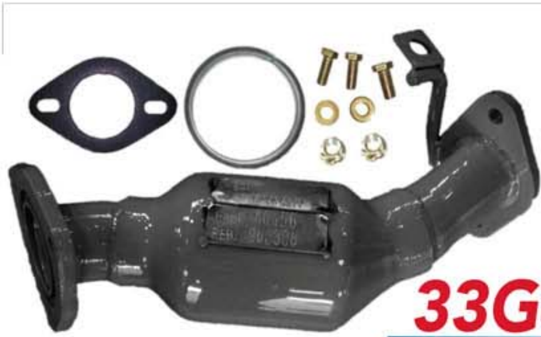
33G4038 DIRECT FIT, FRONT LEFT