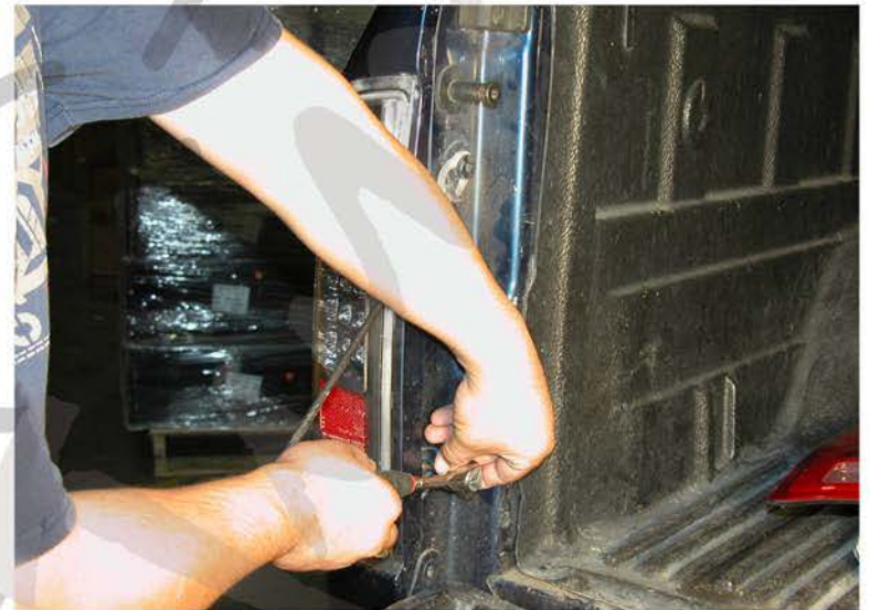
8. Please repeat the picture order from 1 to 8 for the opposite side