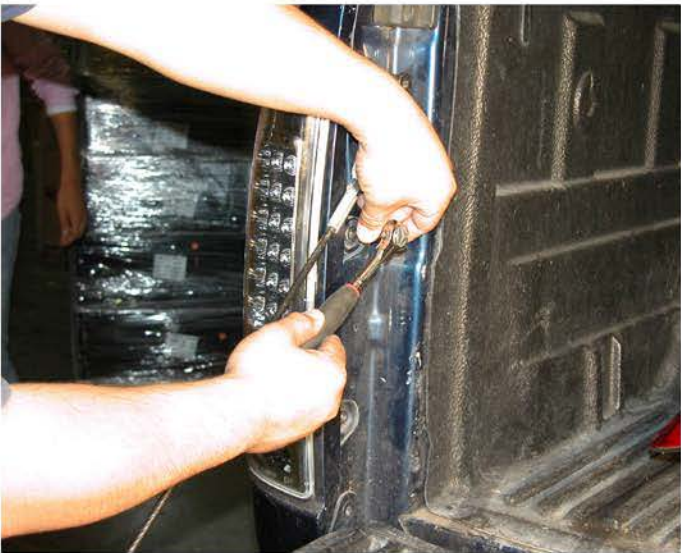
7. Install two T20 bolts