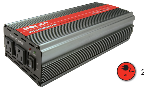
PI10000X 1000W Power Inverter