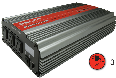
PI15000X 1500W Power Inverter