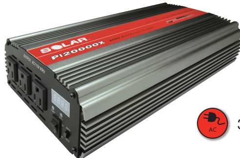
PI20000X 2000W Power Inverter