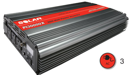
PI30000X 3000W Power Inverter