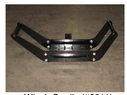
Winch Cradle (#2811)