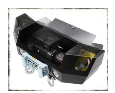
Black Box (#2805)