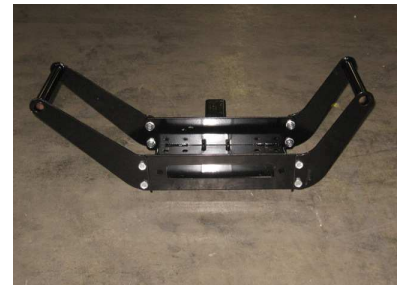
Winch Cradle (#2811)