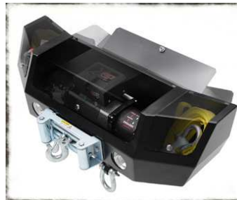
Black Box (#2805)