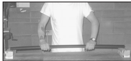
Decrease Rail Bow