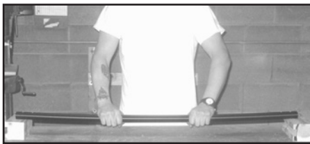
Increase Rail Bow

Important Note: While made of extruded aluminum, the rails are heat-treated for added strength. Therefore, several applications of adequate "springing" pressure may be required to modify the curvature of the rails.