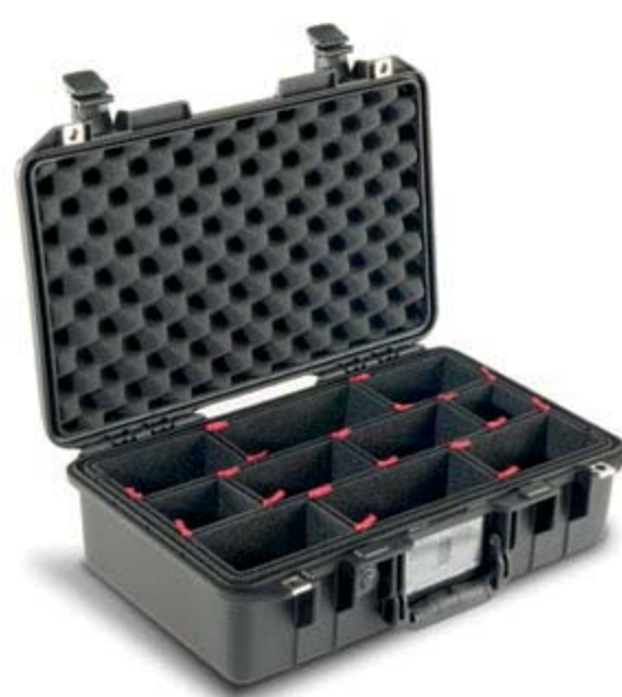
TrekPak™ Dividers (Available in Black Cases Only)