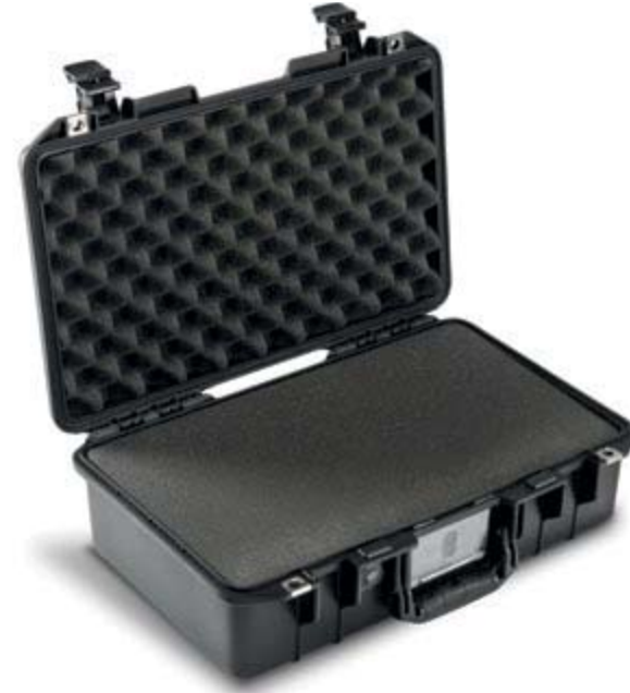
Pick N Pluck™ Foam