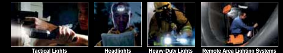
Tactical Lights Headlamps Heavy-Duty Lights Remote Area Lighting Systems

The same durability and ingenuity built into every Pelican case also sets our flashlights apart. We're illuminating the world's darkest and most dangerous places with specialized lighting tools: