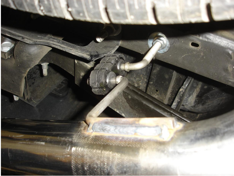
Fig # 1 Passenger Side

Step 3: Once a final position has been chosen for the new system, evenly tighten all fasteners from front to rear. The supplied band clamps must be VERY tight to properly align the pipes and prevent leaks (Approximately 40ft-lbs). U-bolt clamps should be tightened to approximately 30-35ft-lbs. Inspect all fasteners after 25-50 miles of operation and retighten if necessary.