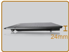
Extremely slim design