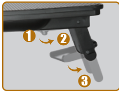
Patented TPA foot stand (Tri-Position Adjustable)