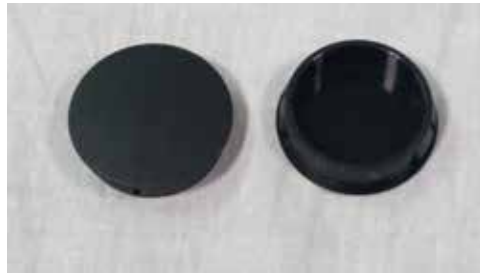
Spindle Sleeve Cap X2