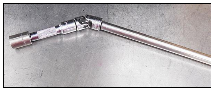
Figure 3 - Top Bolt Extension