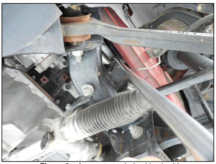
Figure 2 - Access to top bolts driver's side