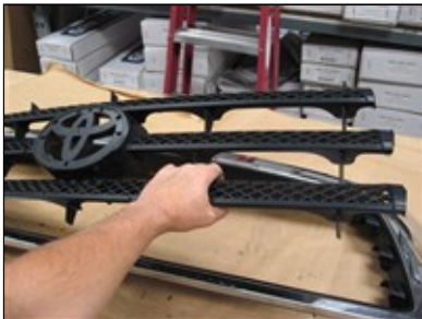
Picture #22: Removing factory grille center bars from the grille shell.