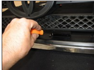
Picture #20: From the front side of grille scribe the extension bracket holes onto grille shell.