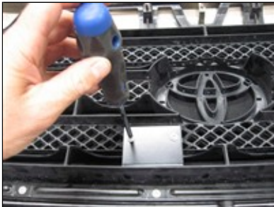
Picture #19: Fasten latch extension bracket to factory grille as shown.