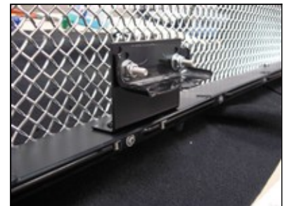
Picture #27: Mount the factory latch bracket to the extension bracket as shown.