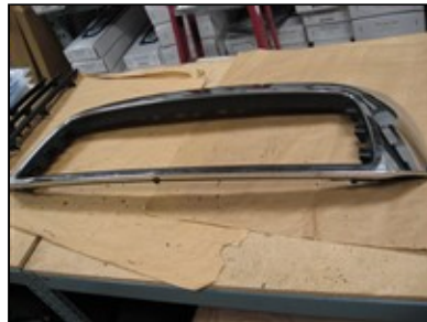
Picture #23: Here is the factory grille shell with the center bars removed.