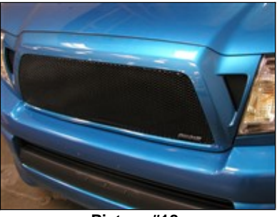
Picture #18: Looking Good with GrillCraft's Toyota Tacoma mesh grille in Black Powder Coat Finish!!