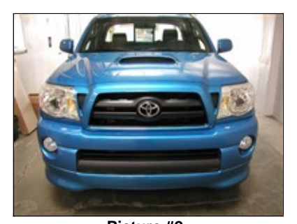
Picture #2: Here is our project Toyota Tacoma in need of a GrillCraft Sport Grille.