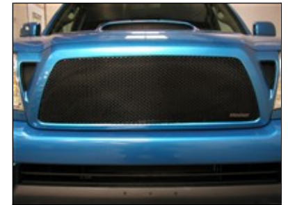
Picture #17: Optional Painting the area behind the grille flat black makes for a clean look!!!!!!!!!