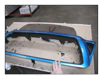
Picture #13: Optional A look at the grille shell with the center removed.