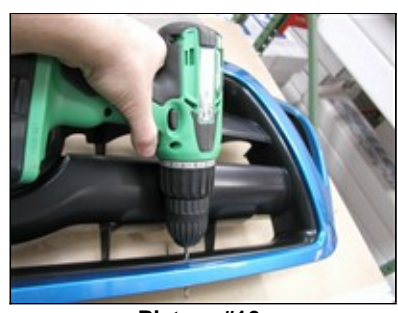
Picture #10: Drill lower mounting screw holes then fasten grille to the grille shell.