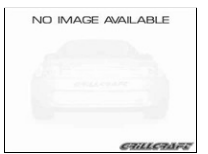
Picture #1: Here is the GrillCraft Custom Mesh Grille kit for the Toyota Tacoma.