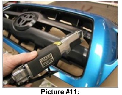
Optional cutting out the center is a option for a clean look it also makes inserting the grille screws easy.