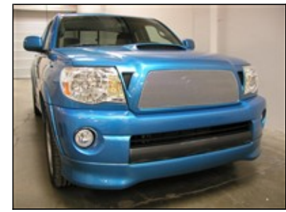
Picture #19: Shown here in silver color without cutting the grille shell center.