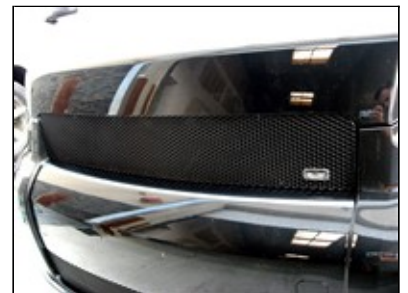
Picture #30: 2008 Scion XB shown with GrillCraft MX Series upper & lower mesh grille.