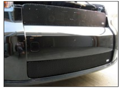
Picture #33: 2008 Scion XB shown with GrillCraft MX Series upper & lower mesh grille.