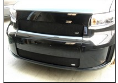
Picture #36: 2008 Scion XB shown with GrillCraft MX Series upper & lower mesh grille.