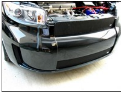
Picture #32: 2008 Scion XB shown with GrillCraft MX Series upper & lower mesh grille.