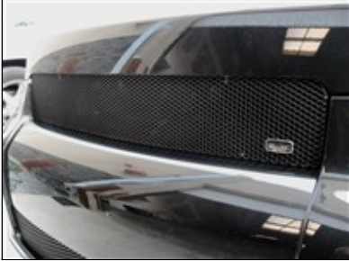
Picture #34: 2008 Scion XB shown with GrillCraft MX Series upper & lower mesh grille.