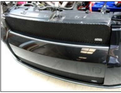
Picture #31: 2008 Scion XB shown with GrillCraft MX Series upper & lower mesh grille.