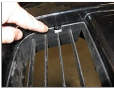
Picture #17: Cut a notch out of the factory grille insert for the GrillCraft grille tab as shown.