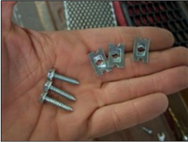
Picture #19: The lower grille mounting hardware. It is best to paint mounting hardware with flat black spray paint when installing a black grille.