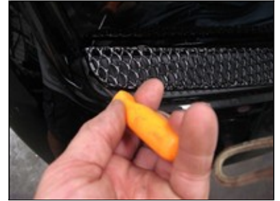
Picture #21: Insert the side vent grille into vent opening and mark mounting pin locations.