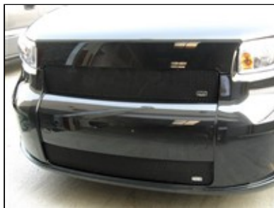
Picture #29: 2008 Scion XB shown with GrillCraft MX Series upper & lower mesh grille.