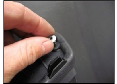
Picture #24: Place rubber washer and metal fastener onto mounting pin from the back side of bumper.