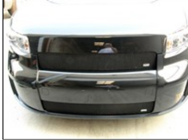
Picture #35: 2008 Scion XB shown with GrillCraft MX Series upper & lower mesh grille.