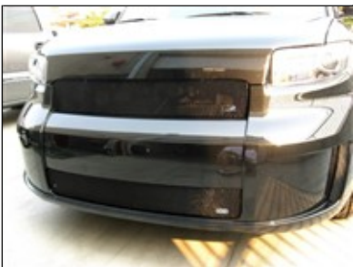
Picture #28: 2008 Scion XB shown with GrillCraft MX Series upper & lower mesh grille.