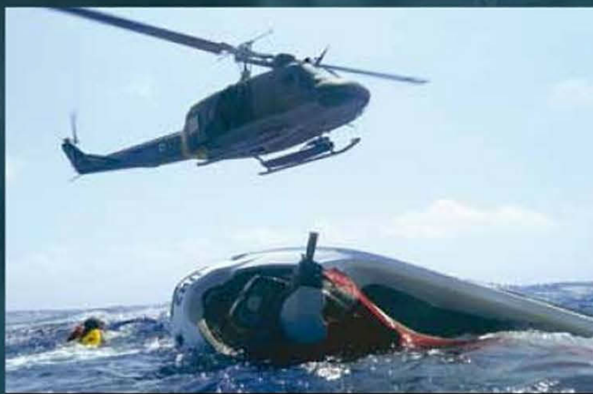
The Sea-Doo Ultimate Charity Ride Rescue - September 2010

PLBs are designed for personal use on the land, aviation and marine environments. PLBs are generally considered a multi-environment beacon. They are required to operate for a minimum of 24 hours once activated. PLBs are approved to a separate standard (AS/NZ 4280.2) and are not an acceptable substitute for mandatory EPIRB carriage under Australian State and Territory legislation.