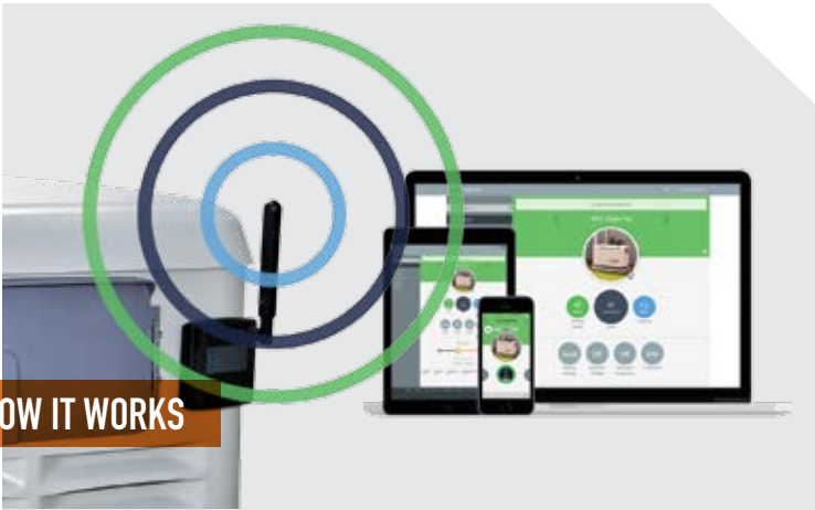
HOW IT WORKS