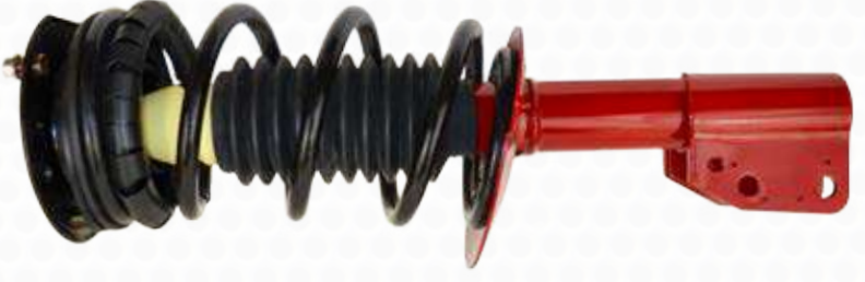
Guardian™ ReadyMount® (M56000/M57000 Series)