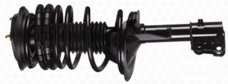
Ultra™ ReadyMount® (G56000/G57000 Series)