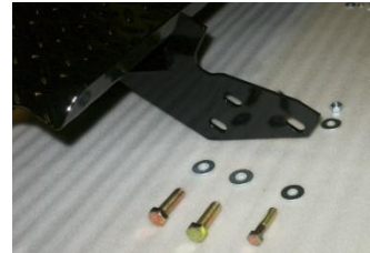
Bracket Side View