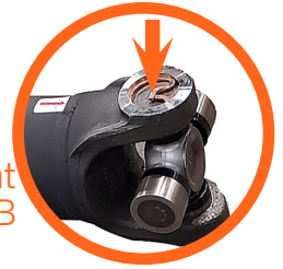
Measurement Point B