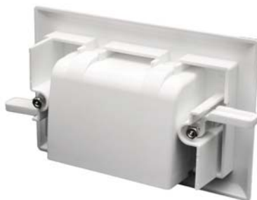
Installation Diagram - Front View

The new Slim Fit version is designed for use in concrete wall applications where the wall cavity is 3/4" to 1" in depth.