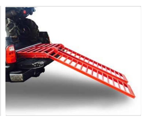
For Bed Sizes 95", 80" and 75"