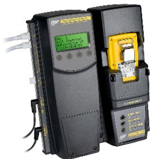
MicroDock II with module for GasAlertMicroClip detectors. (up to 6 modules on one base station)

(Note: when using Fleet Manager II software version 3.4.2 or lower (older), GasAlertMicroClip XL model detectors will simply appear as a GasAlertMicroClip XT detectors in the reporting. To have updated reporting labels, simply download the latest version of Fleet Manager II software from our website.)