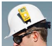
Hard Hat Clip