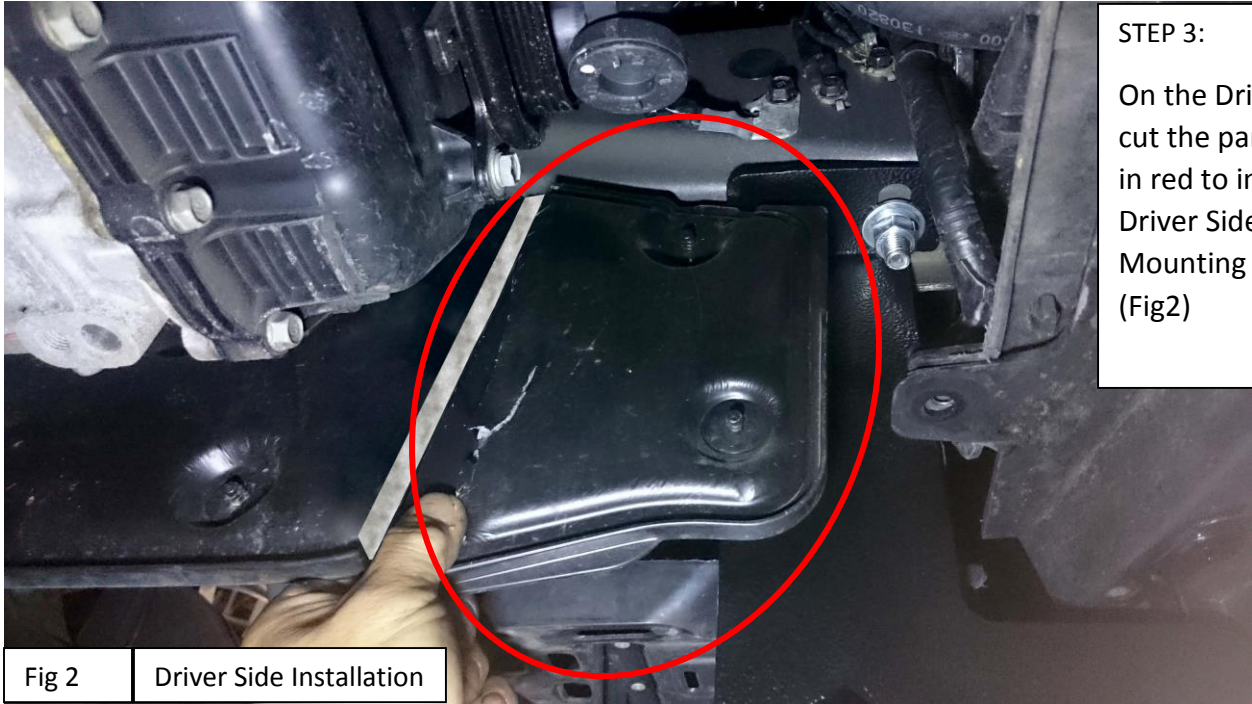
Fig 2 Driver Side Installation

STEP 3: On the Driver Side, cut the part circled in red to install the Driver Side Mounting Bracket. (Fig2)