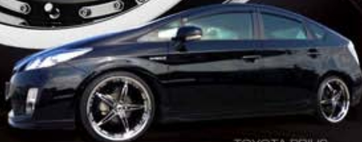
TOYOTA PRIUS MAYHEM 18x7.5