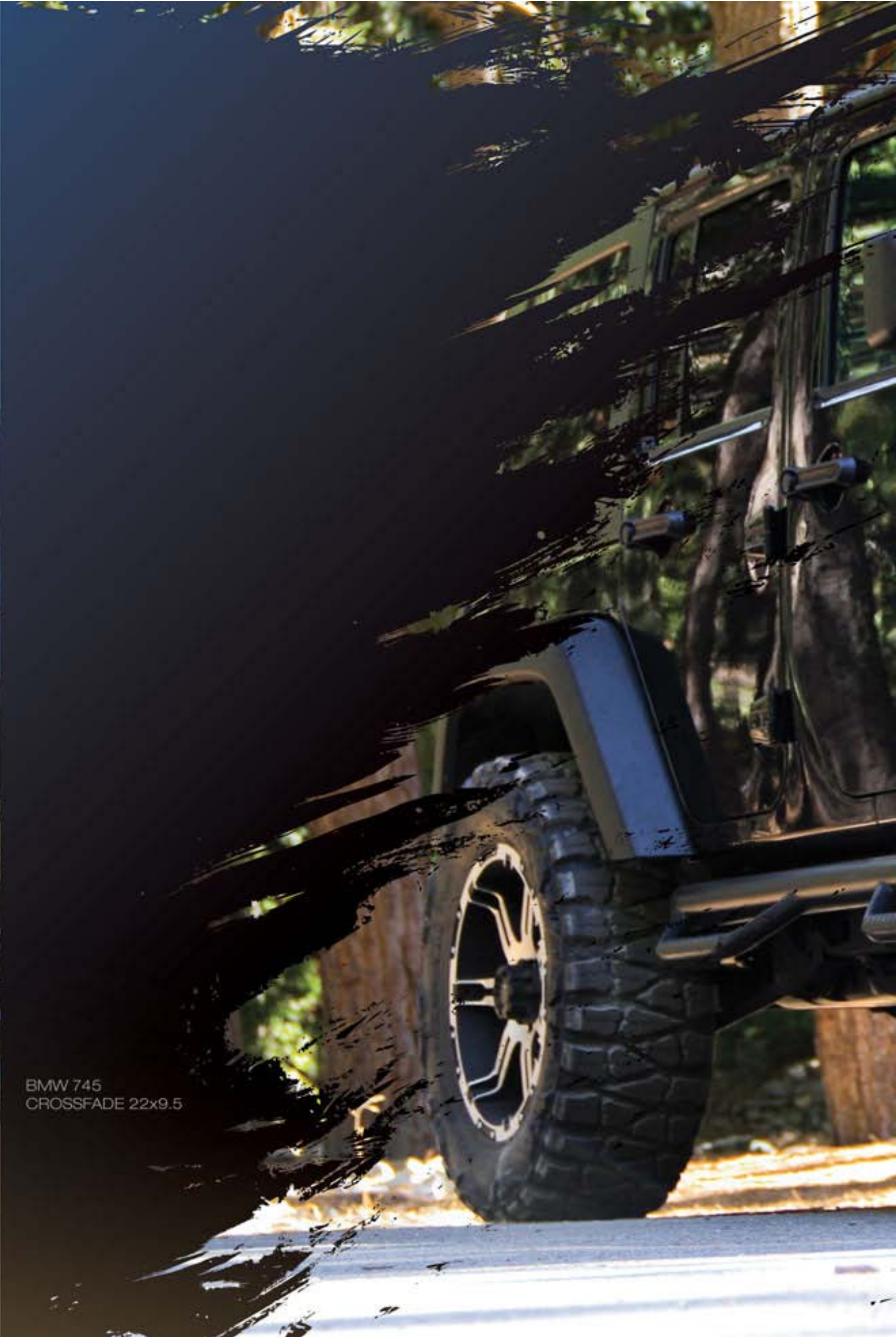
BMW 745 CROSSFADE 22x9.5