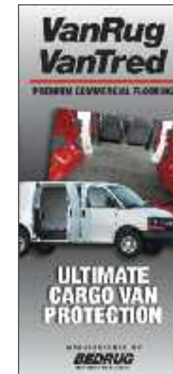
VAN TRI-FOLD BROCHURE PART#: VRT101