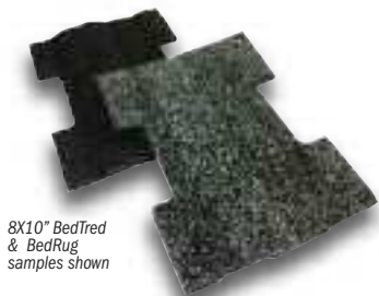
SAMPLES PART#: BRSMPLASM BRSMPLBABY BRSMPL4X6 BEDMATSAMPLE VTSMP4x6 BTSMP4x6 BTSMP4x6 DESCRIPTION: 8x10 BedRug sample & features card 8x10 BedRug sample 4x6 BedRug sample 4x6 BedMat sample 4x6 VanTred sample 8x10 BedTred sample 4x6 BedTred sample