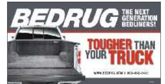
5 1/2' x 3' INDOOR/OUTDOOR BANNER PART#: BRNGBANNER