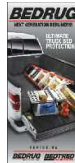
BEDRUG TRI-FOLD BROCHURE PART#: BR101