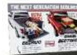
FLOOR DISPLAY 37.5" (W) x 49.5" (D) x 36.5" (H) Part#: SPLITMINBEDK Split Display Part#: BRMINBEDK BedRug Display Part#: BTMINBEDK BedTred Display