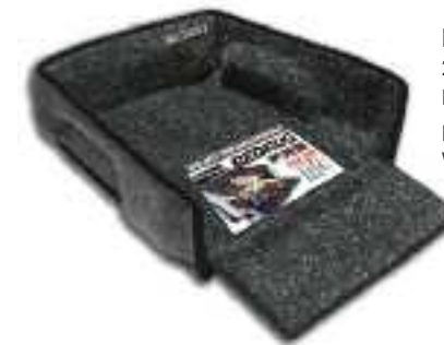
MINI DISPLAY 20" (W) x 13" (D) x 5" (H) Part#: BRPOPK BedRug Display Includes wire rack stand for a variety of displaying options.