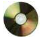
CDS PART#: BEDRUG MOVIE BR129 DESCRIPTION: Movie CD Media CD Image CD also available upon request