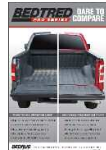
36" X 24" POSTER PART#: BRWTPOST