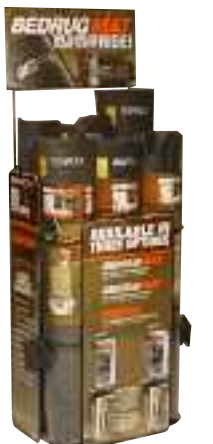
BEDRUG MAT POP DISPLAY