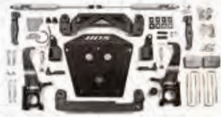
#813H - 7" Kit Shown w/ Optional FOX 2.0 Shocks