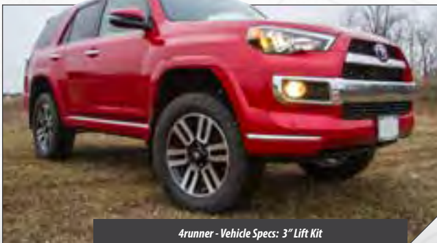
4Runner - Vehicle Specs: 3" Lift Kit