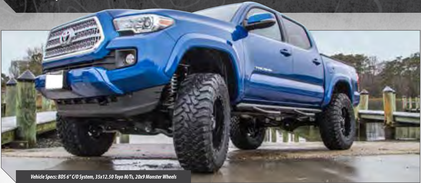
Vehicle Specs: BDS 6" C/O System, 35x12.50 Toyo M/Ts, 20x9 Monster Wheels