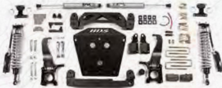
#819FDSC - 4.5" Kit w/ FOX 2.5 DSC Coilovers