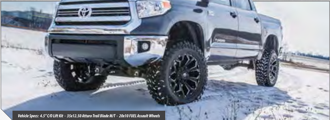
Vehicle Specs: 4.5" C/O Lift Kit - 35x12.50 Atturo Trail Blade M/T - 20x10 FUEL Assault Wheels