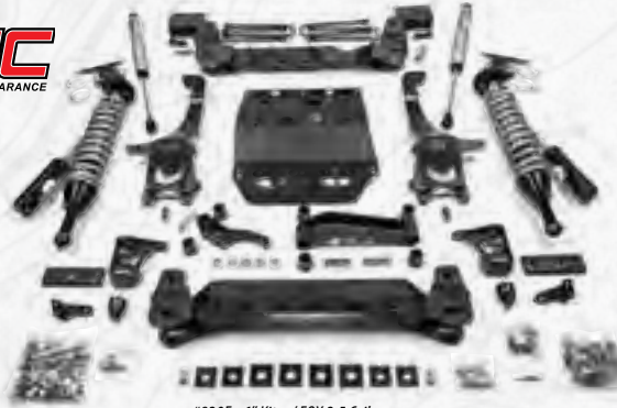
#820F - 6" Kit w/ FOX 2.5 Coilovers