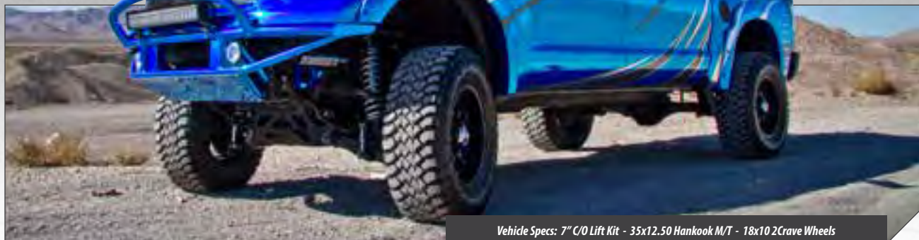
Vehicle Specs: 7" C/O Lift Kit - 35x12.50 Hankook M/T - 18x10 2Crave Wheels