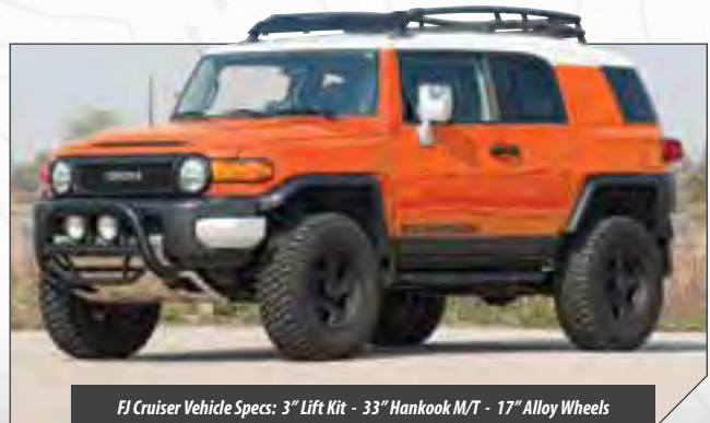
FJ Cruiser Vehicle Specs: 3" Lift Kit - 33" Hankook M/T - 17" Alloy Wheels

CHEVROLET/GMC DODGE FORD JEEP SUZUKI TOYOTA POSI-LOK SHOCKS/STEERING STABILIZERS ACCESSORIES APPAREL & PROMOTIONAL PRODUCT SPECS VEHICLE SPECS