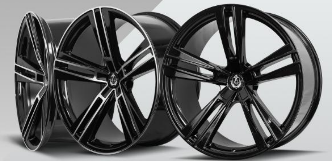
GLOSS BLACK | POLISHED FACE