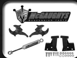
MCGAUGHY'S SUSPENSIONS PARTS!