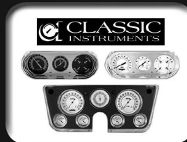
CLASSIC INSTRUMENTS GAUGES!