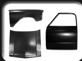
SHEET METAL BODY PANELS!