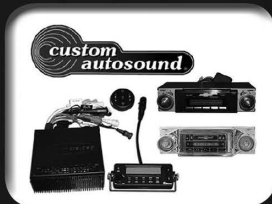
CUSTOM AUTOSOUND AUDIO SYSTEMS!