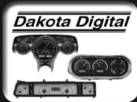
DAKOTA DIGITAL GAUGES!

*Please specify which catalog when ordering. One free catalog per person for US residents.