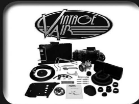
VINTAGE AIR GEN IV SURE FIT KITS!