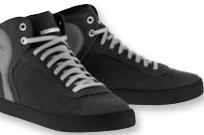
256 9014 1000 STEALTH BLACK