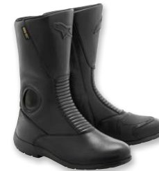
233 5012 10 BLACK