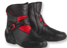
222 4014 13 BLACK RED