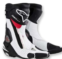
222 1013 128 BLACK WHITE RED VENTED