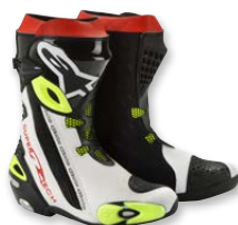
222 0012 125 BLACK WHITE YELLOW FLUO