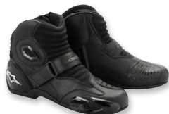
222 4012 10 BLACK