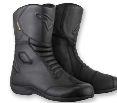
233 5013 10 BLACK