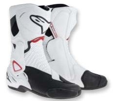
222 3014 203 WHITE BLACK RED VENTED