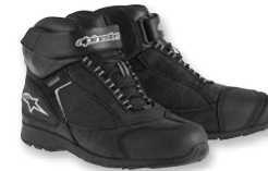
233 8014 10 BLACK