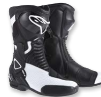
222 3114 122 BLACK WHITE VENTED