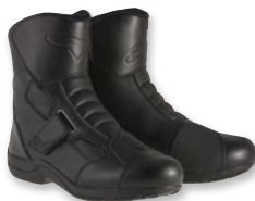
244 2015 10 BLACK