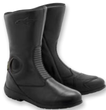
233 5112 10 BLACK