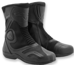
233 6012 10 BLACK