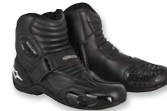
222 4513 10 BLACK