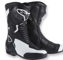
222 3114 12 BLACK WHITE