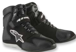
251 0014 12 BLACK WHITE