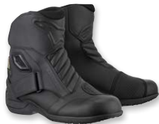
233 2013 10 BLACK