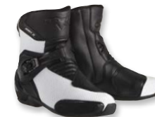
222 4014 122 BLACK WHITE VENTED