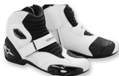
222 4012 21 WHITE BLACK