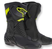
GORE-TEX® VERSION 233 3014 155 BLACK YELLOW FLUO