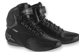
254 0315 1101 BLACK GUN METAL