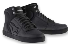
251 9014 1000 BLACK STEALTH