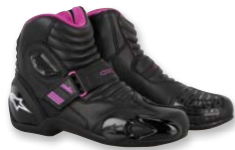
222 4613 1039 BLACK FUCHSIA