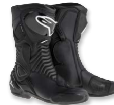
WATERPROOF VERSION 224 3015 10 BLACK