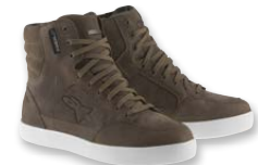
254 2015 80 BROWN