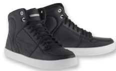
251 9014 10 BLACK