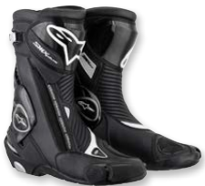
222 1013 10 BLACK