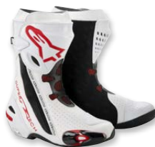
222 0012 23 WHITE RED VENTED