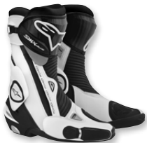
222 1013 12 BLACK WHITE