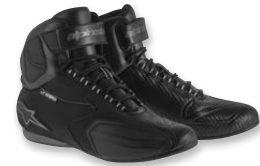
254 0215 1101 BLACK GUN METAL