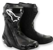
222 0012 10 BLACK