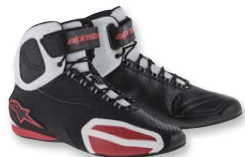
251 0214 123 BLACK WHITE RED