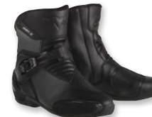
222 4014 10 BLACK