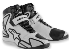
251 0014 202 WHITE GRAY BLACK