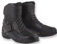
244 2514 10 BLACK