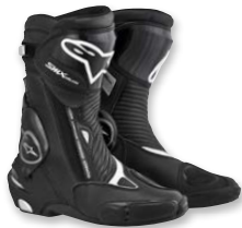
233 1013 10 BLACK GORE-TEX®