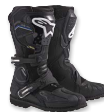
203 7014 10 BLACK