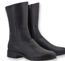
244 5513 10 BLACK