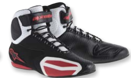
251 0314 123 BLACK WHITE RED