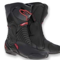
222 3014 13 BLACK RED