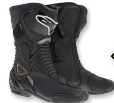
GORE-TEX® VERSION 233 3014 1090 BLACK CHAMPAGNE