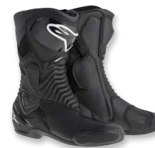
222 3014 100 BLACK VENTED