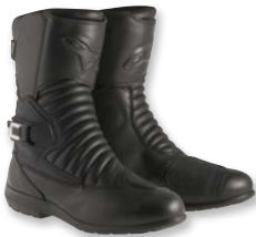
233 4015 10 BLACK