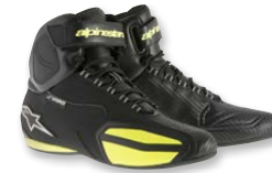
254 0215 155 BLACK YELLOW FLUO