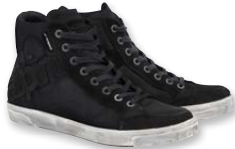
261 2013 10 BLACK