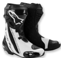
222 0012 12 BLACK WHITE