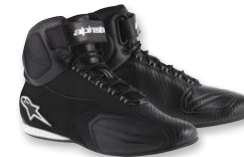
251 0314 10 BLACK