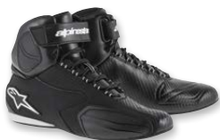
251 0214 10 BLACK