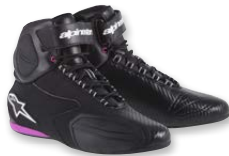
251 0414 139 BLACK PINK