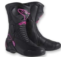
222 3114 139 BLACK PINK