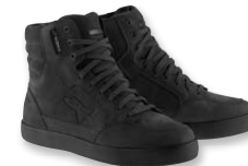
254 2015 10 BLACK