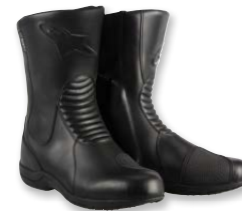
244 7014 10 BLACK