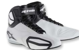
251 0314 106 BLACK GRAY