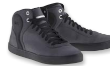
256 9014 982 SLATE BLACK