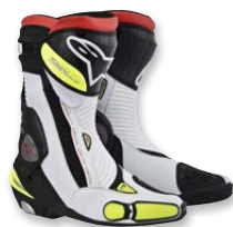
222 1013 125 BLACK WHITE YELLOW FLUO