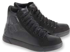
261 2414 1005 SHINY BLACK