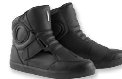
2543015 10 BLACK