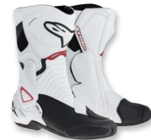
222 3014 213 WHITE BLACK RED