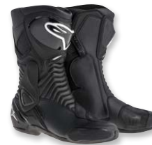
222 3014 10 BLACK