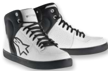
251 9014 1020 BLACK ICE WHITE