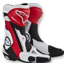
222 1013 132 BLACK RED WHITE