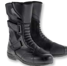
244 1014 10 BLACK