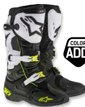
12 BLACK WHITE