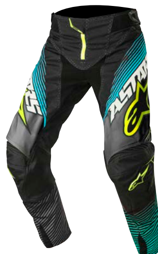
BLACK TEAL YELLOW FLUO 1074