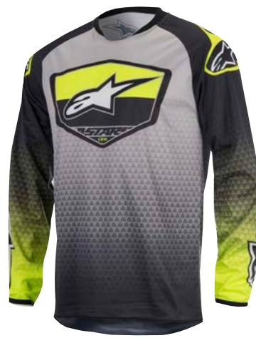
ANTHRACITE YELLOW FLUO LIGHT GRAY 1435