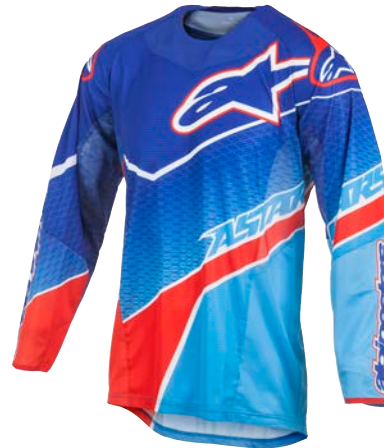
BLUE CYAN RED 773