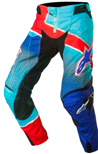
BLUE CYAN RED 773