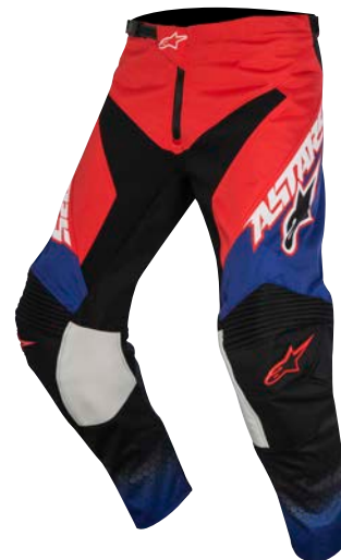
RED BLUE WHITE 307