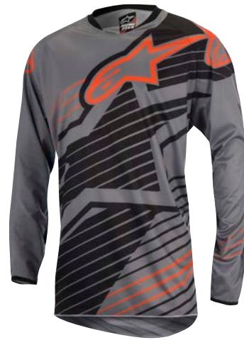
DARK GRAY BLACK ORANGE FLUO 914