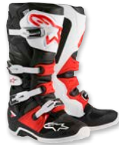
123 BLACK WHITE RED