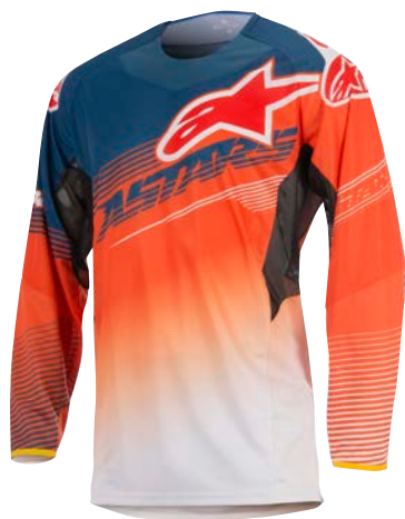
ORANGE FLUO DARK BLUE WHITE 473