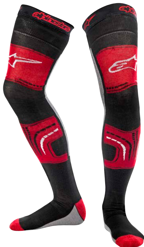
RED BLACK GRAY 311