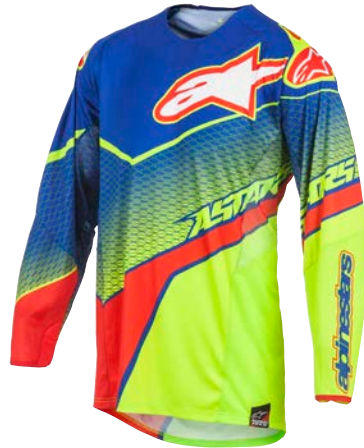
BLUE YELLOW FLUO RED 754