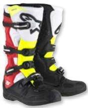
1235 BLACK WHITE RED YELLOW FLUO