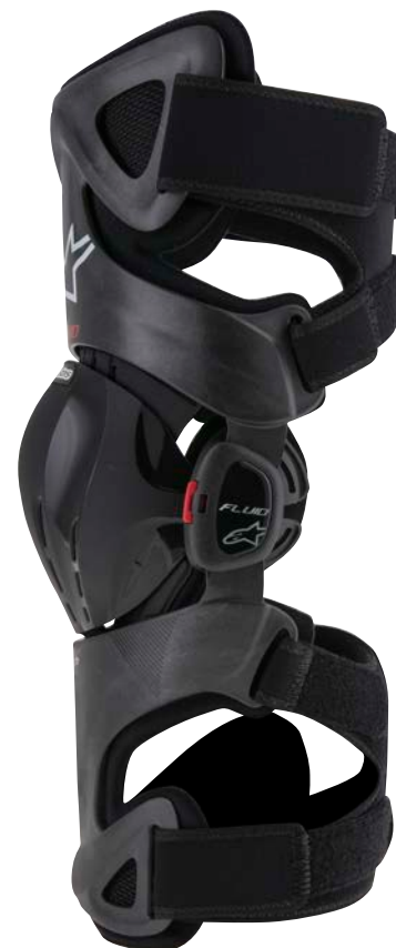
ANTHRACITE RED WHITE 1430