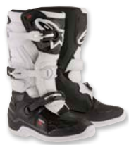
12 BLACK WHITE