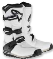
21 WHITE BLACK