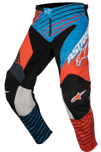
PETROL AQUA ORANGE FLUO 7074