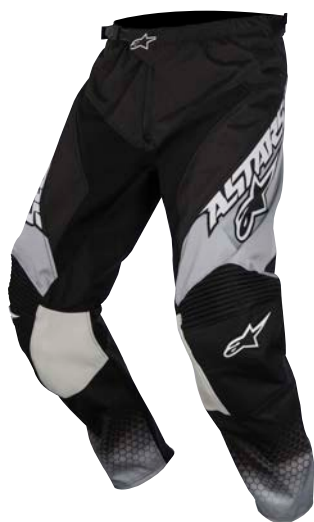
BLACK LIGHT GRAY WHITE 1093