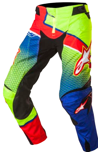
BLUE YELLOW FLUO RED 754