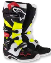
136 BLACK RED YELLOW