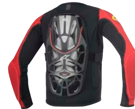
BLACK RED 13