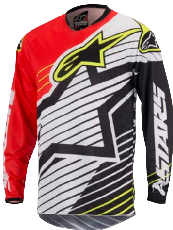
RED WHITE BLACK 321