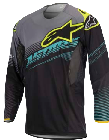
BLACK TEAL YELLOW FLUO 1074