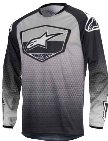
BLACK LIGHT GRAY WHITE 1093