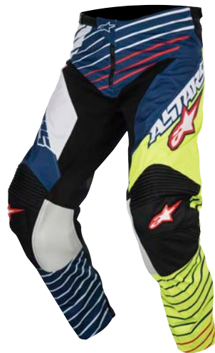
YELLOW FLUO WHITE DARK BLUE 527