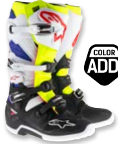
1427 BLACK ORANGE WHITE BLUE