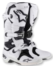
20 WHITE VENTED