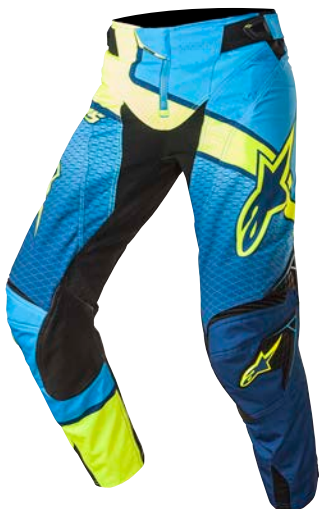
DARK BLUE CYAN YELLOW FLUO 7066