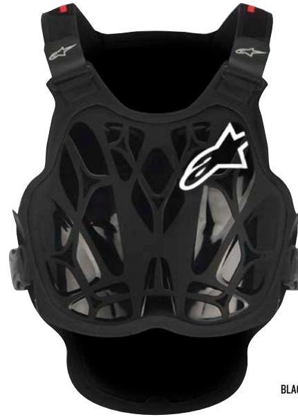
BLACK WHITE RED 123