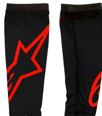
BLACK RED 13