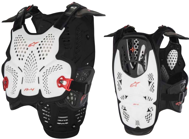
WHITE BLACK RED 213