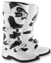
21 WHITE BLACK