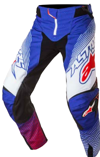
BLUE WHITE RED 723