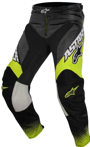
ANTHRACITE YELLOW FLUO LIGHT GRAY 1435