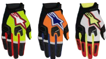
YELLOW FLUO BLACK RED 536