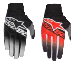
BLACK LIGHT GRAY WHITE 1093