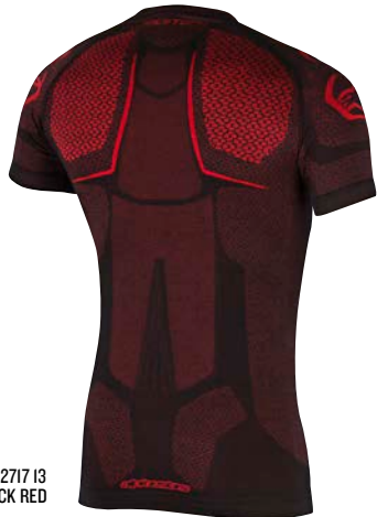
475 2717 13 BLACK RED