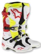
236 WHITE RED YELLOW FLUJO VENTED