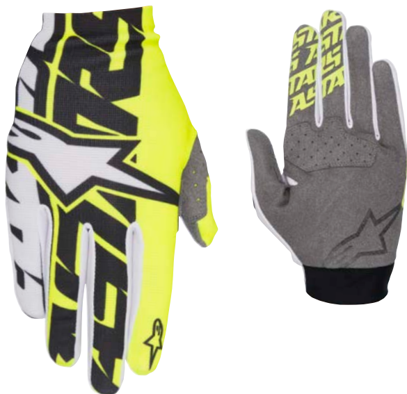
YELLOW FLUO BLACK WHITE 550