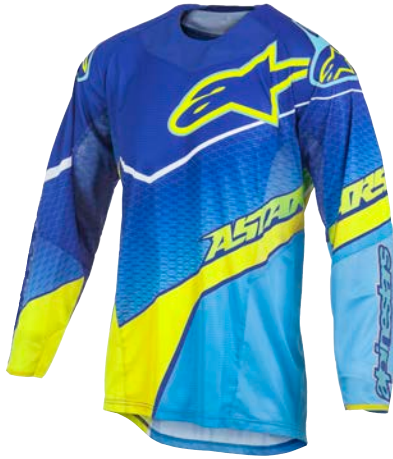
DARK BLUE CYAN YELLOW FLUO 7066