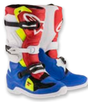
7025 BLUE WHITE RED YELLOW FLUO