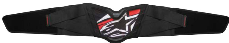
BLACK RED 13