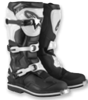
12 BLACK WHITE