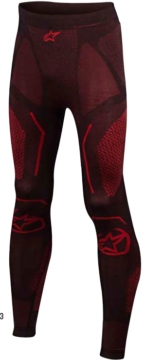
BOTTOM 475 2617 13 BLACK RED