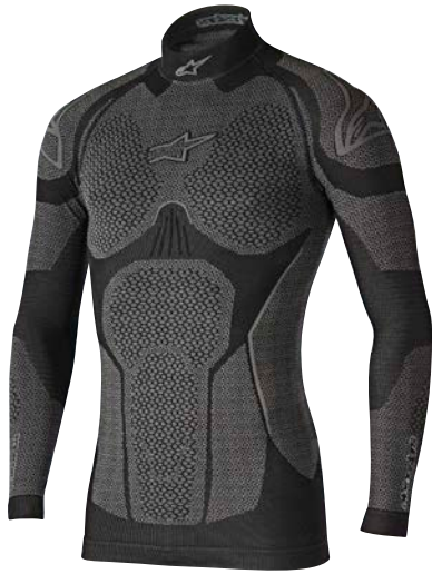
TOP 475 2117 108 BLACK GRAY