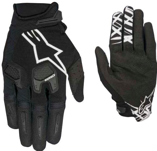
BLACK WHITE 12