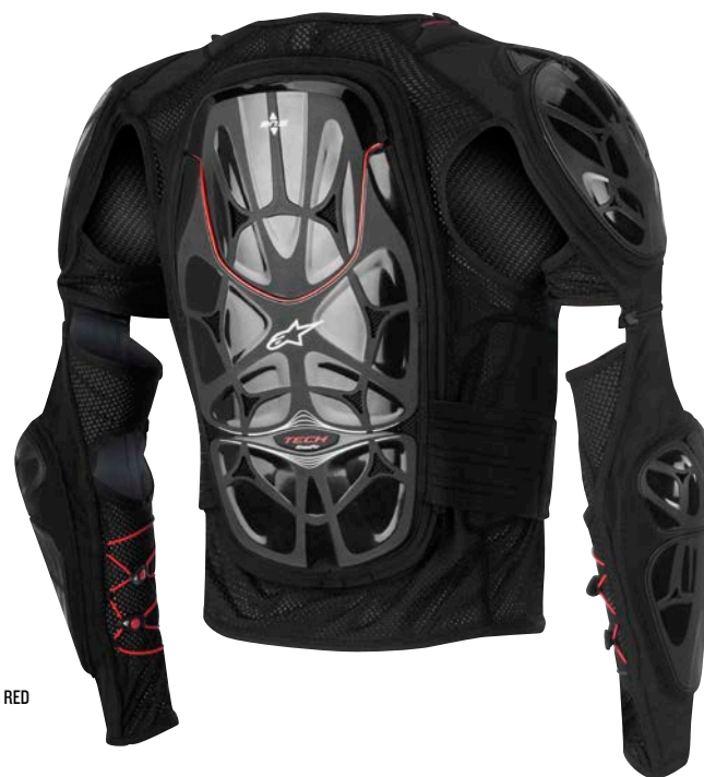
BLACK WHITE RED 123