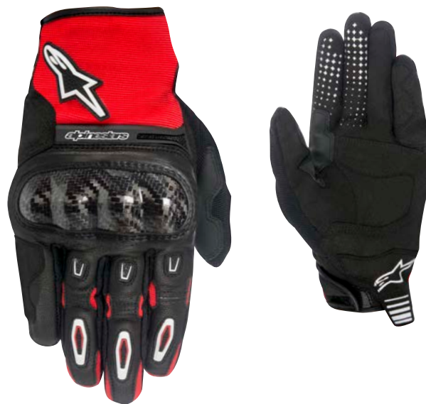
BLACK RED WHITE 132