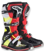
1362 BLACK RED YELLOW FLUO WHITE