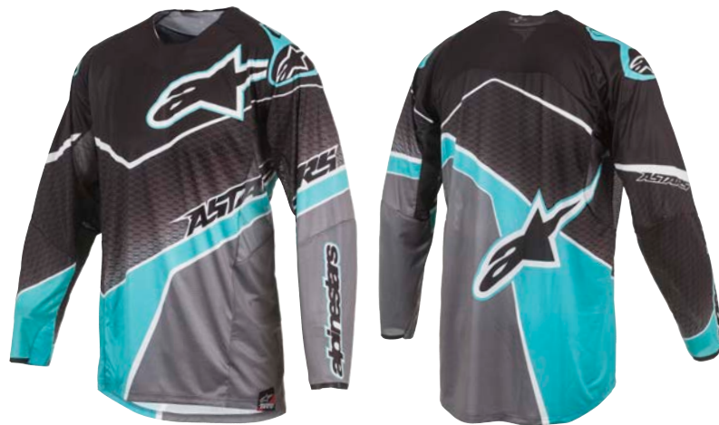
BLACK DARK GRAY TEAL 1016