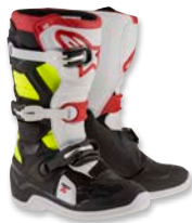
136 BLACK RED YELLOW FLUO