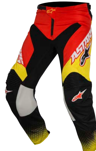
RED BLACK YELLOW 319