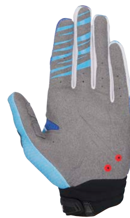
BLUE CYAN RED 773