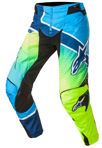
YELLOW FLUO CYAN DARK BLUE 577