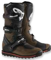
818 BROWN OILED