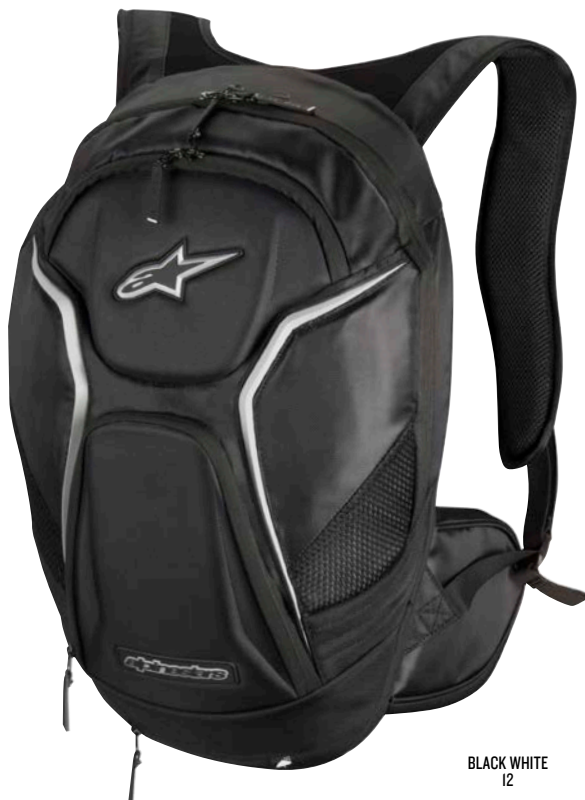
BLACK WHITE 12