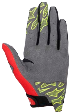
RED WHITE BLACK 321