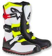
2351 WHITE RED YELLOW FLUO BLACK