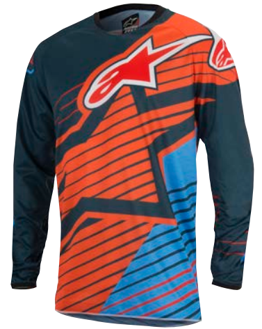
PETROL AQUA ORANGE FLUO 7074