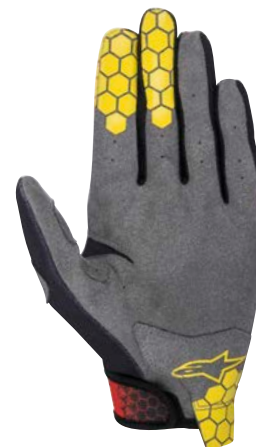
RED BLACK YELLOW 319