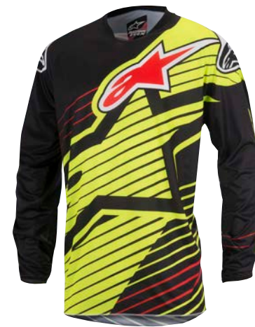
YELLOW FLUO BLACK 551