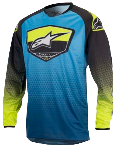
DARK BLUE CYAN YELLOW FLUO 7066