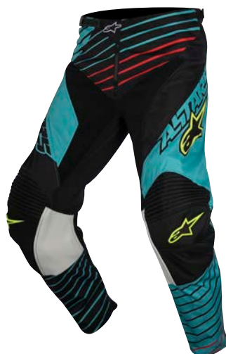
TEAL BLACK YELLOW FLUO 651