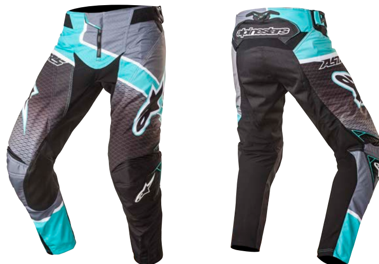
BLACK DARK GRAY TEAL 1016