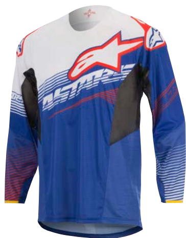
BLUE WHITE RED 723