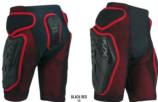
BLACK RED 13