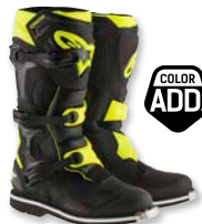
155 BLACK YELLOW FLUO