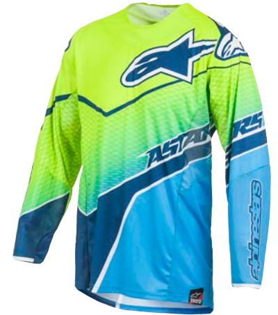
YELLOW FLUO CYAN DARK BLUE 577