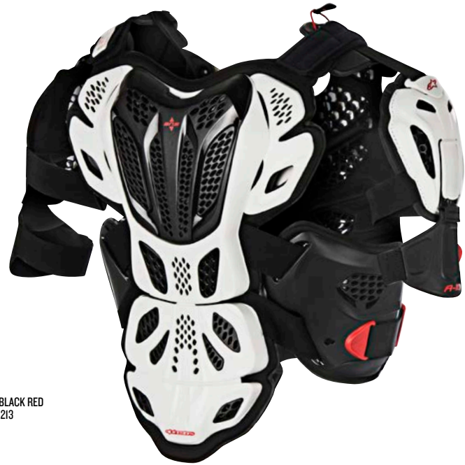
WHITE BLACK RED 213