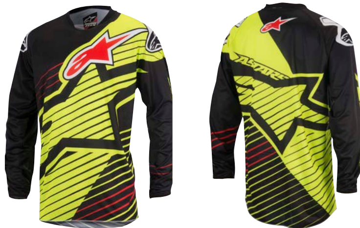
YELLOW FLUO BLACK 55I