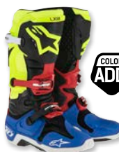
1537 BLACK YELLOW FLUJO BLUE RED