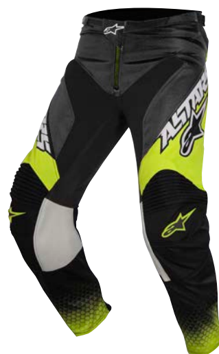
ANTHRACITE YELLOW FLUO LIGHT GRAY 1435