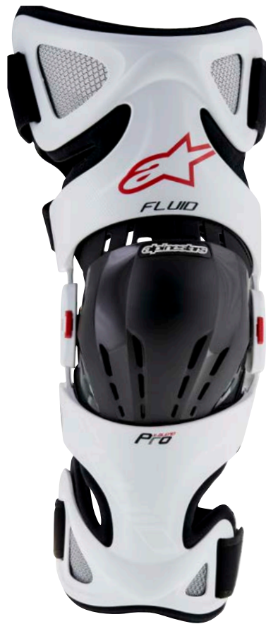
WHITE BLACK RED 213