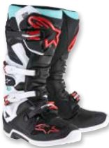
1071 BLACK TURQUOISE WHITE RED