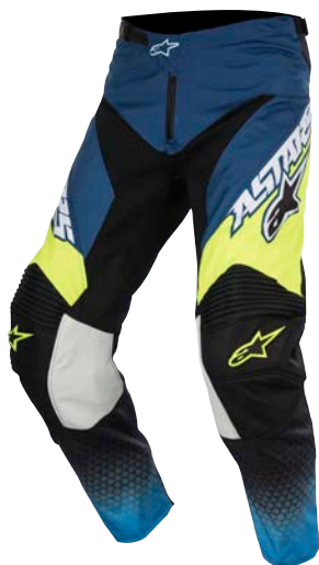
DARK BLUE CYAN YELLOW FLUO 7066