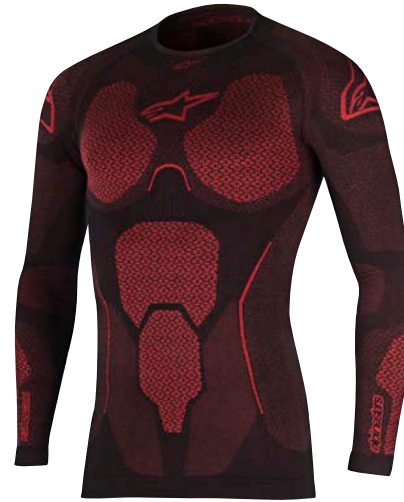
TOP 475 2517 13 BLACK RED