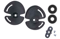
RACING ERGO FIT SPACER 6952616 10 BLACK