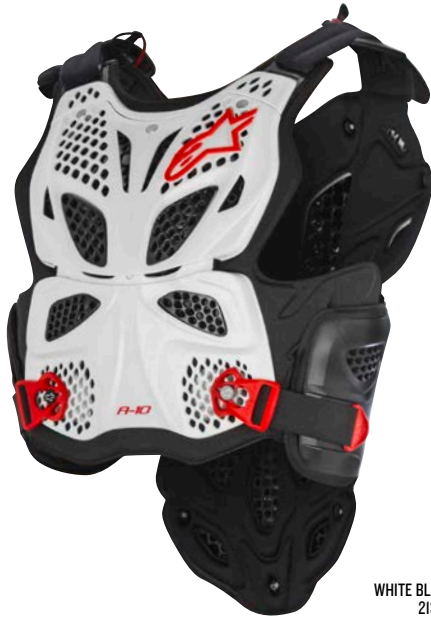
WHITE BLACK RED 213