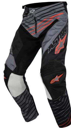
DARK GRAY BLACK ORANGE FLUO 914