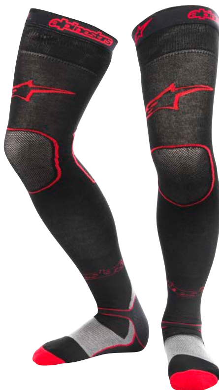
BLACK RED 13