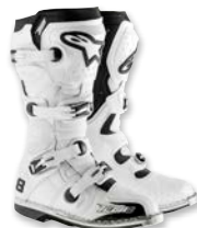
20 WHITE VENTED