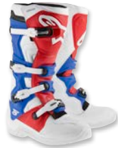
237 WHITE RED BLUE