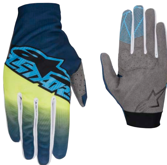
DARK BLUE YELLOW FLUO CYAN 7055