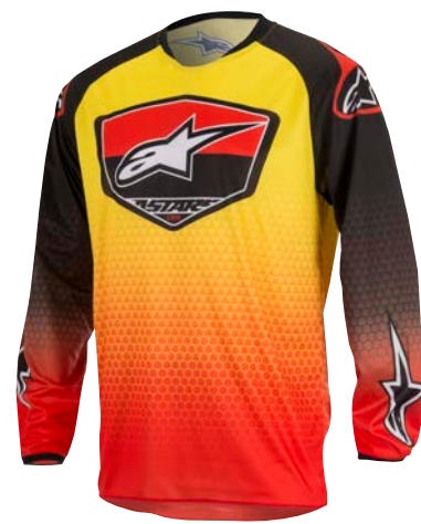
RED BLACK YELLOW 319