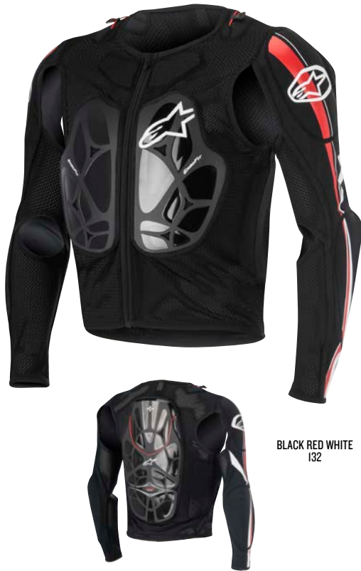
BLACK RED WHITE 132