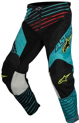
TEAL BLACK YELLOW FLUO 651