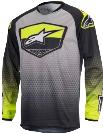
ANTHRACITE YELLOW FLUO LIGHT GRAY 1435