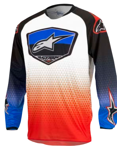
RED BLUE WHITE 307