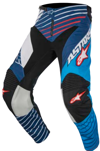
CYAN WHITE DARK BLUE 7027