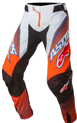
ORANGE FLUO DARK BLUE WHITE 473