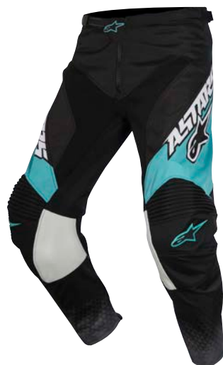
BLACK DARK GRAY TEAL 1016