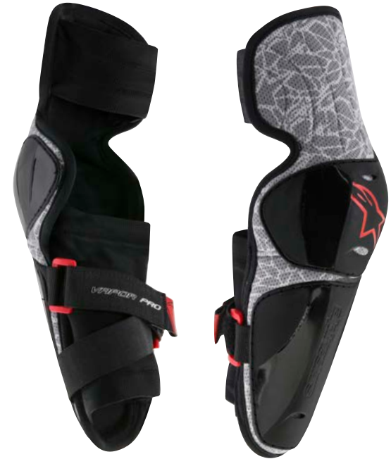
BLACK GRAY 106