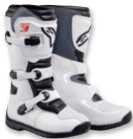
21 WHITE BLACK