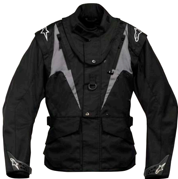
BLACK ANTHRACITE 104