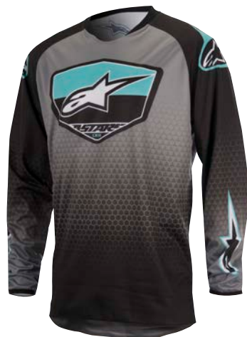
BLACK DARK GRAY TEAL 1016