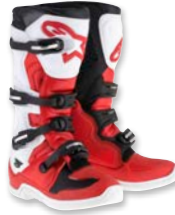
321 RED WHITE BLACK