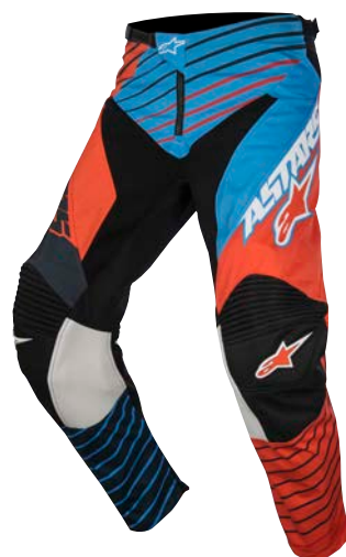
PETROL AQUA ORANGE FLUO 7074