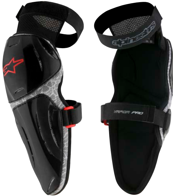
BLACK GRAY 106