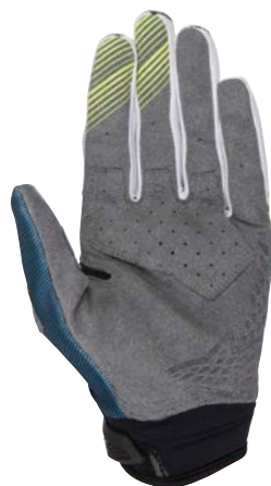
PETROL YELLOW FLUOR RED 7073