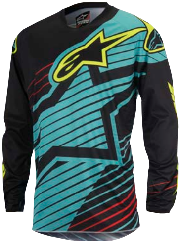
TEAL BLACK YELLOW FLUO 651