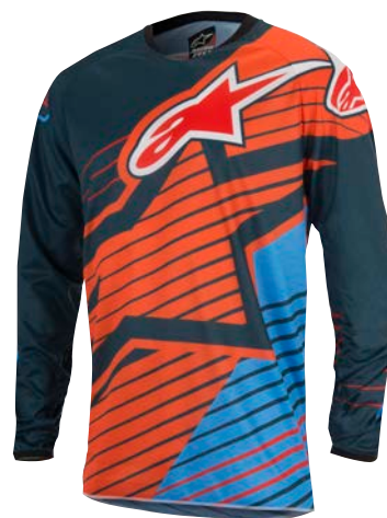
PETROL AQUA ORANGE FLUO 7074