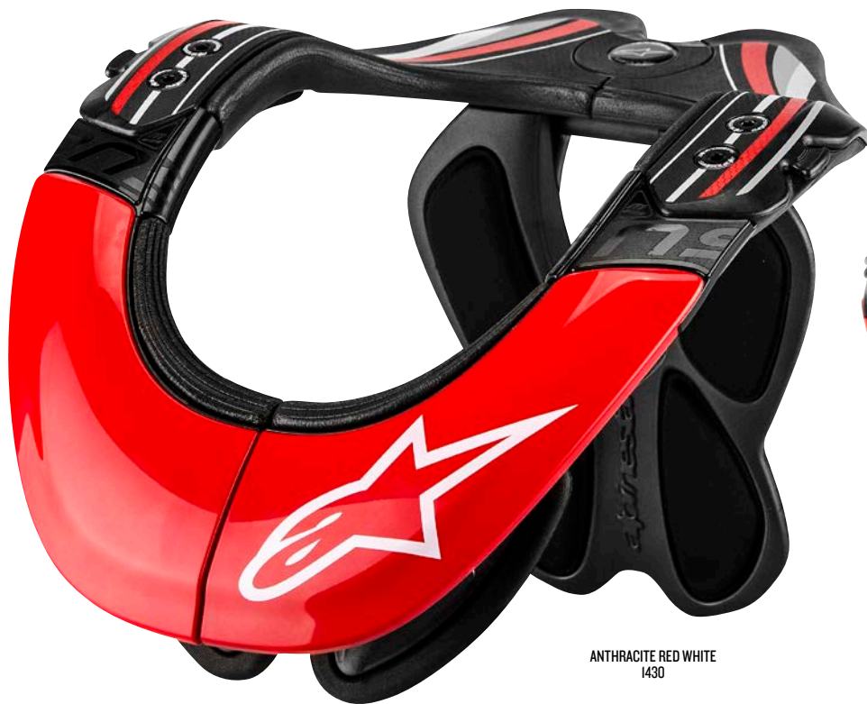
ANTHRACITE RED WHITE 1430