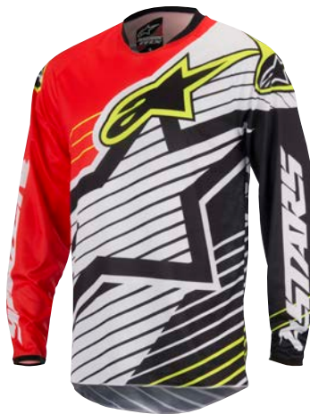
RED WHITE BLACK 321