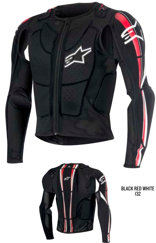
BLACK RED WHITE 132