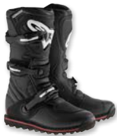
13 BLACK RED