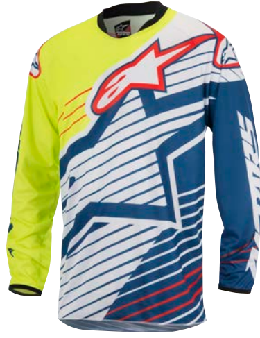
YELLOW FLUO WHITE DARK BLUE 527