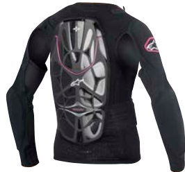
BLACK PURPLE 1360