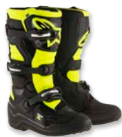
155 BLACK YELLOW FLUO