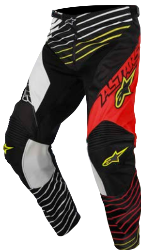
RED WHITE BLACK 321