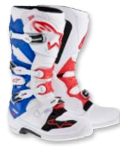
273 WHITE BLUE RED