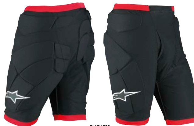
BLACK RED 13