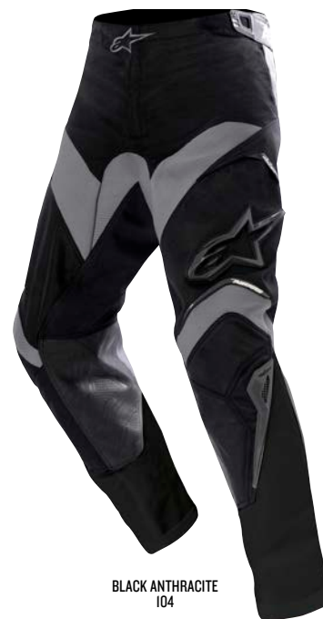
BLACK ANTHRACITE 104