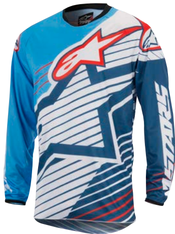
CYAN WHITE DARK BLUE 7027