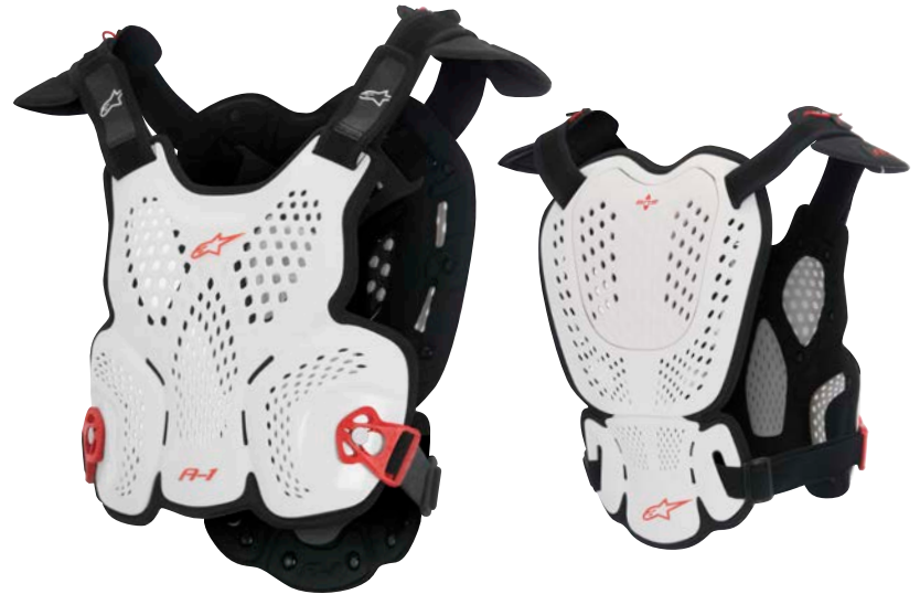
WHITE BLACK RED 213