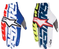
BLUE WHITE RED 723