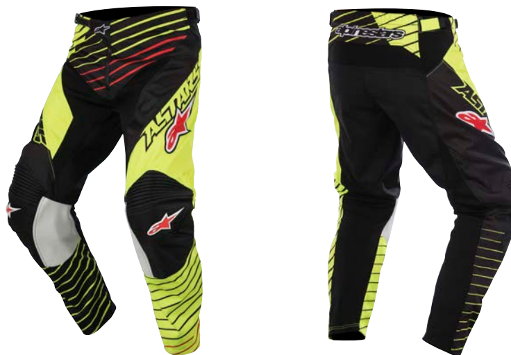
YELLOW FLUO BLACK 55I