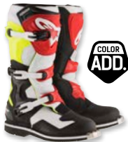
1053 BLACK WHITE YELLOW FLUO RED