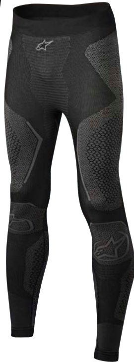
475 2217 106 BLACK GRAY