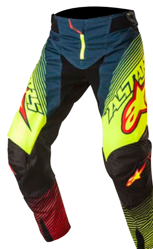
PETROL YELLOW FLUO RED 7073