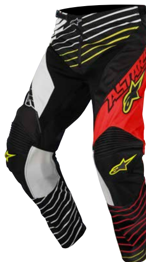
RED WHITE BLACK 321