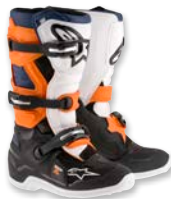
1427 BLACK ORANGE WHITE BLUE