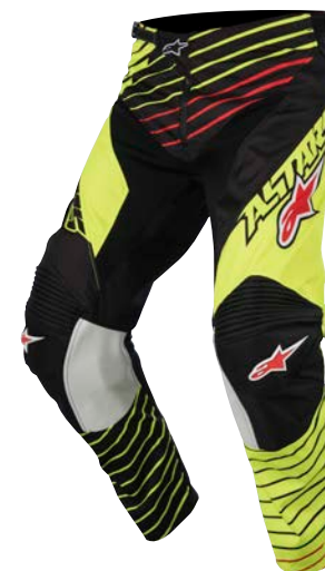
YELLOW FLUO BLACK 551