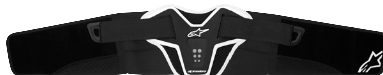
BLACK WHITE 12