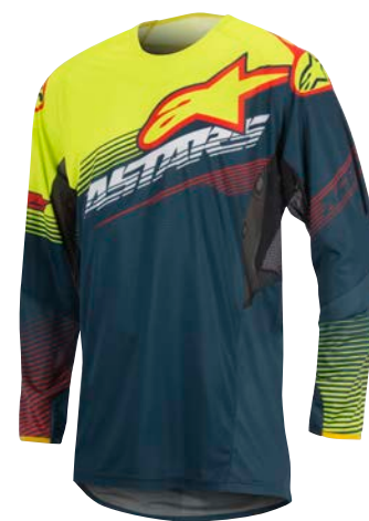
PETROL YELLOW FLUO RED 7073