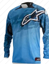
707 BLUE CYAN