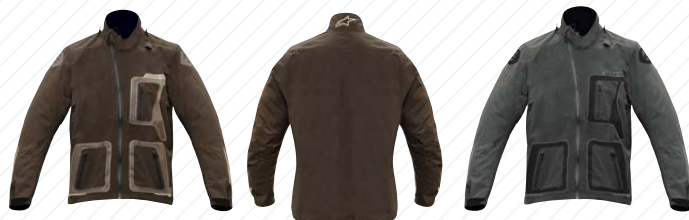
890 DARK BROWN SAND

Optimized for use with the Crest WP Pants. Waterproof outer shell features taped seams to provide an effective barrier against the elements. Elongated profile offers cover to the hip area. Zippered air intakes for highly effective climate control. Pre-bent multi-panel sleeve construction for superior fit in the riding position. Two-way, waterproof zipper main closure. External welded pockets with waterproof zippers. Soft microfiber collar enhances comfort while reducing chafing. Reinforced elbow construction. Integrated flat Hook and loop fastener wrist closure. Internal waist shock cord offers an adjustable fit. Smooth inner construction enables seamless integration with Bionic Protection Jackets.