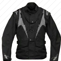
104 BLACK ANTHRACITE