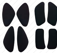
SOFT INSERT PAD SET FOR BNS (6MM AND 10MM) 695 1214 10 BLACK