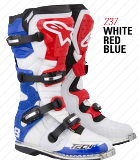
237 WHITE RED BLUE