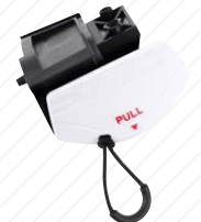
BNS CLOSURE SYSTEM 695 1414 12 BLACK WHITE