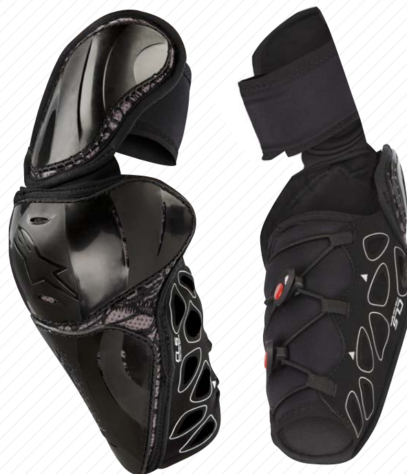
1001 BLACK/GRAY GRAPHIC

Creative silicone printed graphic pattern.