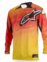
435 ORANGE RED YELLOW