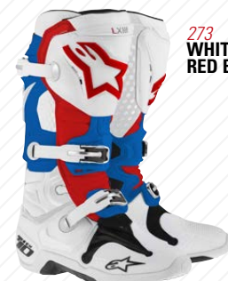
273 WHITE RED BLUE