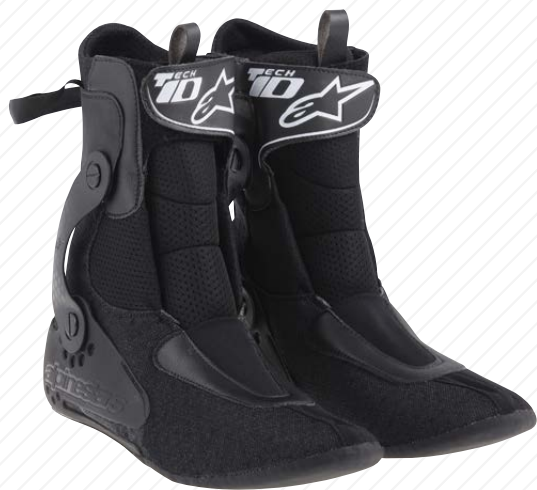
ANKLE BRACE SYSTEM

For the development team working on the Tech 10, several key objectives were apparent at the outset and refinements to this revolutionary concept have been made ever since. The first objective was to improve the performance of the boot's safety structure over existing technologies. More traditional boots have ankle protection and support built inside their construction and to improve on the concept and bring the protection closer to the body, a new inner brace was developed. Having discarded the use of a single hinge boot system, (a concept Alpinestars had developed and patented designs for in the mid-80's, but never adopted because of excessive stress put on the knee) a revolutionary solution was developed. Using some of the lessons learned in the company's road racing program, where the Alpinestars Supertech boot leads the way with its unique torsion bar ankle support, the new MX brace features a patented double-hinged assembly. However, the Tech 10 brace shares no common components with the Supertech version, having been designed specifically to cope with the particular demands of MX riding and has already been through several design modifications to yet further improve performance.