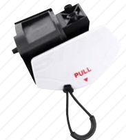
BNS CLOSURE SYSTEM 695 1414 12 BLACK WHITE