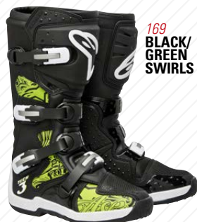
169 BLACK/ GREEN SWIRLS