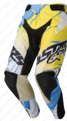
752 CYAN YELLOW WHITE