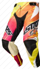
543 YELLOW ORANGE RUBINE