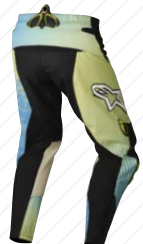
667 LIME GREEN/ CYAN