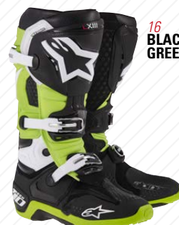
16 BLACK GREEN