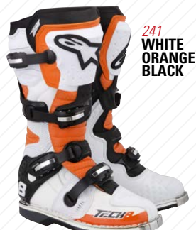
241 WHITE ORANGE BLACK