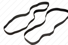
X-STRAPS FOR BNS 695 0214 10 BLACK