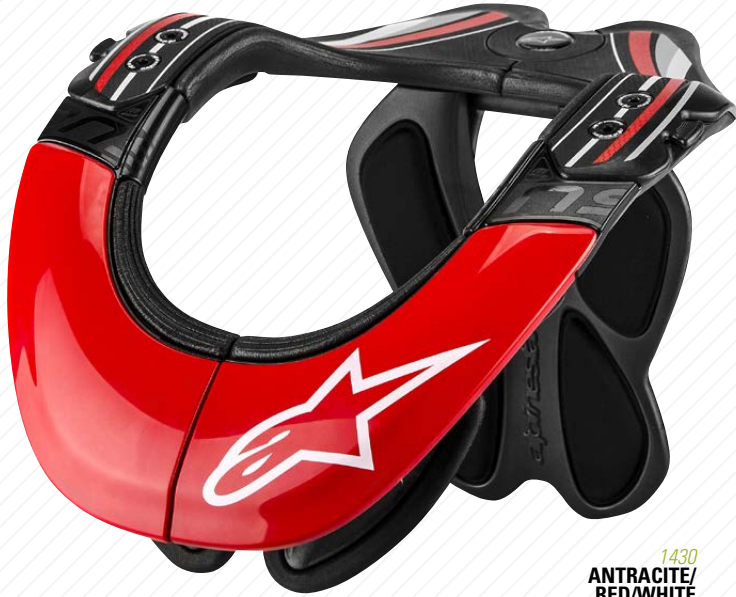
1430 ANTRACITE/ RED/WHITE