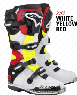
253 WHITE YELLOW FLUO RED