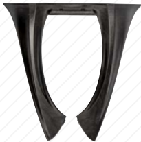
ATTACHMENT PLATE FOR BNS TECH CARBON 695 0014 10 BLACK

Compressed EVA foam compound padding to distribute the impact force over the widest area, yet remain lightweight.