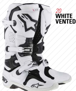
20 WHITE VENTED