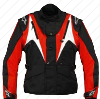
13 BLACK RED

Technical off-road and enduro performance riding jacket. Durable Nylon and Polyester fabric construction provides excellent abrasion resistance. Multiple stitched main seam construction for superior resistance against tearing. Pre-bent multi-panel sleeve construction affords an excellent fit in the riding position. Reinforced and 3D elbow construction with padded reinforcements for greater impact protection. Removable collar designed to accommodate the Bionic Neck Support and most neck brace systems on the market. Detachable sleeves allow the jacket to be worn as a vest. Front zippered air intakes and rear exhaust vents for highly effective climate control. 4 front pockets and 1 large pocket on the back. Convenient three-section front flap allows the jacket to be configured for greater airflow Flip out pass holder. Internal hydration pack compartment on the back with integrated pipe hold system. D-ring waist Hook and loop fastener adjustment and Hook and loop fastener wrist closure ensure a snug, tailored fit. Neoprene borders on cuffs for added comfort.