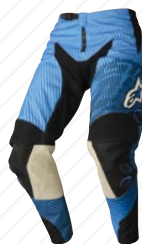
707 BLUE CYAN