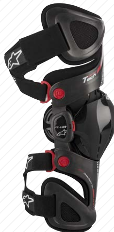
650 0314 1430 FLUID CARBON TECH RIGHT ANTHRACITE/RED/WHITE