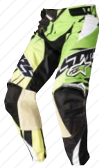
160 BLACK GREEN LIME