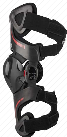
650 0414 1430 FLUID CARBON TECH LEFT ANTHRACITE/RED/WHITE