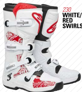
230 WHITE/ RED SWIRLS