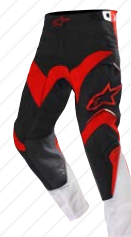
13 BLACK RED

Durable Nylon and polyester fabric construction for excellent abrasion resistance. Alpinestars patented 'Vector' design back panel provides maximum comfort and flexibility. Pre-bent multi-panel leg construction for excellent fit in the riding position. Reinforced and padded 3D knee construction with medial leather panel for improved heat resistance. Heavy nylon reinforcements on the seat area for enhanced abrasion resistance. Lightweight, ventilated mesh liner for superior riding comfort. Ratchet buckle waist adjustment provides a tailored fit Hidden front zipper. Stretch ankle cuffs prevent excessive movement of the pant while riding.