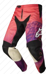
383 RED PURPLE