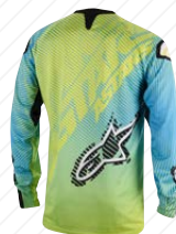
667 LIME GREEN CYAN

Cut longer in back to help fit and compatibility with Alpinestars MX pants.