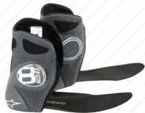
INTERNAL ANKLE SLEEVE

Upper constructed from a combination of full grain leather and innovative and light microfiber that is flexible and abrasion resistant.