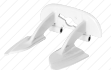
ATTACHMENT PLATE 695 000 20

SUBSTANTIAL STRAP SYSTEM WHICH SECURES THE BNS ONTO THE RIDER WITH THE AID OF A CHEST STRAP.