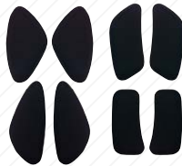
SOFT INSERT PAD SET FOR BNS (6MM AND 10MM) 695 1214 10 BLACK