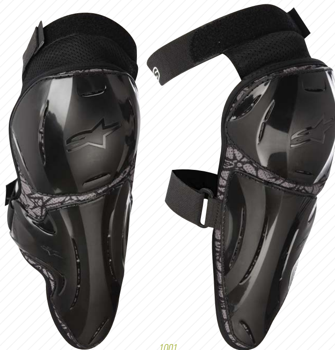
1001 BLACK/GRAY GRAPHIC

Creative silicone printed graphic pattern.