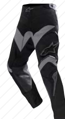
104 BLACK ANTHRACITE