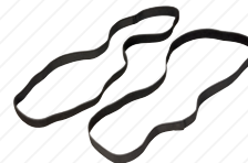
X-STRAPS FOR BNS 695 0214 10 BLACK