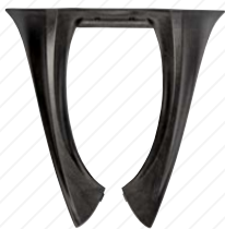
ATTACHMENT PLATE FOR BNS PRO 695 0114 10 BLACK

Category 2 CE certified under the PPE Directive (89/686/EEC).