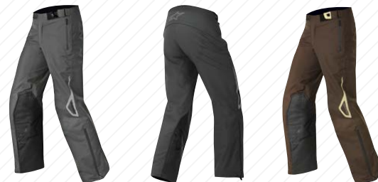
190 GRAY SILVER

Waterproof outer shell features taped seams to provide an effective barrier against the elements Designed to allow knee protection to be worn underneath the pant while fitting over the top of boots to provide superior weather protection coverage Pre-bent multi-panel legs construction provides an excellent fit in the riding position Articulated rear yoke for maximum freedom of movement 3D knee construction with medial leather panel for improved heat resistance Waterproof zippers 2 side pockets Extra long waterproof zipper on the side of the pant enables easy access for boot fitment.