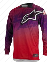
383 RED PURPLE