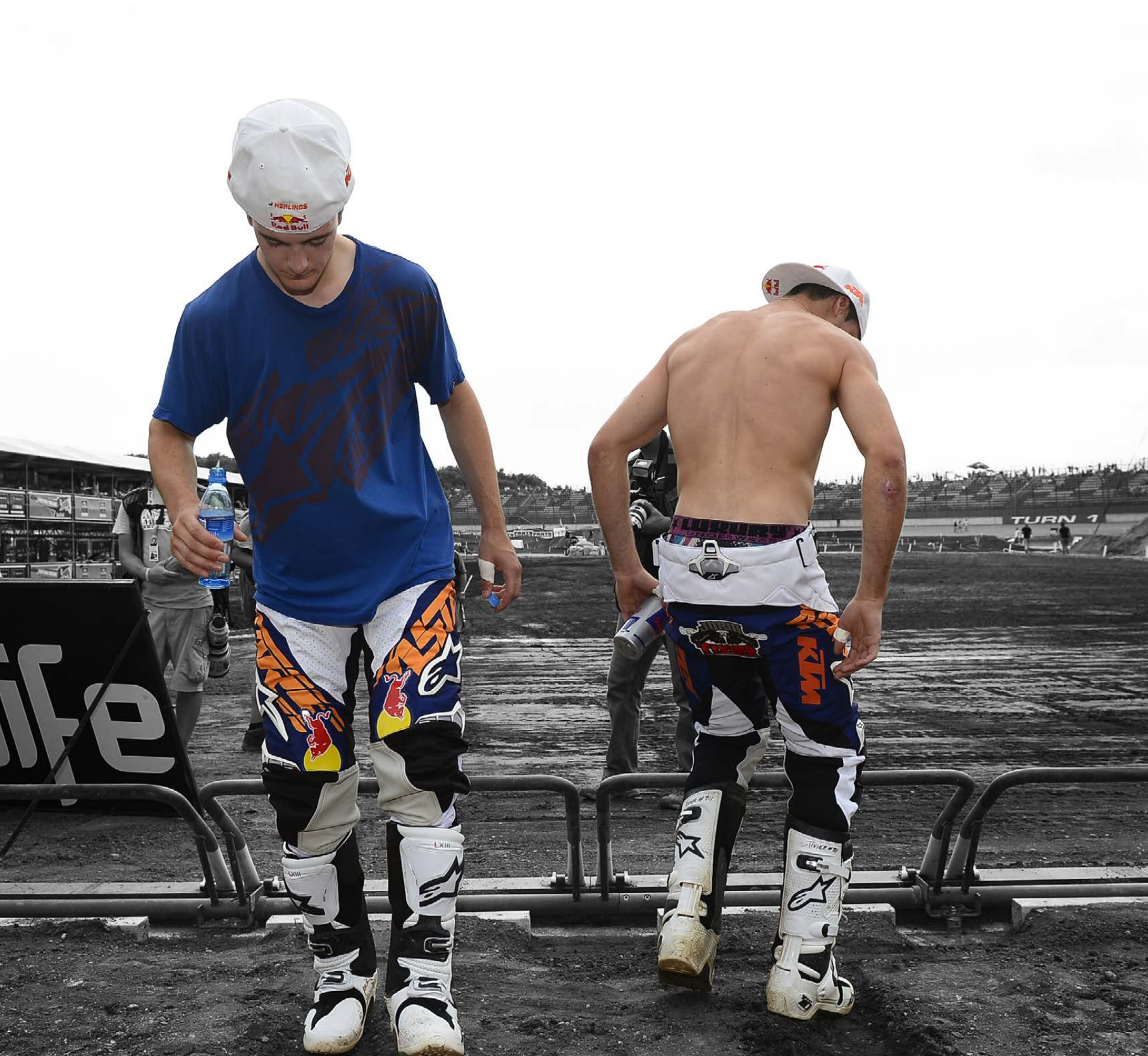
When it comes to quality motorcycle body armor and protection, Alpinestars is the brand you can depend on.