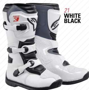
21 WHITE BLACK