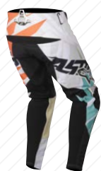
247 WHITE ORANGE MARINE