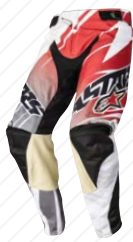
238 BLACK RED