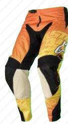
435 ORANGE RED/ YELLOW