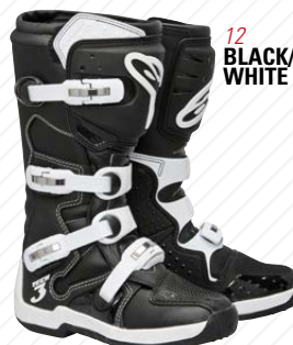
12 BLACK/ WHITE