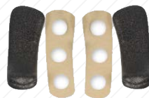
FOAM PARTS KIT 695 0112

ALLOWS REPLACEMENT OF THE KEYHOLE PLATE SHOULD IT BE DAMAGED IN AN IMPACT.