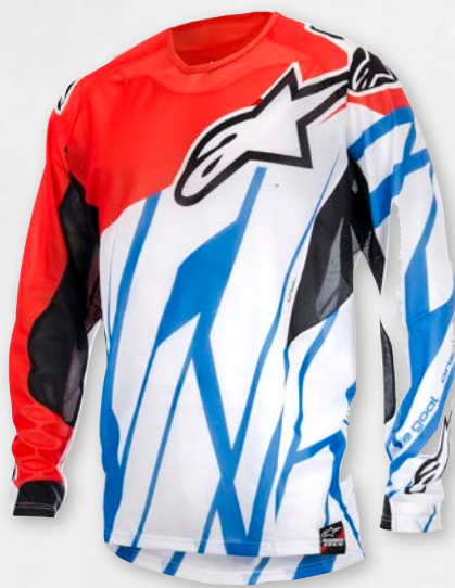
307 RED WHITE BLUE