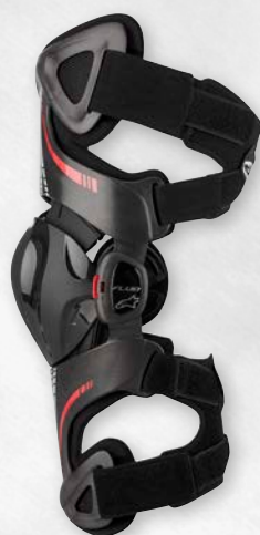
650 0414 1430 FLUID CARBON TECH LEFT ANTHRACITE RED WHITE