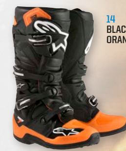
14 BLACK ORANGE