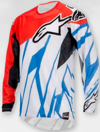
307 RED BLUE WHITE