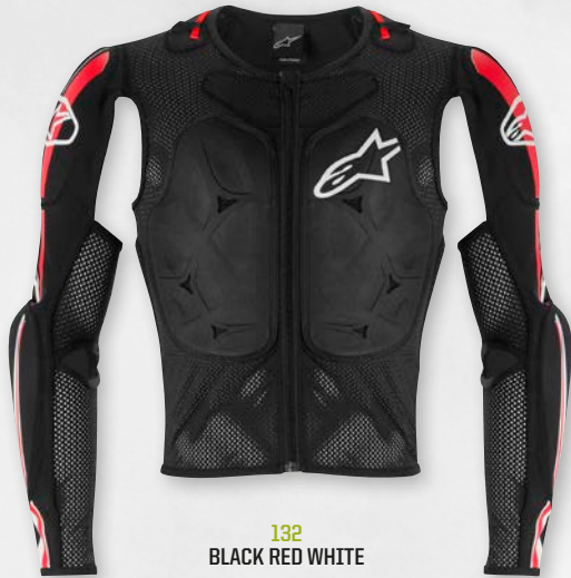
132 BLACK RED WHITE