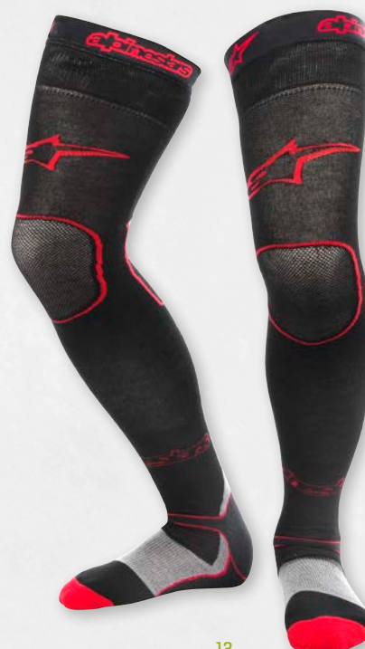
13 BLACK RED