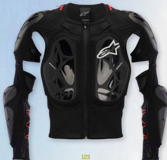
123 BLACK WHITE RED