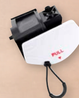
BNS CLOSURE SYSTEM 695 1414 12 BLACK WHITE