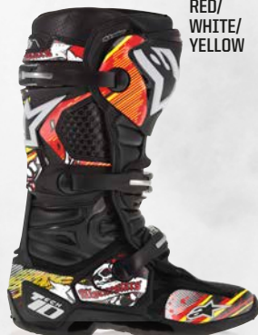
325 RED/ WHITE/ YELLOW