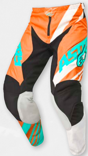
426 ORANGE WHITE TEAL