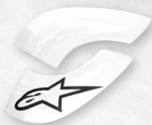
CHIN PLATE FOR BNS PRO 695 1114 21 WHITE BLACK