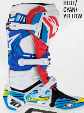
775 BLUE/ CYAN/ YELLOW