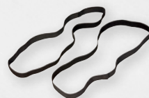
X-STRAPS FOR BNS 695 0214 10 BLACK