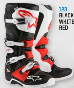
123 BLACK WHITE RED