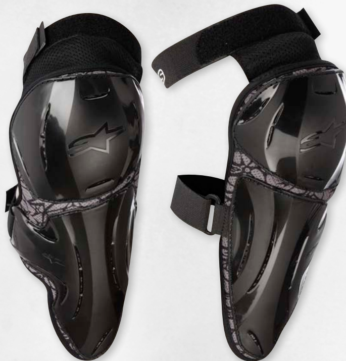
1001 BLACK/GRAY GRAPHIC