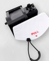
BNS CLOSURE SYSTEM 695 1414 12 BLACK WHITE