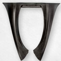
ATTACHMENT PLATE FOR BNS PRO 695 0114 10 BLACK