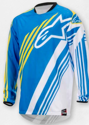
725 BLUE WHITE YELLOW