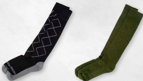
106 BLACK GRAY