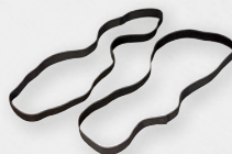
X-STRAPS FOR BNS 695 0214 10 BLACK