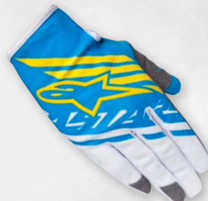
725 BLUE WHITE YELLOW