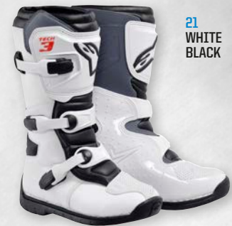
21 WHITE BLACK