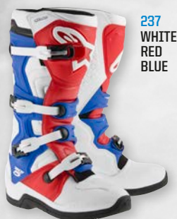
237 WHITE RED BLUE