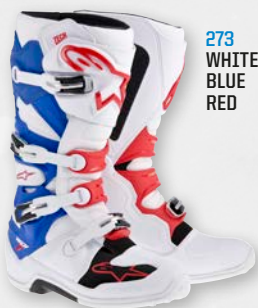
273 WHITE BLUE RED