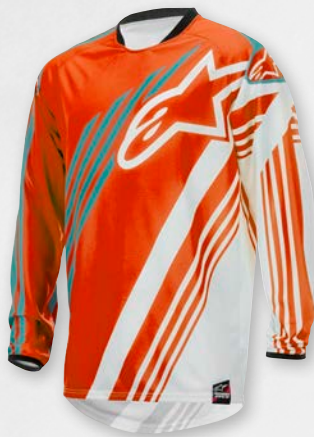
426 ORANGE WHITE TEAL