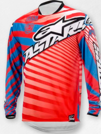
307 RED BLUE WHITE