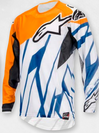
427 ORANGE WHITE BLUE