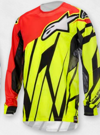
531 YELLOW FLUO RED BLACK