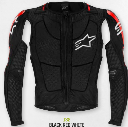
132 BLACK RED WHITE