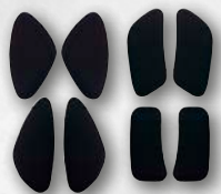
SOFT INSERT PAD SET FOR BNS (6MM AND 10MM) 695 1214 10 BLACK