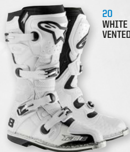
20 WHITE VENTED