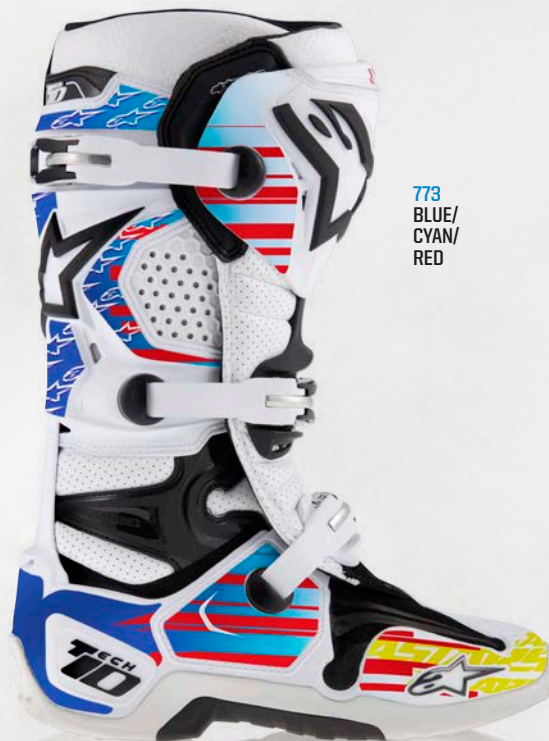
773 BLUE/ CYAN/ RED