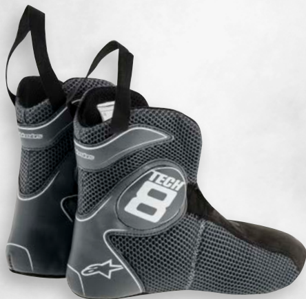
NEWLY DESIGNED INTERNAL ANKLE BOOTIE