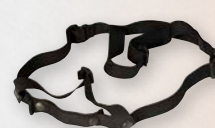
A-STRAP 6700214 114 SUBSTANTIAL STRAP SYSTEM WHICH SECURES THE BNS ONTO THE RIDER WITH THE AID OF A CHEST STRAP.