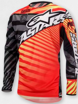
315 RED CHARCOAL YELLOW FLUO