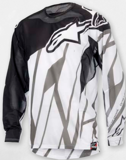
153 BLACK WHITE GRAY