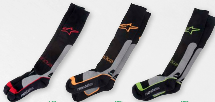
131 BLACK GRAY RED