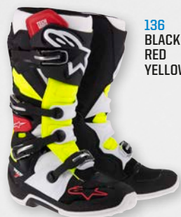
136 BLACK RED YELLOW