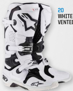
20 WHITE VENTED