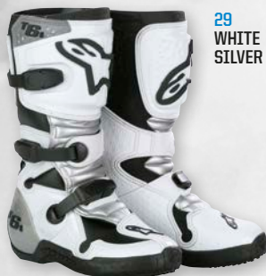
29 WHITE SILVER