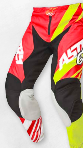
352 RED YELLOW FLUO WHITE