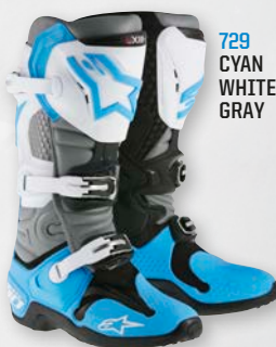
729 CYAN WHITE GRAY