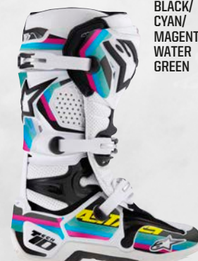
1736 BLACK/ CYAN/ MAGENTA/ WATER GREEN