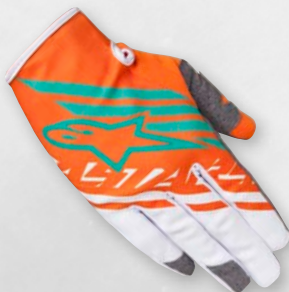
426 ORANGE WHITE TEAL