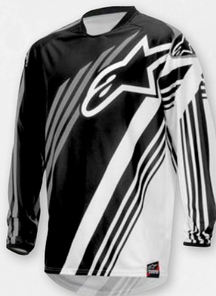
153 BLACK WHITE GRAY