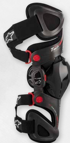
650 0314 1430 FLUID CARBON TECH LEFT ANTHRACITE RED WHITE