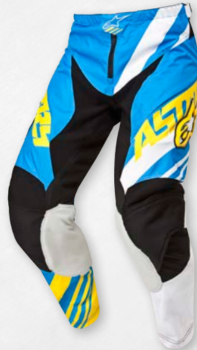
725 BLUE WHITE YELLOW