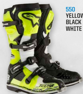
550 YELLOW FLUO BLACK WHITE