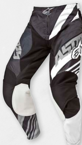
153 BLACK WHITE GRAY