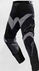
104 BLACK ANTHRACITE