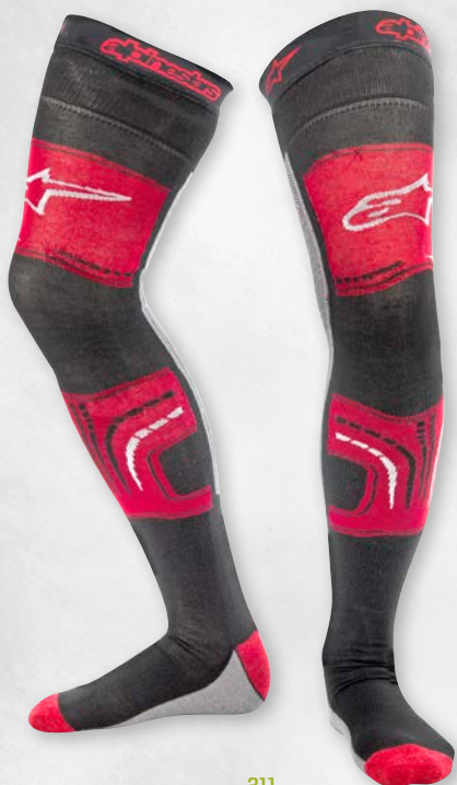
311 RED BLACK GRAY