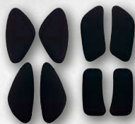
SOFT INSERT PAD SET FOR BNS (6MM AND 10MM) 695 1214 10 BLACK