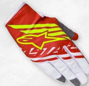
352 RED YELLOW FLUO WHITE