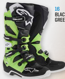
16 BLACK GREEN