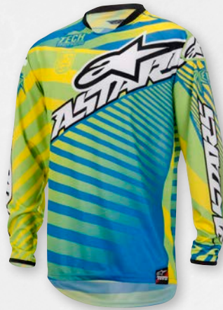
576 YELLOW BLUE LIME