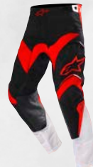
13 BLACK RED