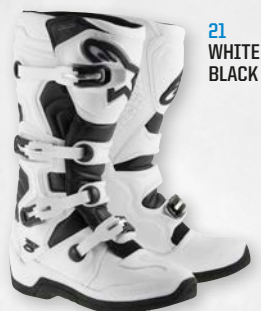
21 WHITE BLACK