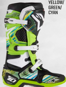
567 YELLOW/ GREEN/ CYAN