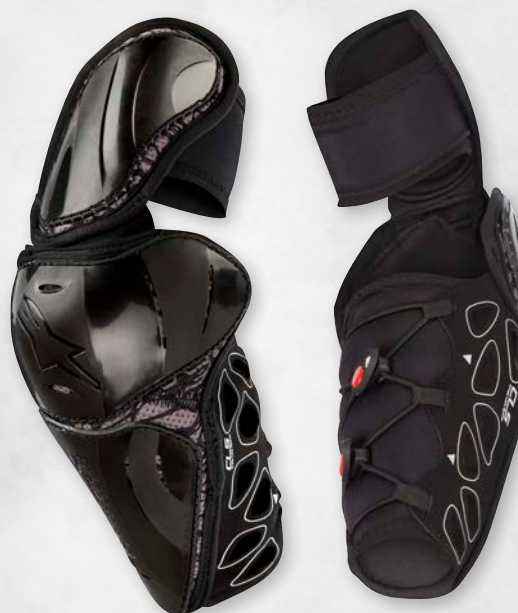
1001 BLACK/GRAY GRAPHIC