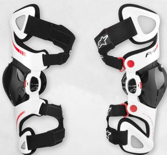
650 1314 231 FLUID PRO SET WHITE RED BLACK