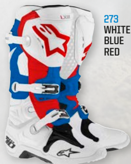
273 WHITE BLUE RED