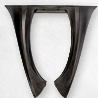
ATTACHMENT PLATE FOR BNS TECH CARBON 695 0014 10 BLACK