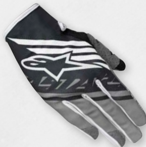
153 BLACK WHITE GRAY