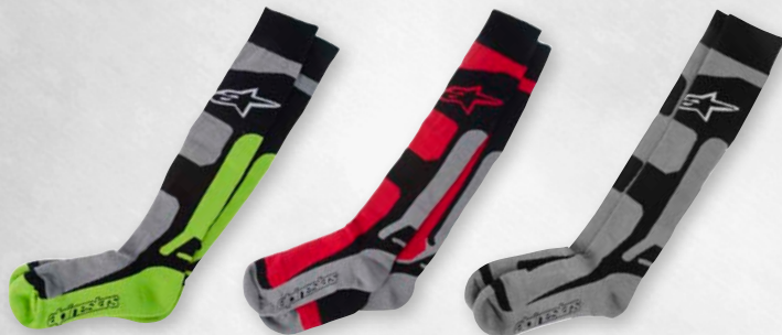
916 GRAY BLACK GREEN