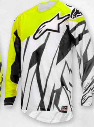
125 BLACK WHITE YELLOW FLUO