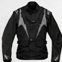
104 BLACK ANTHRACITE