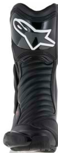
1032 BLACK FUCHSIA WHITE