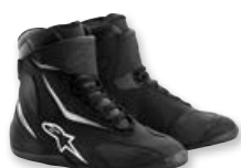
12 BLACK WHITE