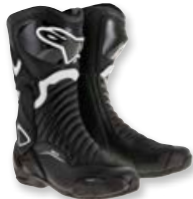
12 BLACK WHITE