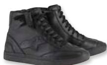
1110 BLACK BLACK