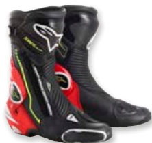
1325 BLACK RED FLUO WHITE YELLOW FLUO