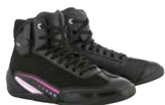
1239 BLACK WHITE FUCHSIA