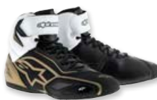
11059 BLACK WHITE GOLD