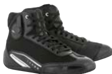
12 BLACK WHITE