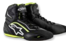
125 BLACK WHITE YELLOW FLUO