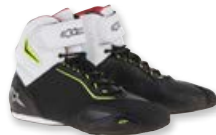
1536 BLACK YELLOW FLUO RED