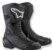
1100 BLACK BLACK

CO-INJECTED TPU/ALUMINUM TOE-SLIDERS AVAILABLE AS ACCESSORY UPGRADE (COMPATIBLE WITH OTHER ALPINESTARS RACING BOOTS).