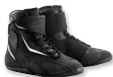
1100 BLACK BLACK