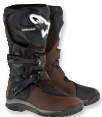
82 BROWN BLACK