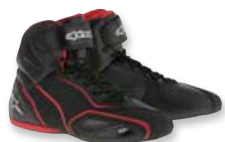
13 BLACK RED