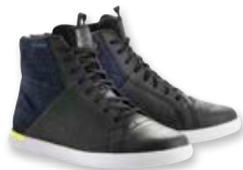
155 BLACK YELLOW FLUO