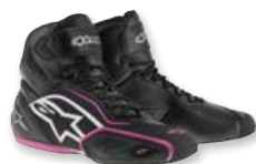
1039 BLACK FUCHSIA