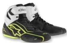
125 BLACK WHITE YELLOW FLUO