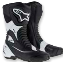
12 BLACK WHITE