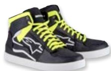
1536 BLACK YELLOW FLUO RED