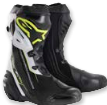
158 BLACK YELLOW FLUO WHITE