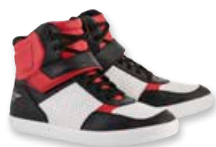
123 BLACK WHITE RED