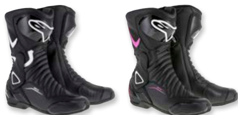
12 BLACK WHITE