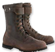
819 DARK BROWN OILED