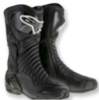
1100 BLACK BLACK