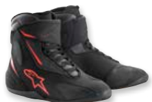
1036 BLACK ANTHRACITE RED