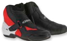
123 BLACK WHITE RED