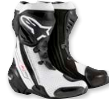
122 BLACK WHITE VENTED