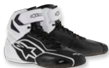
12 BLACK WHITE