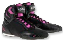
1039 BLACK FUCHSIA