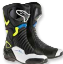
127 BLACK WHITE YELLOW FLUO BLUE