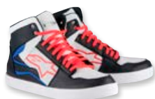
1237 BLACK WHITE RED BLUE