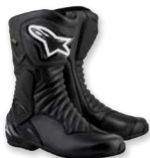
1100 BLACK BLACK