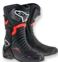
1030 BLACK RED FLUO