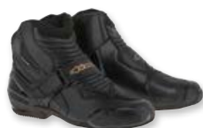
185 BLACK GOLD