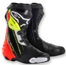
136 BLACK RED YELLOW FLUO