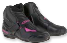
1039 BLACK FUCHSIA