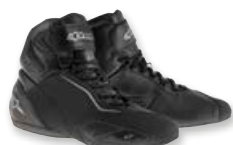
1101 BLACK GUN METAL