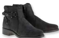
110 BLACK MATT