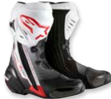
132 BLACK RED WHITE