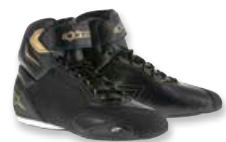
185 BLACK GOLD