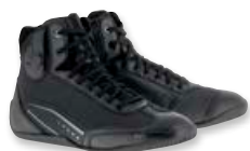
106 BLACK GRAY