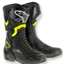
155 BLACK YELLOW FLUO