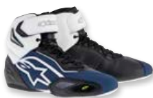
1720 BLACK NAVY WHITE YELLOW FLUO