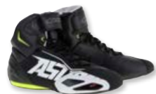
1053 BLACK WHITE YELLOW FLUO RED