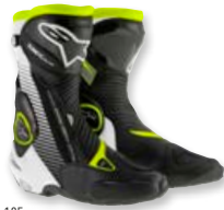
125 BLACK WHITE YELLOW FLUO