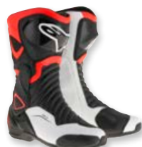
1321 BLACK RED FLUO WHITE