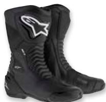
1100 BLACK BLACK