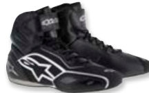
119 BLACK SILVER