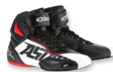
123 BLACK WHITE RED