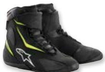
155 BLACK YELLOW FLUO