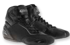
1101 BLACK GUN METAL