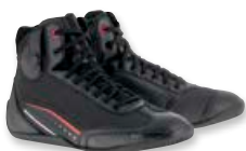
13 BLACK RED