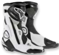
12 BLACK WHITE