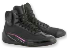
1039 BLACK FUCHSIA