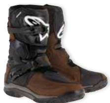
82 BROWN BLACK