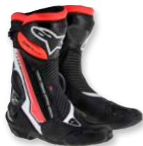
233 WHITE BLACK RED FLUO