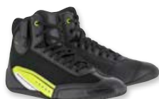
155 BLACK YELLOW FLUO