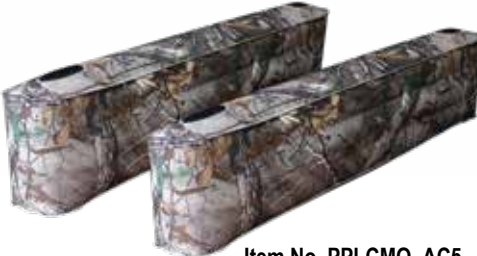
Item No. PPI-CMO_AC5 Item No. PPI-CMO_AC5_405