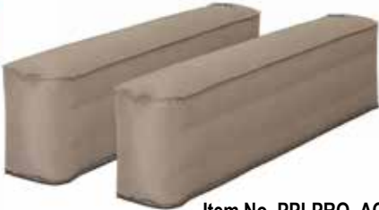
Item No. PPI-PRO_AC5