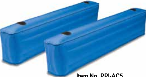
Item No. PPI-AC5 Item No. PPI-AC5_105