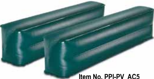
Item No. PPI-PV_AC5