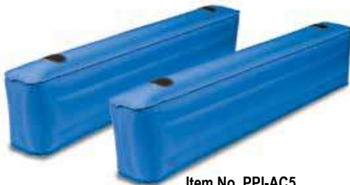
Item No. PPI-AC5 Item No. PPI-AC5_105