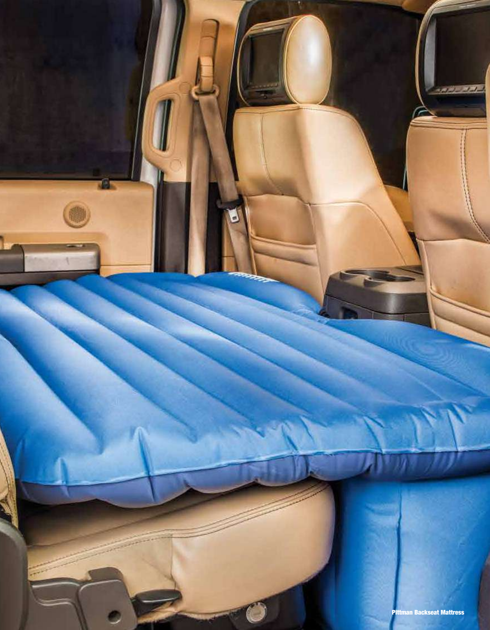
Pittman Backseat Mattress