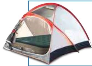
Perfect for Camping!