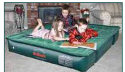
Show with optional wheel well inserts