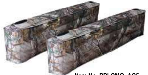
Item No. PPI-CMO_AC5 Item No. PPI-CMO_AC5_405