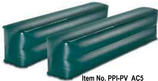
Item No. PPI-PV_AC5