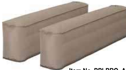
Item No. PPI-PRO_AC5