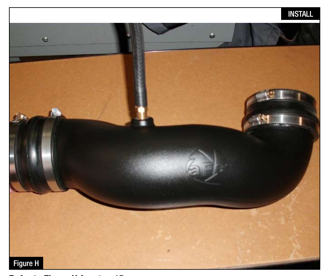
Refer to Figure H for step 15

Step 15. Install supplied couplers, clamps, brass fitting, and breather hose to the aFe intake tube. (Do not tighten clamps.)