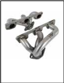
Twisted Steel Header