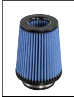
Pro 5R Air Filter