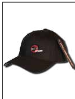
aFe Power Hat