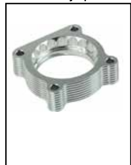
Throttle Body Spacer