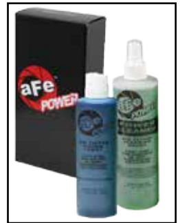
Blue Squeeze Restore Kit