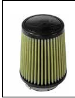
Pro GUARD 7 Air Filter