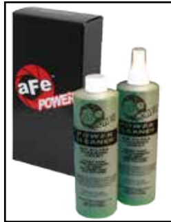
Pro DRY S Restore Kit