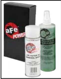
Blue Aerosol Restore Kit