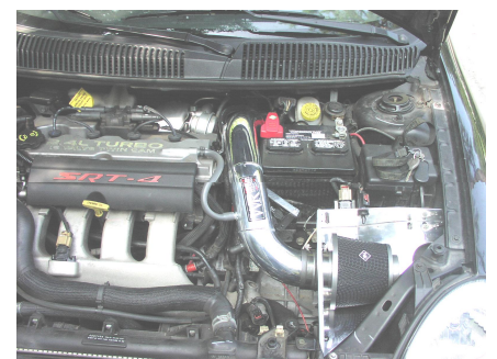
SW Intake with Aluminum shield