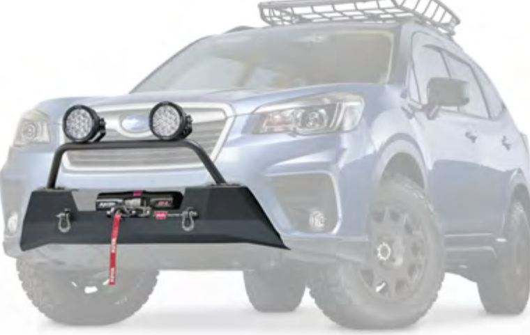
106431 Semi Hidden Kit for 2019+ Subaru Forester 106236 Grille Guard Tube with Light Mounting Tabs