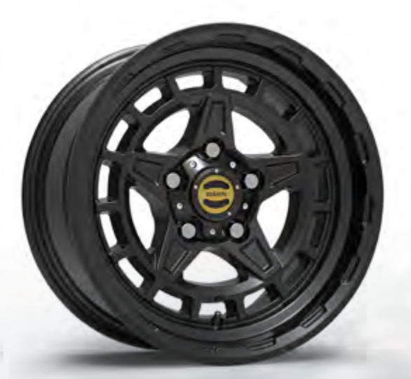
106687* DIAMOND CUTTER Black, 17x8.5 diameter, 5x5 (5x217) bolt pattern, 0 offset