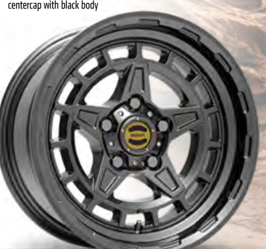
106688* DIAMOND CUTTER

Gunmetal grey, 17x8.5 diameter, 5x5 (5x217) bolt pattern, 0 offset