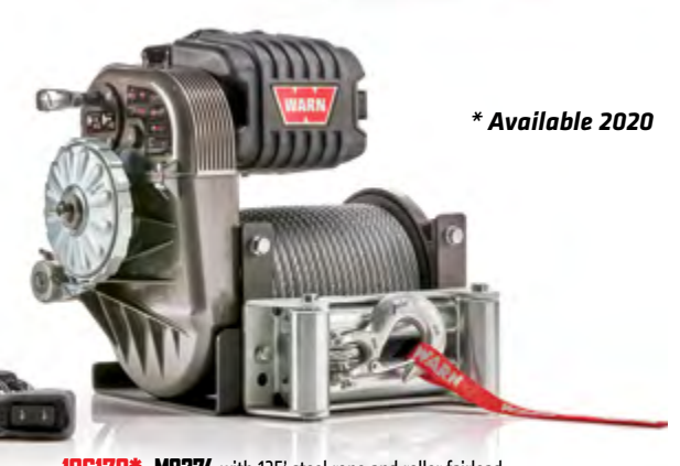
106170* M8274 with 125' steel rope and roller fairlead