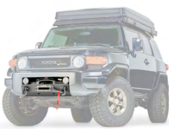
103220* 2006-14 Toyota FJ