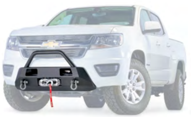
103210* 2015-19 Chevy Colorado