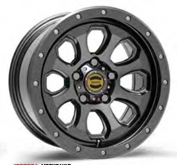
106686* MODNSAULT Gunmetal grey, 17x8.5 diameter, 5x5 (5x217) bolt pattern, 0 offset