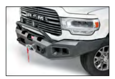
Our newest Ascent Front Bumpers have a new lower-profile style for clean, compact look.