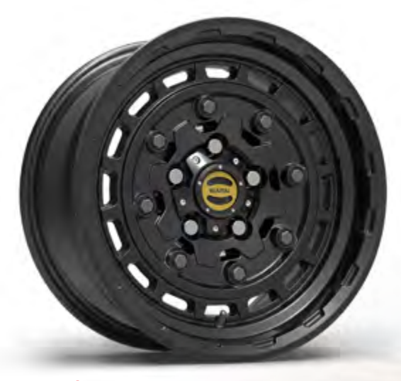
106689* JACK HAMMER Black, 17x8.5 diameter, 5x5 (5x217) bolt pattern, 0 offset