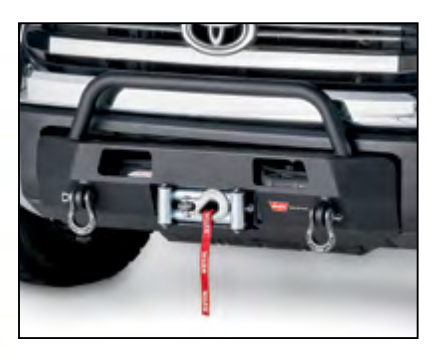
Semi Hidden Kits feature open port for easy access to the winch clutch lever, and recovery points for mounting shackles