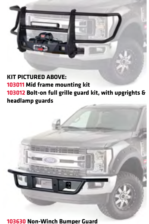
KIT PICTURED ABOVE: 103011 Mid frame mounting Kit