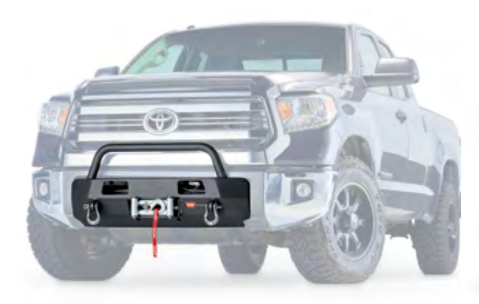
103209* 2014-19 Tundra