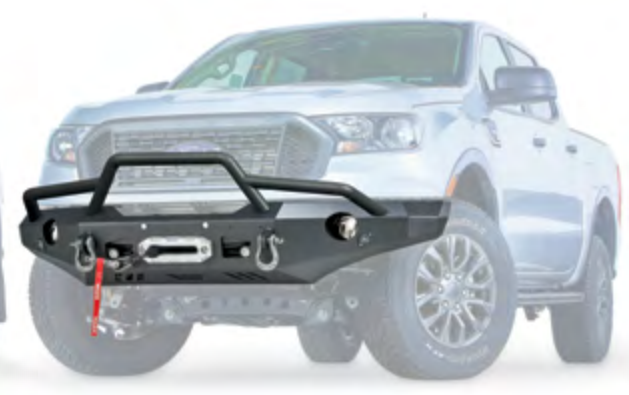
103465 Ascent Front Bumper - 2019 Ford Ranger 104296* Baja Bar