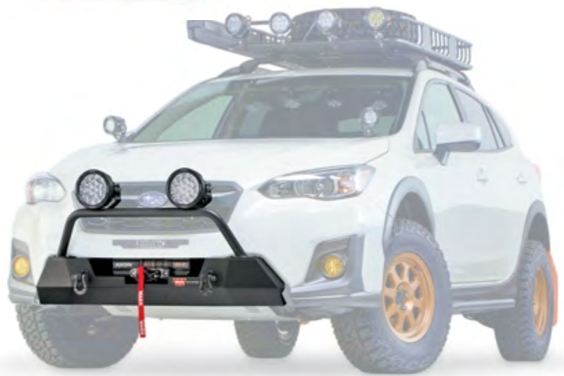
106221 Semi-Hidden Kit for 2018+ Subaru Crosstrek 106236 Grille Guard Tube with Light Mounting Tabs

101155 AXON 55 101150 AXON 55-S 101145 AXON 45 101140 AXON 45-S 101045 VRX 45 101040 VRX 45-S