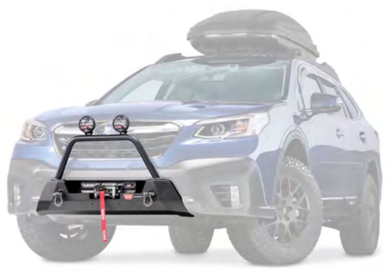
106396 Semi Hidden Kit for 2020+ Subaru Outback 106398 Grille Guard Tube with Light Mounting Tabs