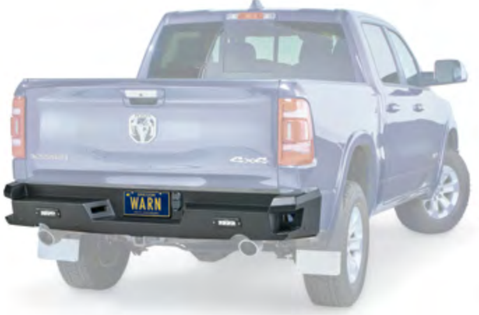
104823* Ascent Rear Bumper - 2019 Ram 1500