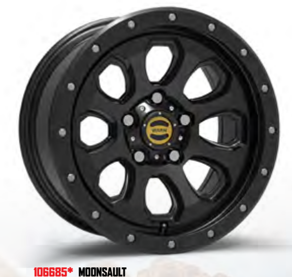
Black, 17x8.5 diameter, 5x5 (5x217) bolt pattern, 0 offset