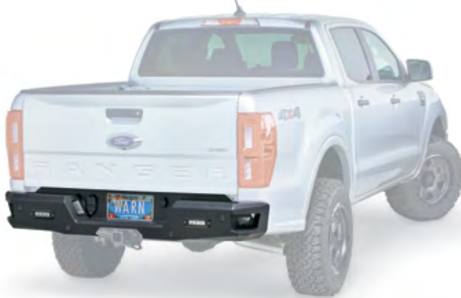
105863* Ascent Rear Bumper - 2019 Ford Ranger