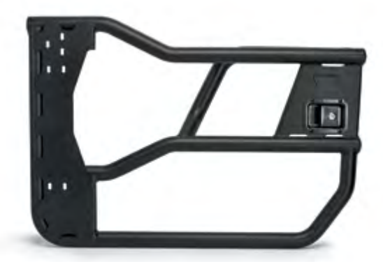
103101 Front Tube Doors (pair)