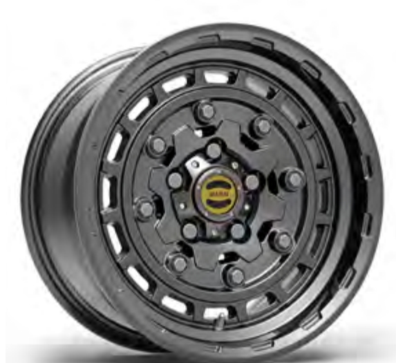
106690* JACK HAMMER Gunmetal grey, 17x8.5 diameter, 5x5 (5x217) bolt pattern, 0 offset