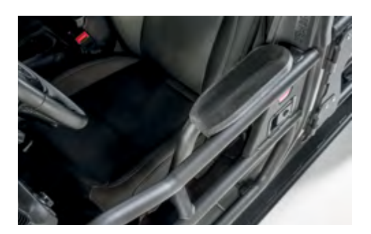
104290* Padded Arm Rests for front tube doors (optional, sold as a pair)