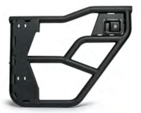
103102 Rear Tube Doors (pair)