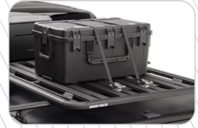
Pioneer Platform and Sportz Ratchet Grab

Learn more about tonneau covers we have.