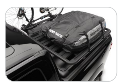
Pioneer Platform, Luggage Bag, Bike Carrier