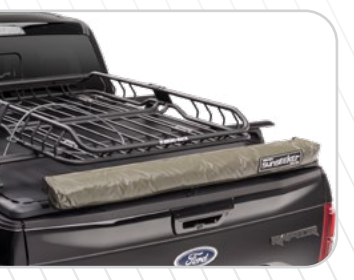
Xtray, Sunseeker Awning, Cable Lockdown