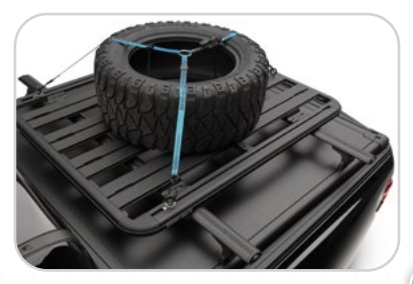
Pioneer Platform and Spare Tire Strap