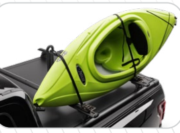
Nautic Stack Kayak Holder