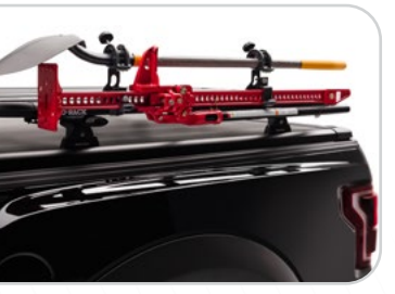
Pioneer Platform and Shovel/High Lift Bracket