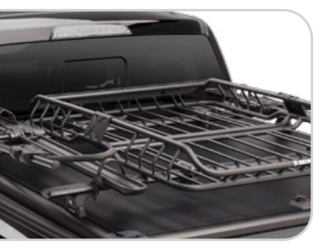
Xtray and Hybrid Bike Carrier