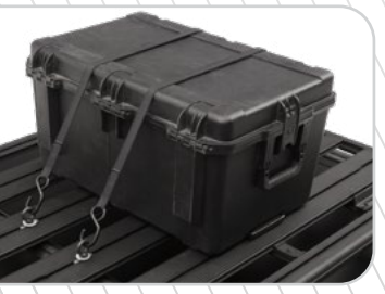
Pioneer Platform and Eye Bolts