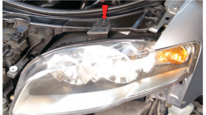
12) Remove [1x] T-30 torx screw securing the headlight.