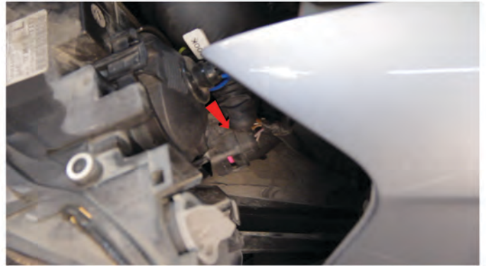
14) Disconnect the headlight harness.