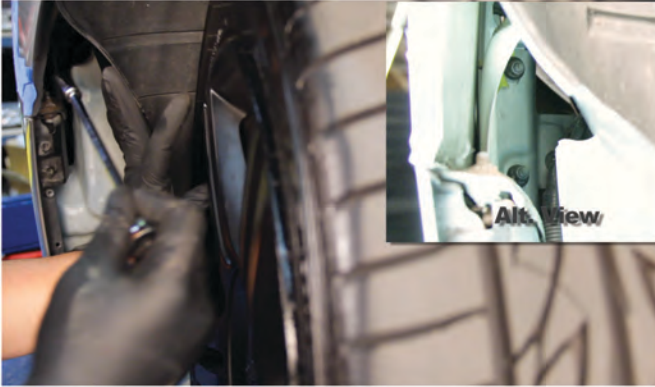
23) Reinstall [2x] 10mm bolts that secure the fascia to the fender.