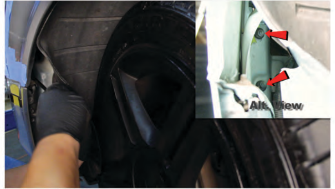
6) Peel back the fender liner for access, then remove [2x] 10mm nuts securing the fascia hidden deep inside the fender.