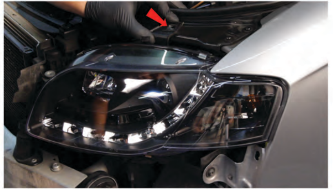
18) Install the included washer underneath the upper headlight tab.