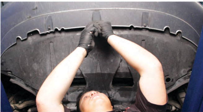
27) Reinstall [3x] T-25 torx screws to secure the fascia to the undertray.