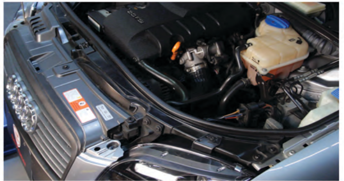
28) Reinstall [3x] T-30 torx screws to secure the fascia.