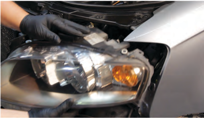
13) Unseat the headlight.