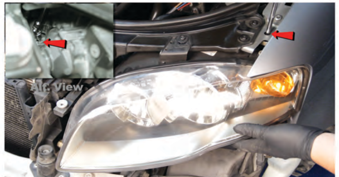
10) Loosen [1x] T-30 torx screw hidden underneath the core support using a long torx driver to loosen it through the access hole in the fender. Loosen, but do not completely remove this screw.