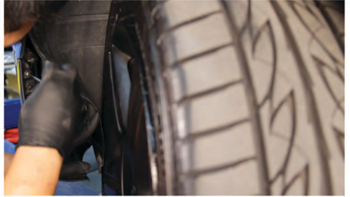
24) Reinstall [2x] T-25 torx screws to secure the fascia to the fender.