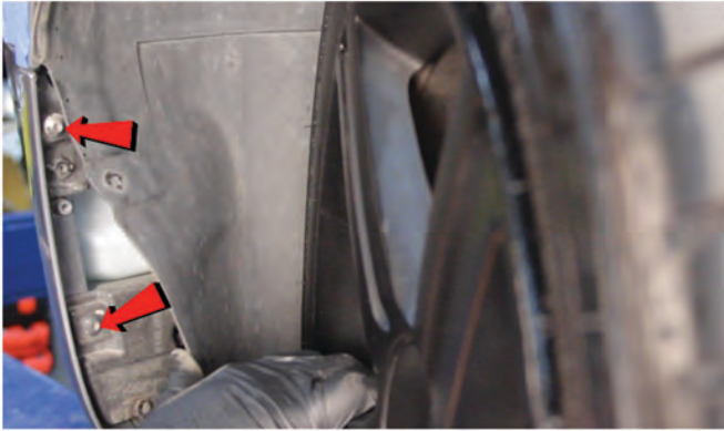
5) Remove [2x] T-25 torx screws securing the fascia to the fender.