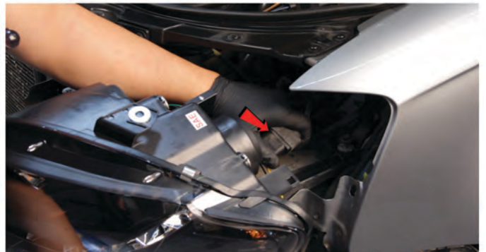
16) Connect the headlight wiring harness to the Spyder headlight.