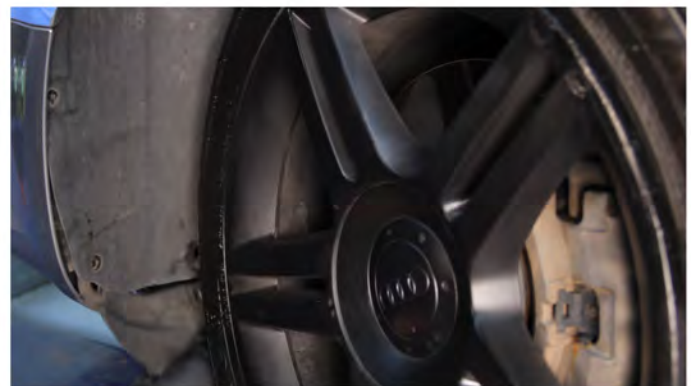
4) Remove the forward mudflap.