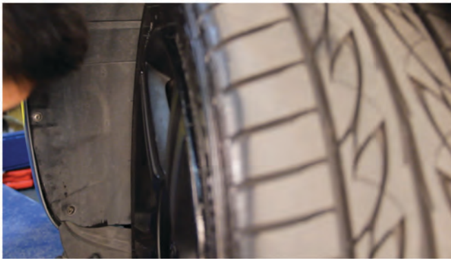
25) Reinstall [1x] T-25 torx screw to secure the fender liner.