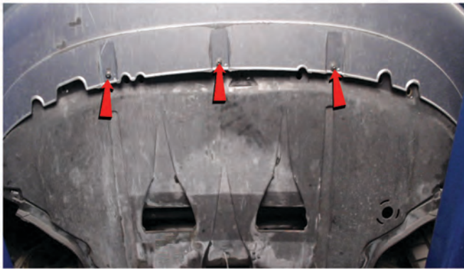
7) Remove [3x] T-25 torx screws securing the fascia to the undertray.