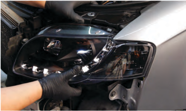
17) Seat the Spyder headlight.