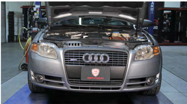
1) Open the hood.