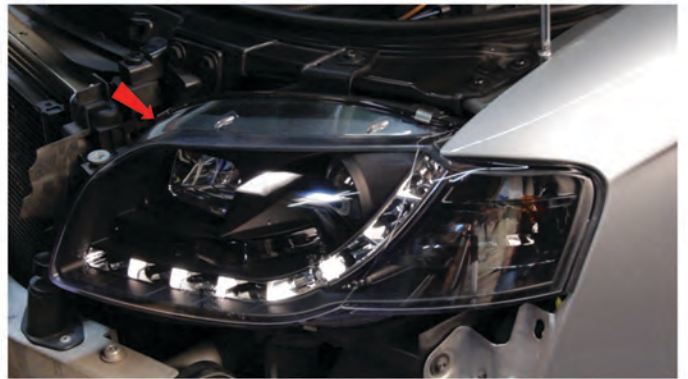
20) Tighten [2x] T-30 torx screws, the one hidden under the core support using a long torx driver through the access hole in the fender as well as the inboard one.