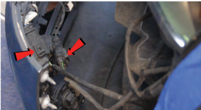
9) Disconnect the sidemarker and fog lamp master disconnects on the driver's side.