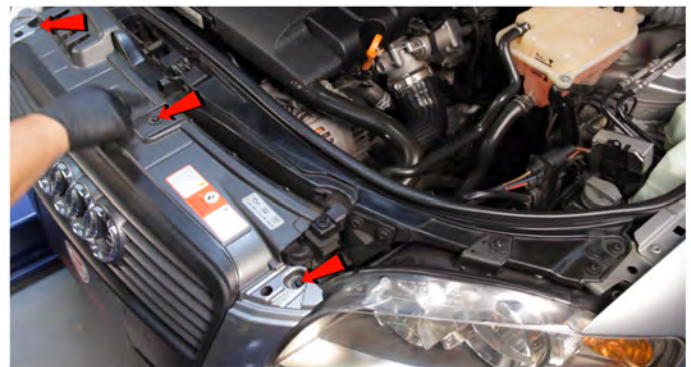
2) Remove [3x] T-30 Torx screws securing the fascia above the grille.