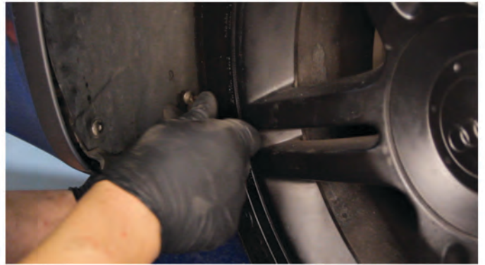
26) Seat the forward mudflap, then reinstall [2x] T-25 torx screws to secure the fender liner.