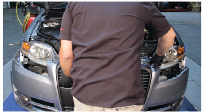
8) Unseat the front bumper fascia.