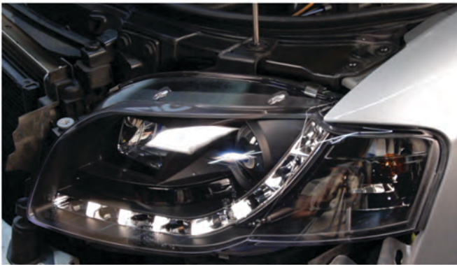
19) Reinstall [1x] T-30 torx screw.