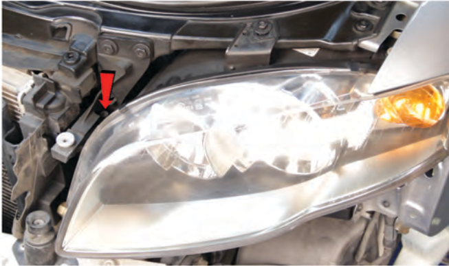
11) Loosen [1x] T-30 torx Screw. Loosen, but do not remove this screw.