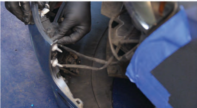
21) Reconnect the fog light and sidemarker master disconnects on the driver's side.