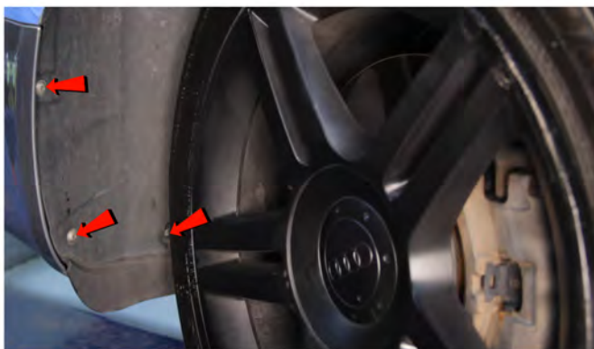
3) Remove [3x] T-25 Torx screws that secure the fender liner and the forward mudflap.