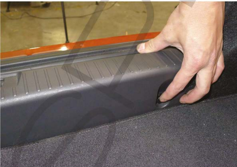
27. Replace the (3) plastic clips Please repeat the steps in order from 1 to 37 for the opposite side