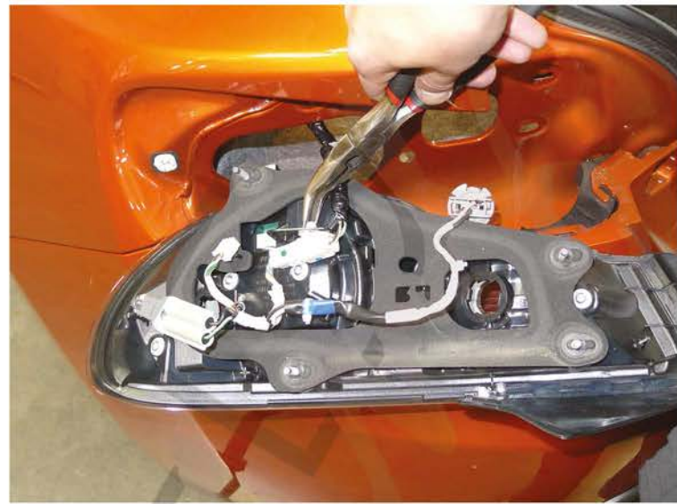
12. Remove the tail light harness from the tail light