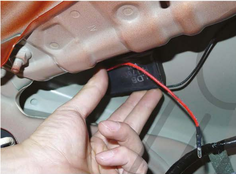
19. Place and attach the resistor on inside roof on the rear panel