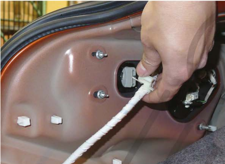
7. Remove the harness retaining clip