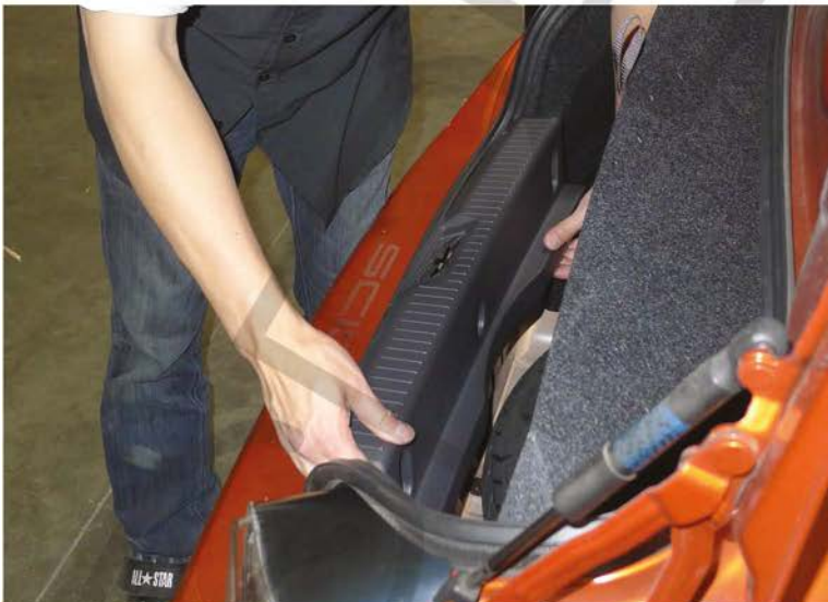
3. Remove the plastic moulding