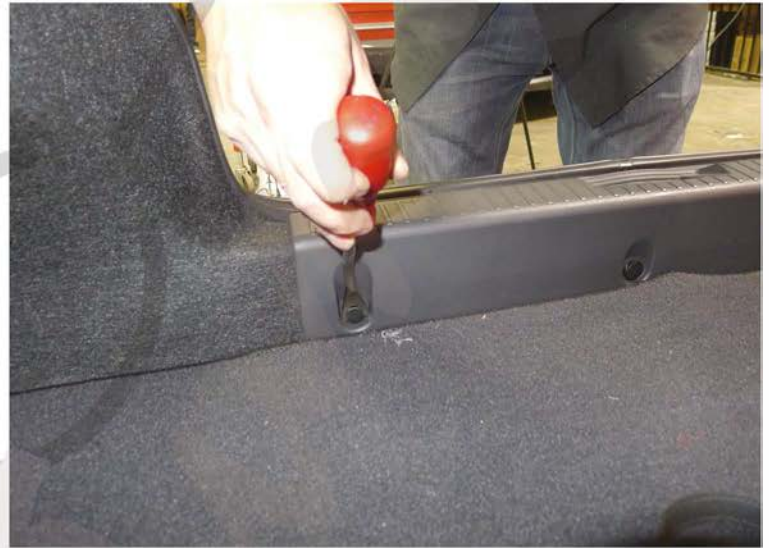
2. Remove the (3) plastic clips