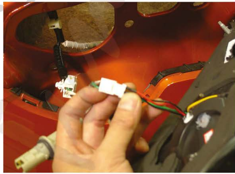
14. Connect the tail light harness to the LED taillight

please see the "L.E.D. tail lights installation instructions" If your tail lights don't have L.E.D. you can skip the installation instructions.