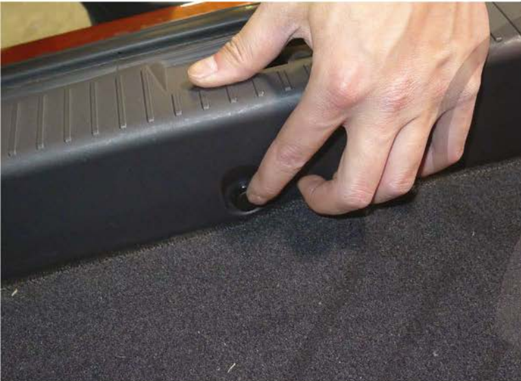
25. Replace the (3) plastic clips