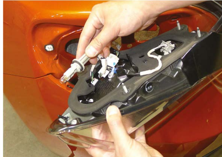
10. Remove the tail light socket