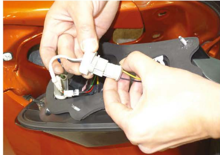
16. Connect the LED tail light harness to the tail light socket