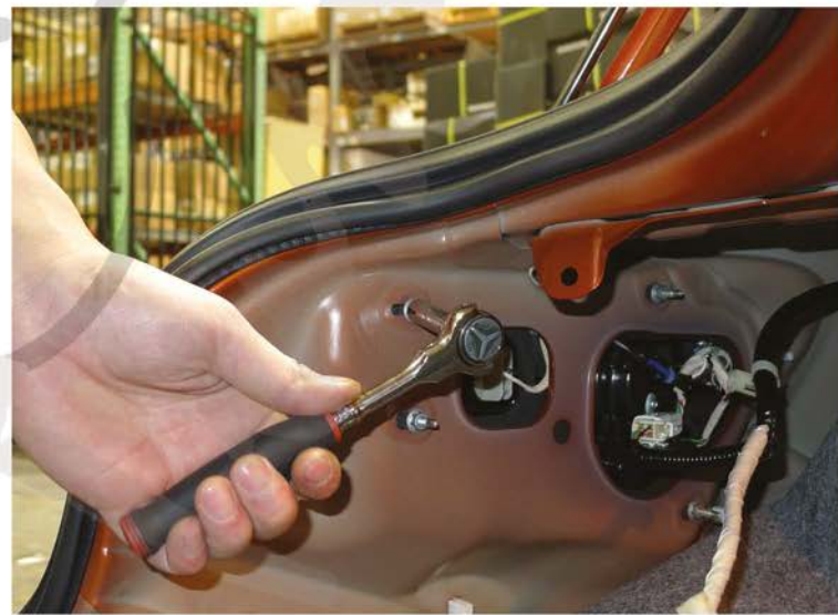
8. Remove the (4) 8mm nuts