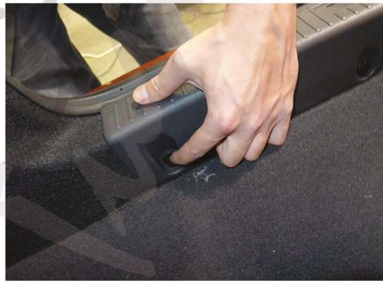
26. Replace the (3) plastic clips