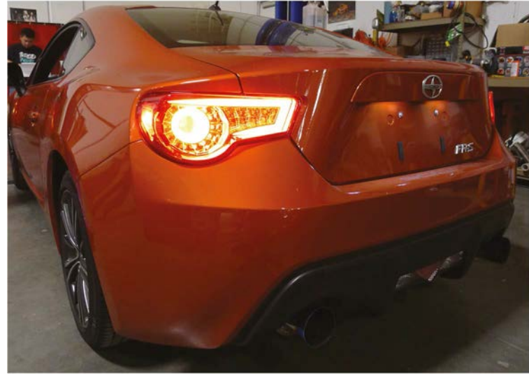
28. The installation is now complete