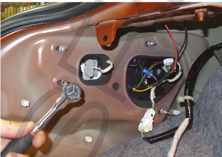
21. Tighten the (4) 8mm nuts