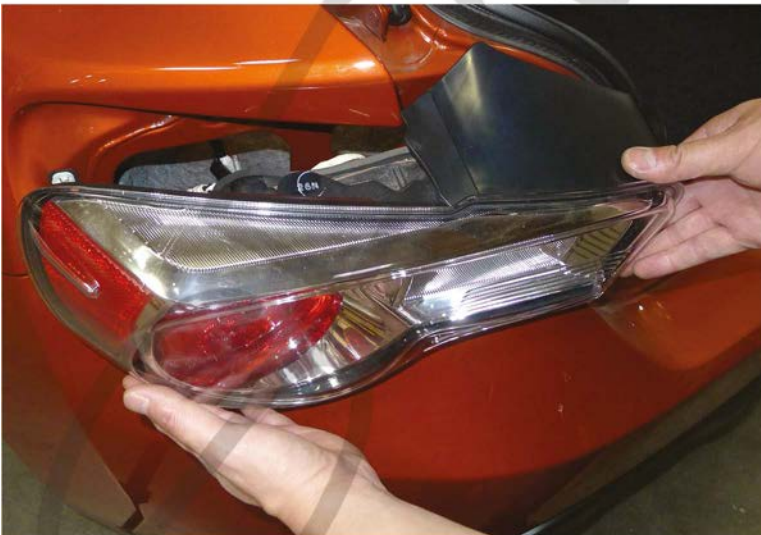
9. Remove the factory tail light