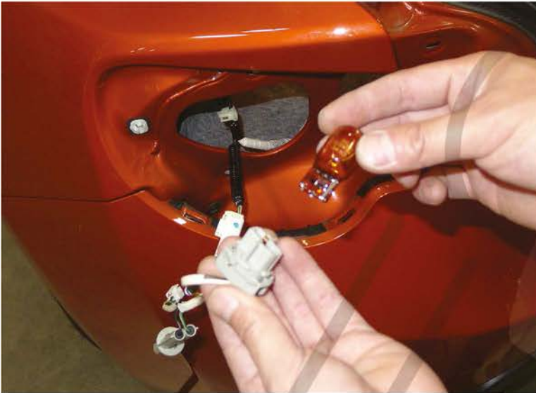
13. Remove the tail light bulb from the socket