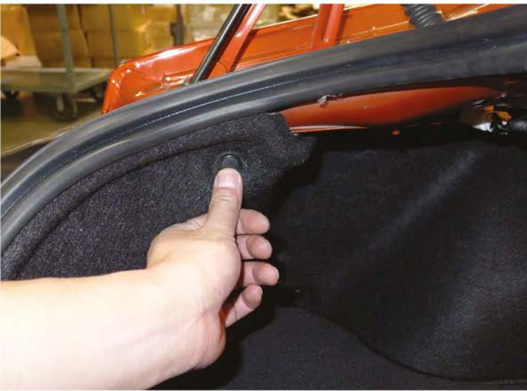
23. Replace the plastic clip