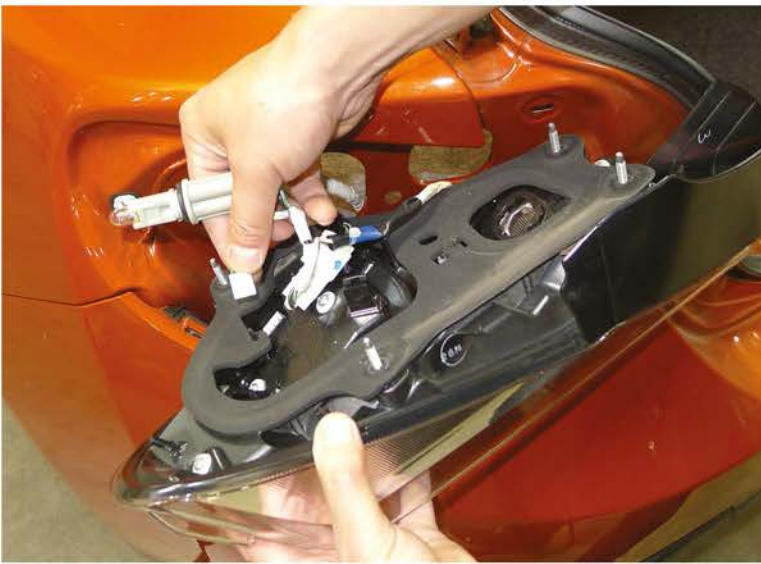
11. Disconnect the tail light harness