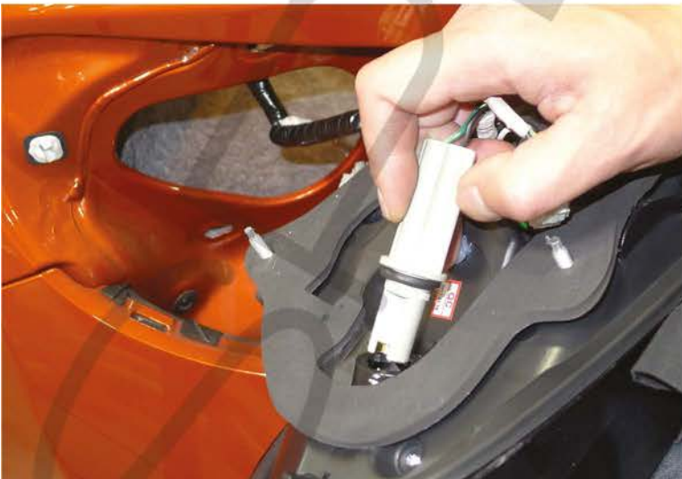
15. Install the light socket into the LED tail light

please see the "L.E.D. tail lights installation instructions" If your tail lights don't have L.E.D. you can skip the installation instructions.