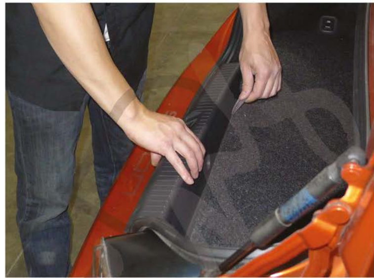
24. Replace the plastic trunk moulding