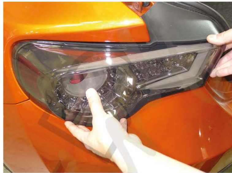
18. Place the LED tail light in the stock location