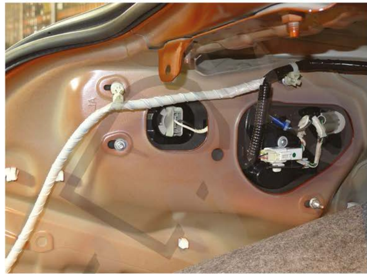
6. (4) 8mm nuts location