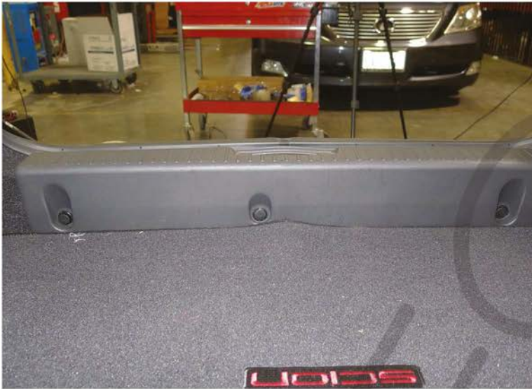
1. (3) plastic clips location

Do not make direct contact with the halogen bulbs or the wire assembly until the unit has cooled down after use.