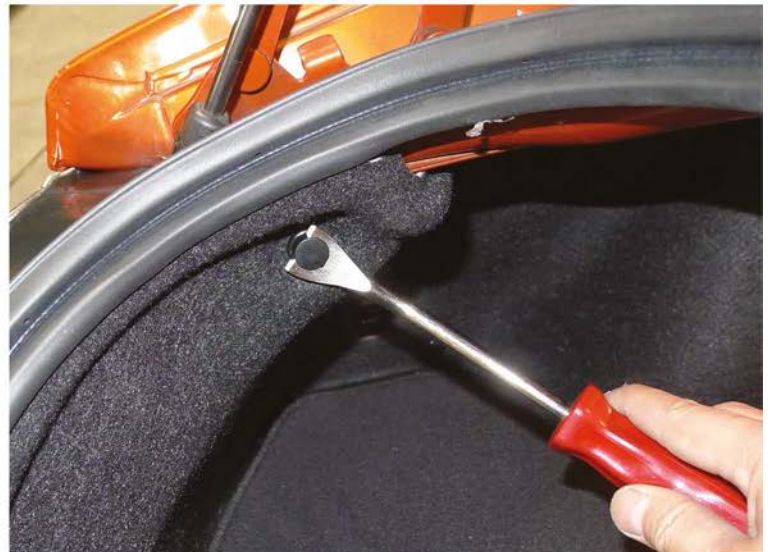
4. Remove the plastic clip