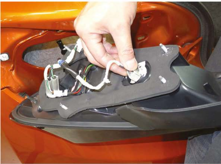
17. Install the tail light socket into the LED tail light