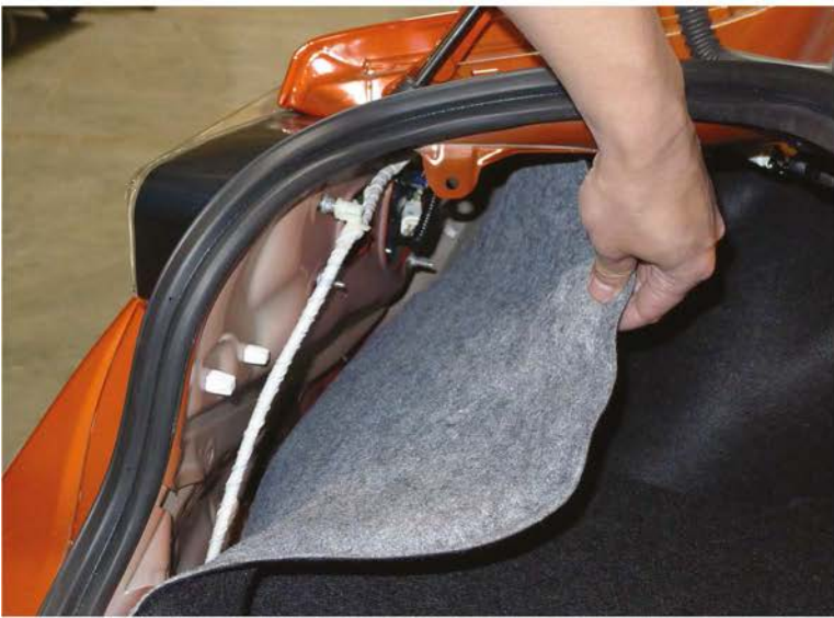
5. Pull the fender liner aside