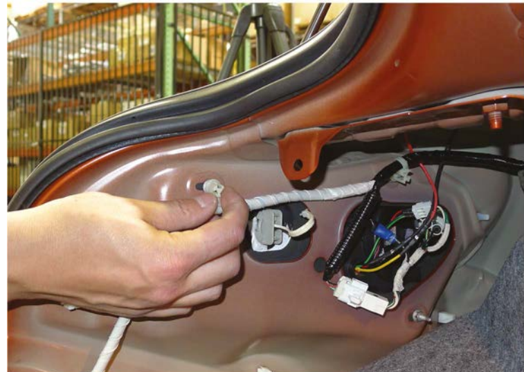
22. Replace the harness retaining clips