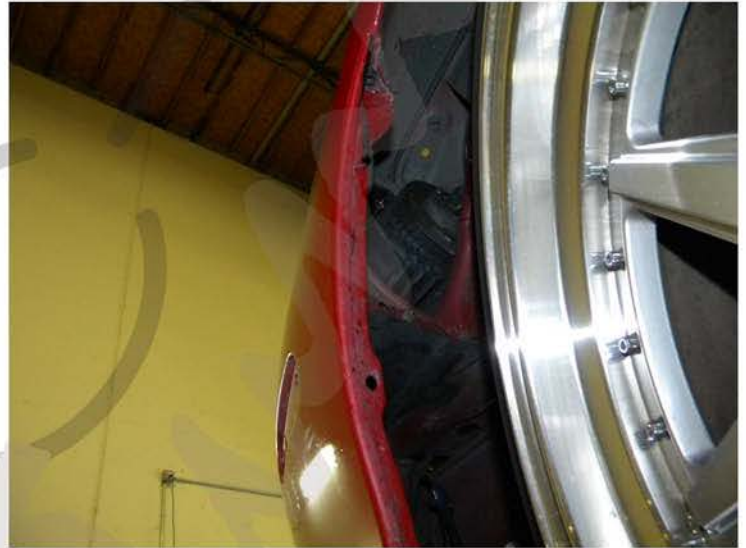
2. Plastic clips location