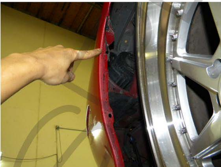
27. Replace clips that may be in these locations Please repeat the step in order from 1 to 27 for the opposite side