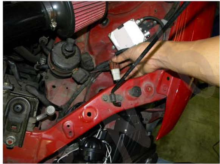
18. Connect New headlight to harness

Please see the Halo and L.E.D installation instruction If your headlights don't have HALO or L.E.D. You can skip it