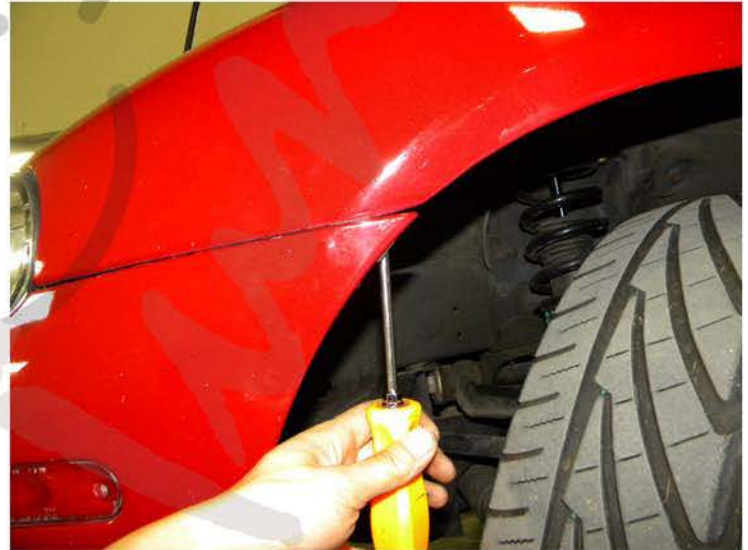
26. Tighten phillips head screw