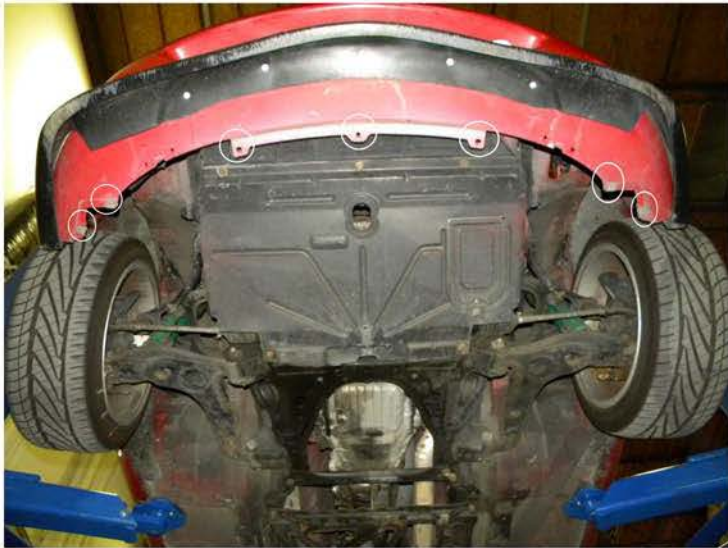
1. Clips and bolts locations

Do not make direct contact with the halogen bulbs or the wire assembly until the unit has cooled down after use.