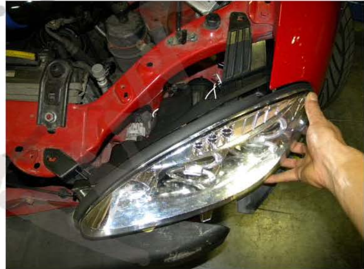
20. Place New projector headlight