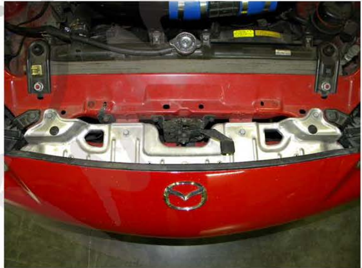
8. (4) 10mm bolts location