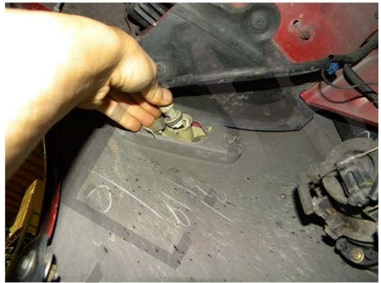
24. Reconnect bumper light