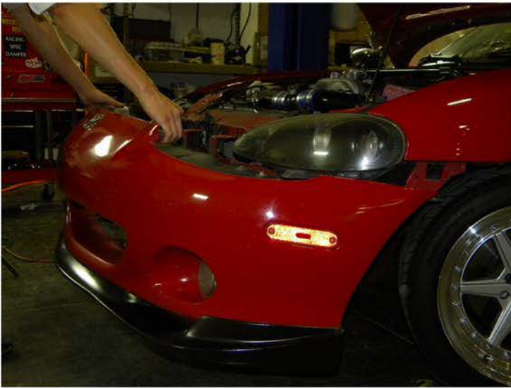
11. Remove front bumper