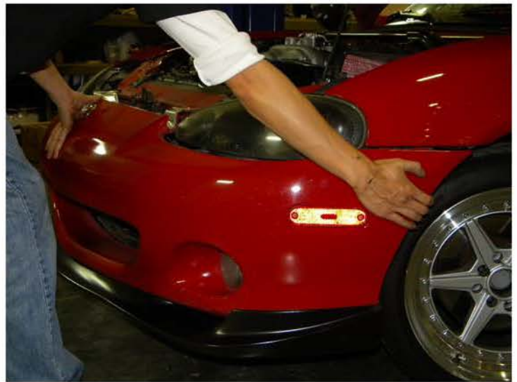
10. Tug on the side of the front bumper to unclip