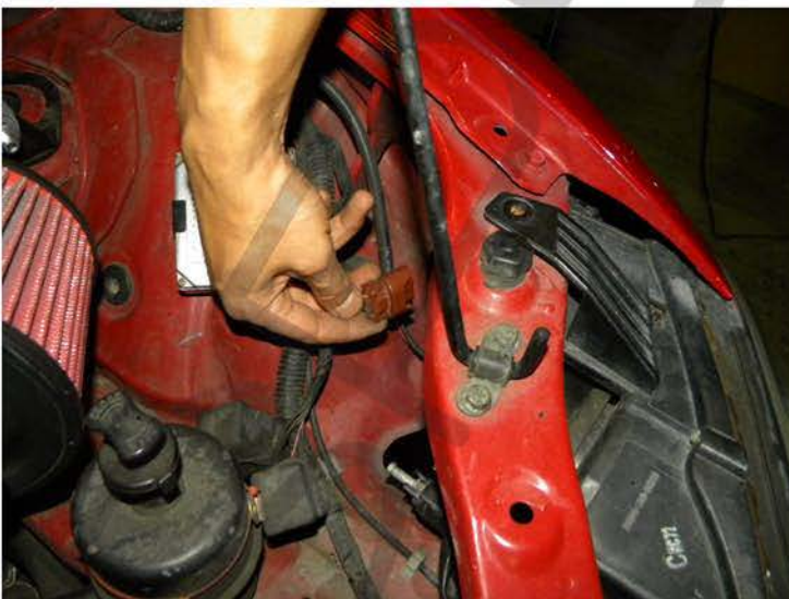
15. Unplug headlight harness