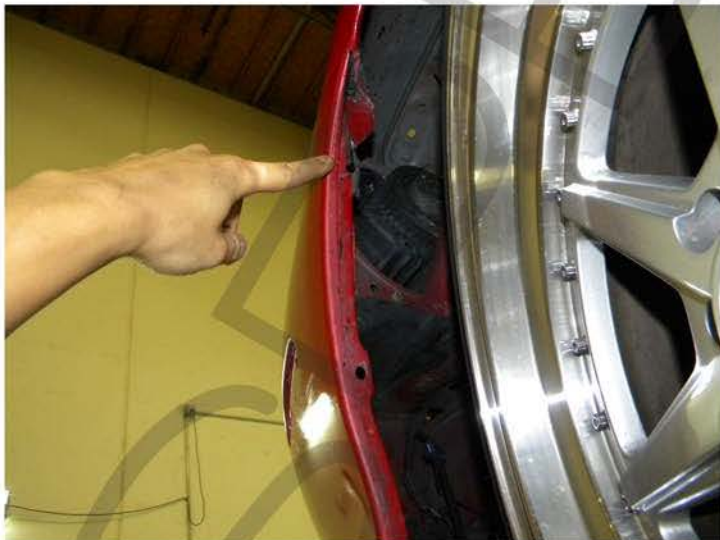
3. Remove the clips that may be in these locations