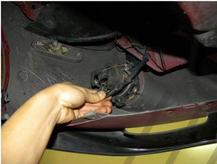
7. Disconnect the fog light