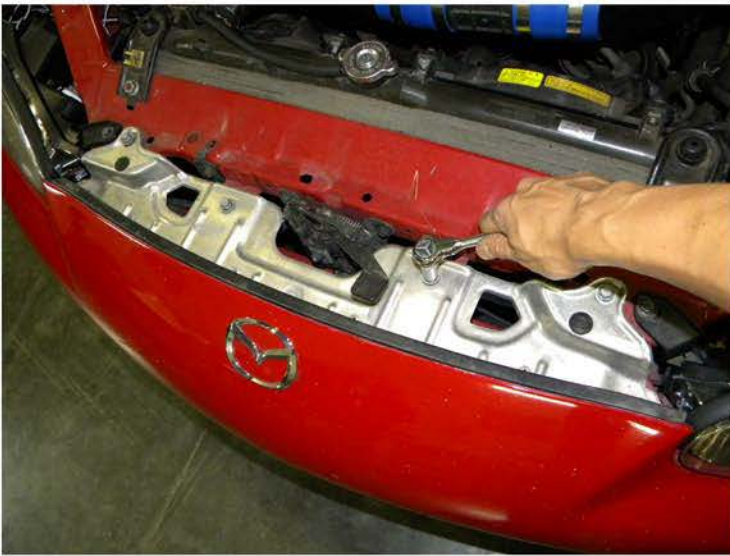
23. Tighten (4) 10mm bolts