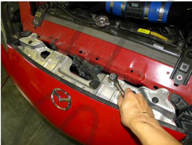
9. Remove the (4) 10mm bolts