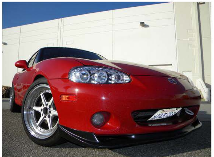
28. The installation is now complete