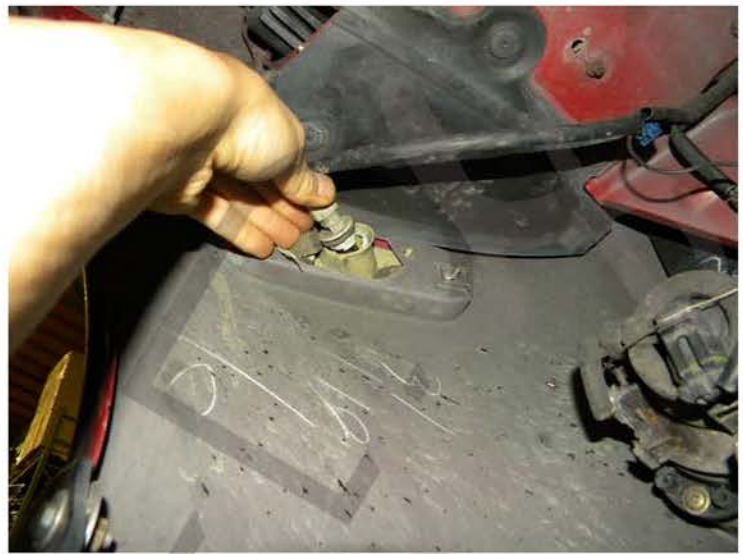
6. Unplug the bumper light