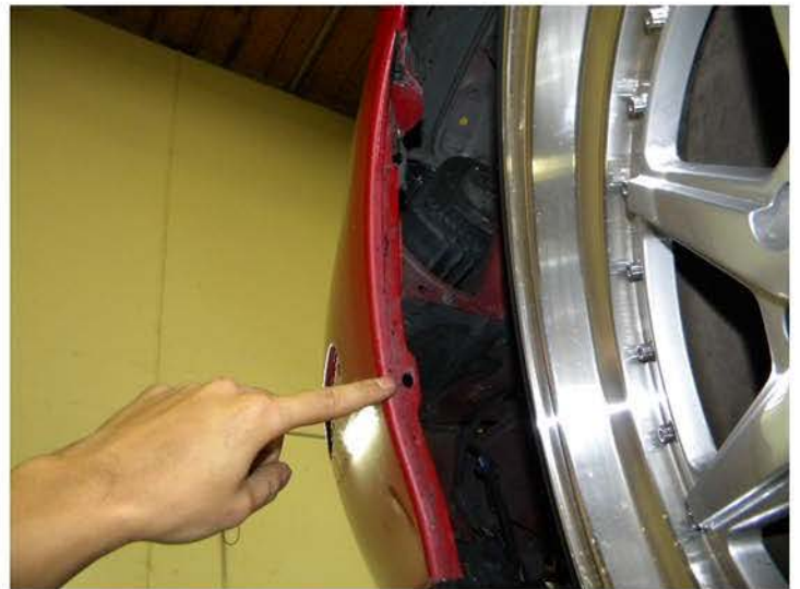
4. Remove the clips that may be in these locations