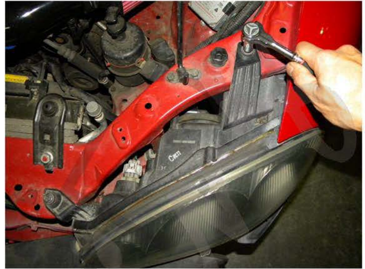
12. Remove (2) 10mm bolts