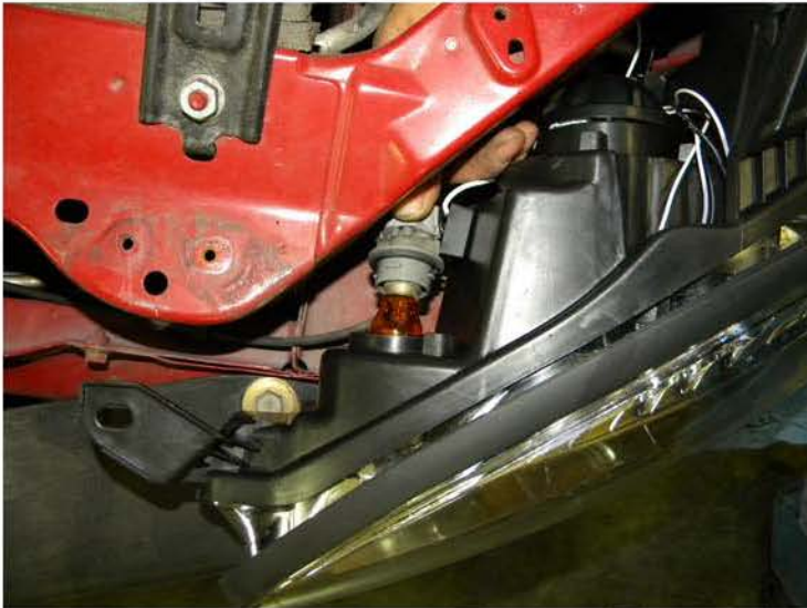
19. Connect driving light bulb

Please see the Halo and L.E.D installation instruction If your headlights don't have HALO or L.E.D. You can skip it