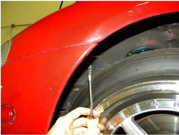
5. Remove the phillips head screw