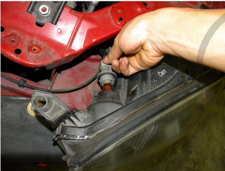
13. Remove light bulb and harness