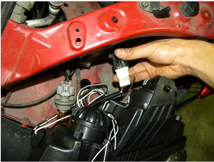
17. Plug in new headlight to headlight harness