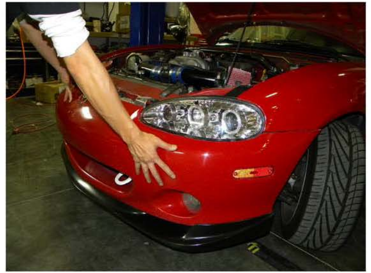
22. Replace front bumper