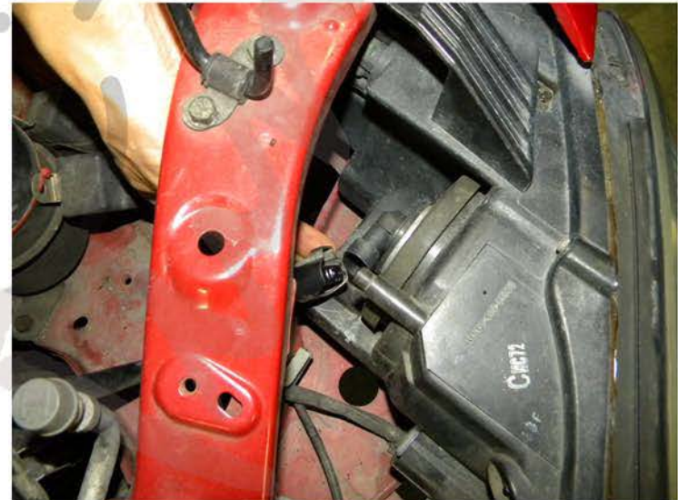
14. Unplug headlight harness