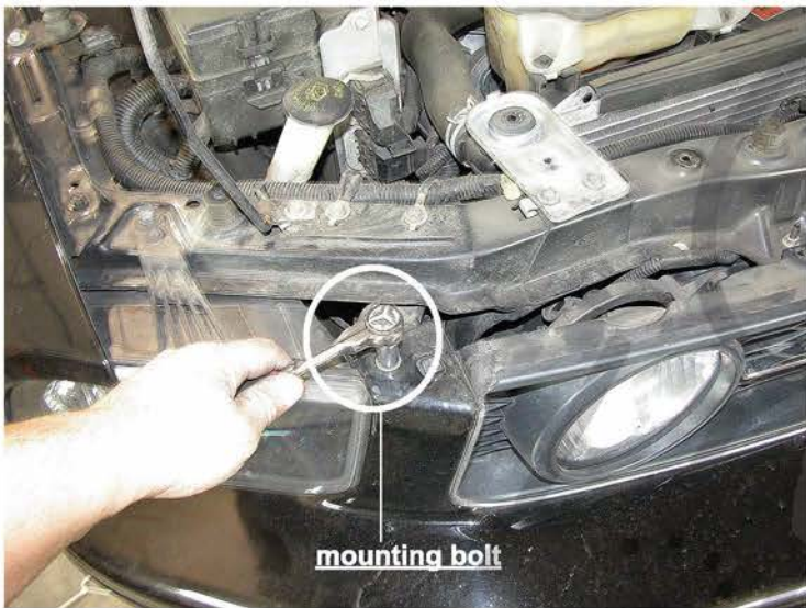
7. Remove the mounting bolts from the bumper which is on the top (BOTH SIDES)