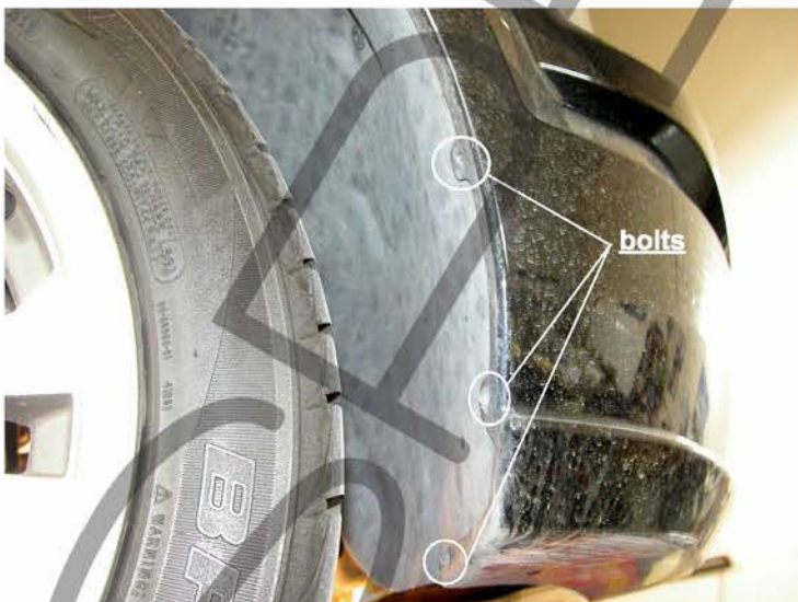
3. Remove the bolts (BOTH SIDES)