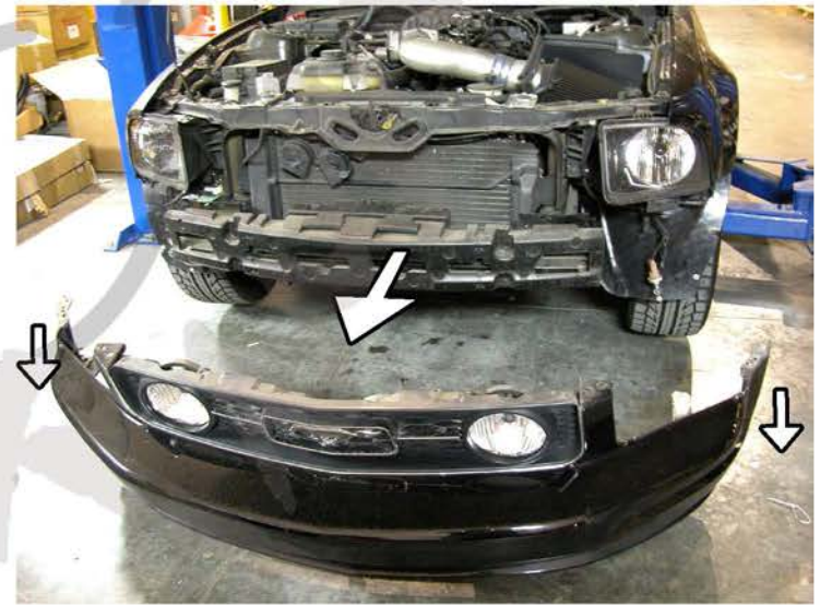
8. Before you remove the bumper, pull the both side down first and then pull out the bumper ( Please disconnect your OEM fog light's connector before you remove the front bumper if equipped)