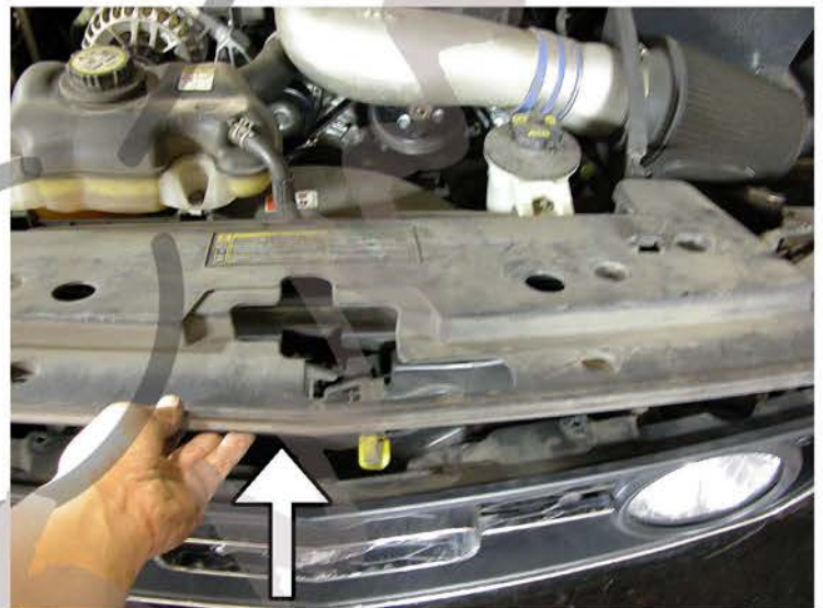
2. Take off the cover