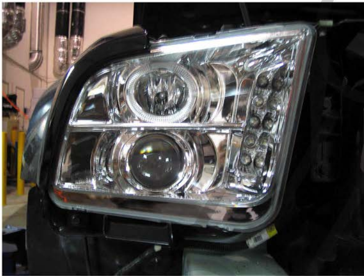
14. Install the headlight (BOTH SIDES)

If your headlights don't have HALO or L.E.D. You can skip Step 13