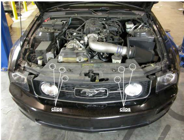
1. Remove the clips