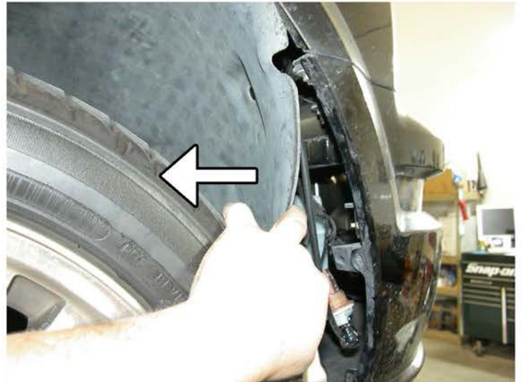
4. Gently pull the plastic cover (BOTH SIDES)