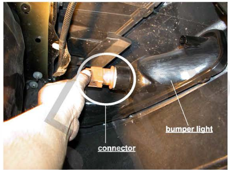
6. Remove connector from bumper light (BOTH SIDES)