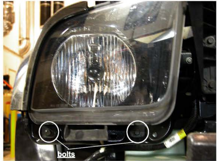
10. Remove the bolts from the headlight (BOTH SIDES)