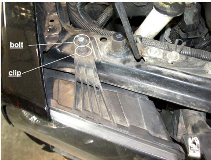
11. Remove the bolt and clip from the headlight (BOTH SIDE)