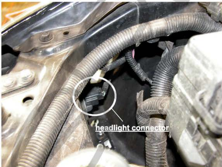
9. Remove the connector from the headlight (BOTH SIDES)