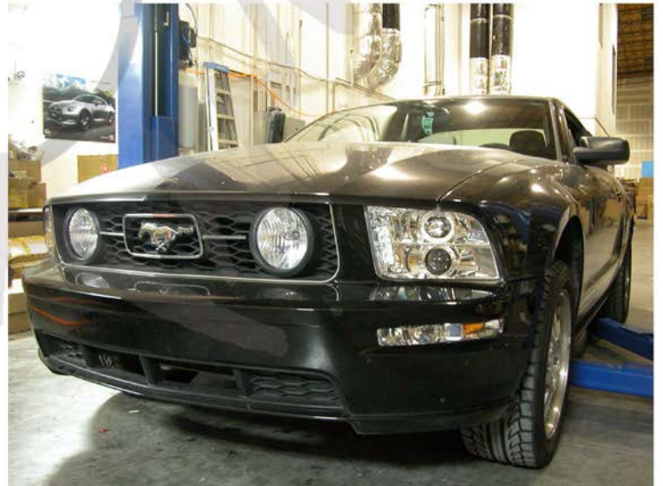
16. Complete the installation