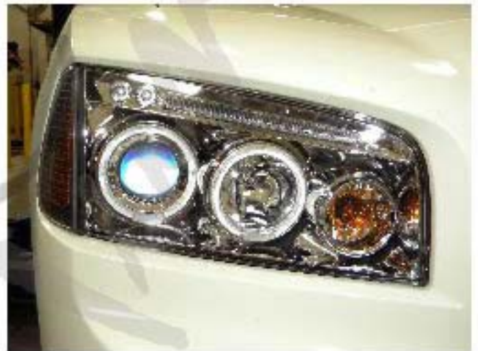
27. please repeat the picture order from 20 to 26 for the opposite side