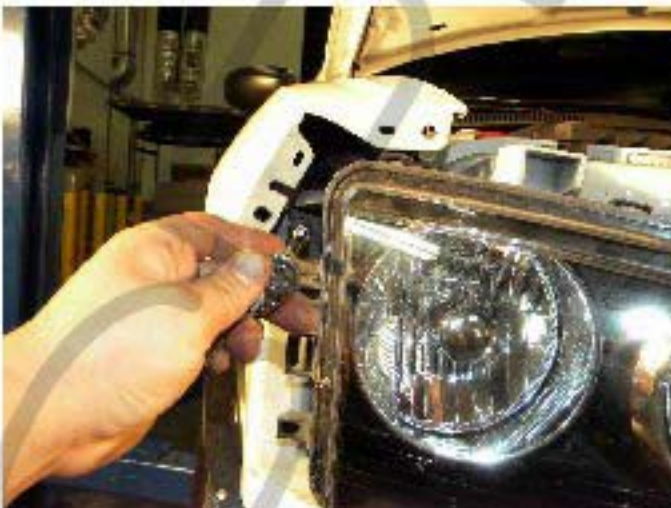
21. Remove bolts by using drive ratchet