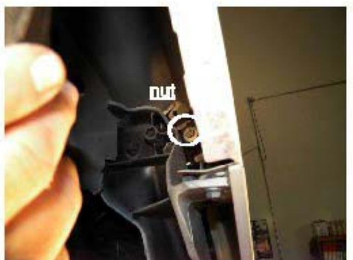
16. Remove one 10mm nut (Both side)