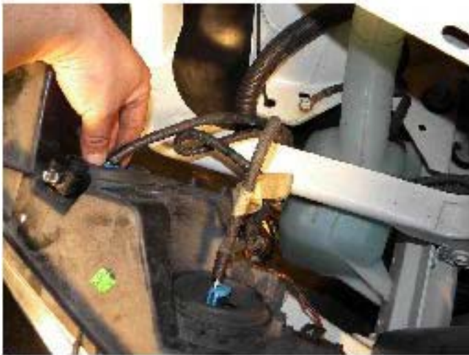
24. Disconnect all connectors from the headlight