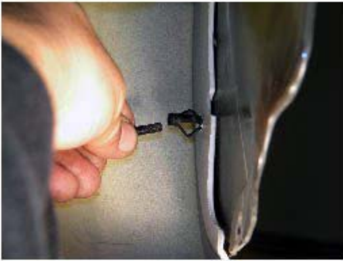
11. Pull out the screw inside the bumper