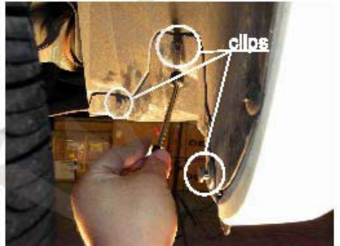
8. Remove three clips near the wheel well (Both side)