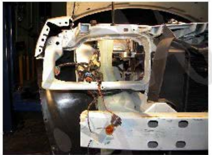
25. Connect new headlights to wire harness

Please see the "Halo and LE.D installation instructions" If your headlights don't have HALO or LE.D. You can skip that step