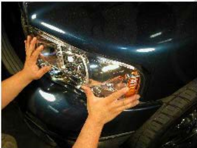
26. Install the new headlights

Please see the "Halo and LE.D installation instructions" If your headlights don't have HALO or LE.D. You can skip that step