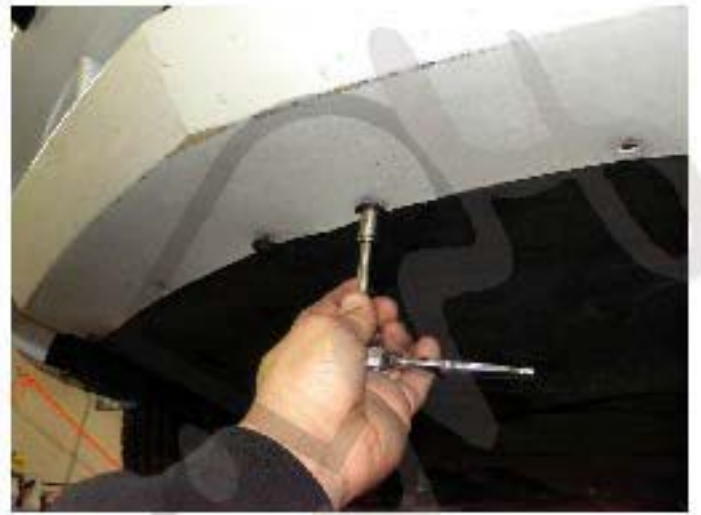
6. Using drive ratchet to remove the 7mm bolts