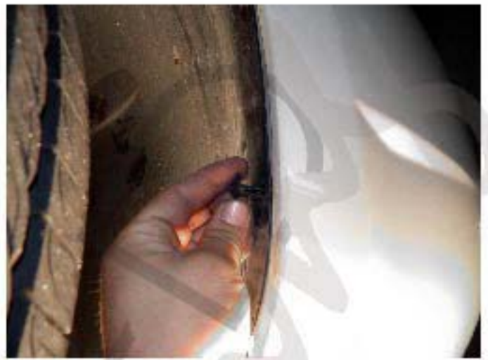
12. Then, pull the other side for complete remove