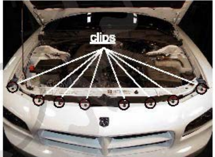
2. Remove eight clips