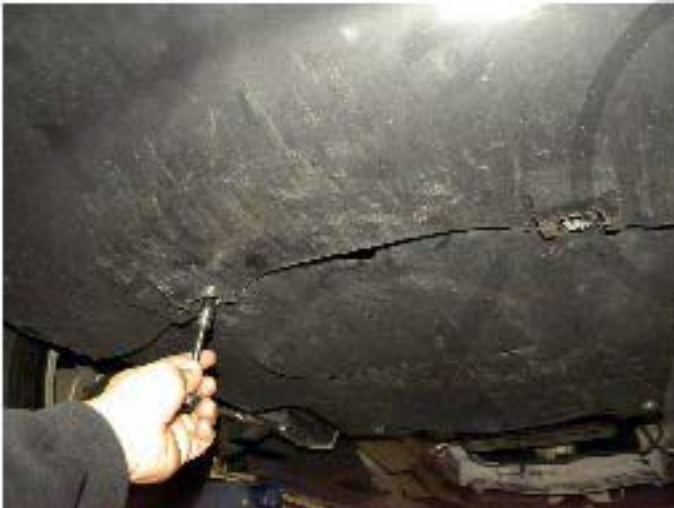
7. Using drive ratchet to remove the 10mm bolts