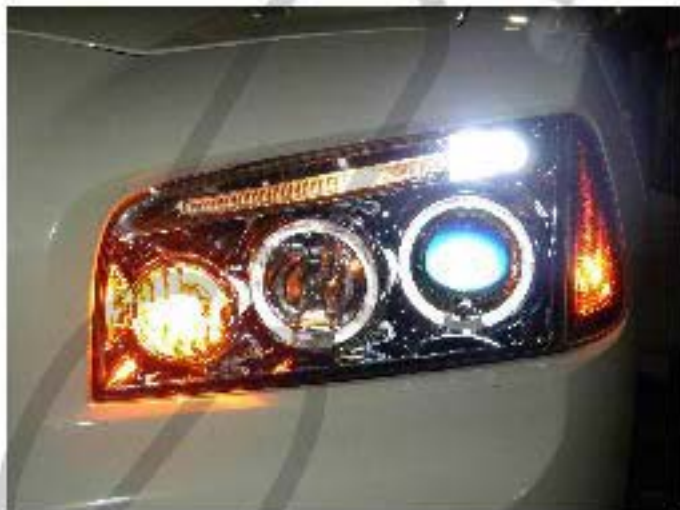
28. The installation now is complete