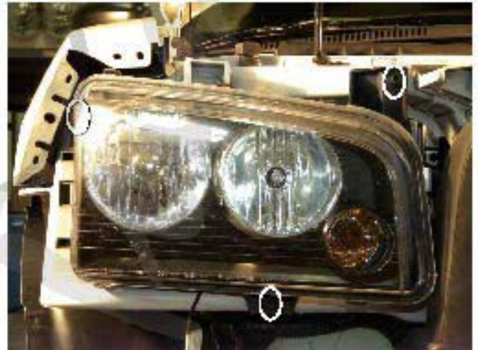
20. Remove three headlight bolts