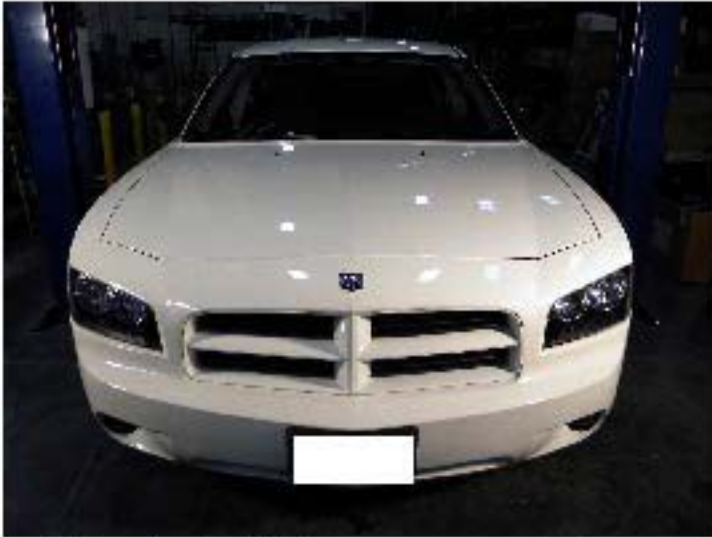
1. Open the hood first

If you experience any difficulties that the instruction did not cover, Please seek local auto shop for advise. Please wear protection before you work on your vehicle. An assistant is helpful when removing the front bumper. Please be careful while working with the bumper or body part to avoid scratching. Do not make direct contact with the halogen bulb or the wire assembly until the unit has cooled down after use.