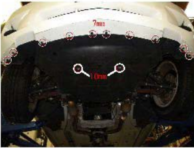
5. Remove ten 7mm bolts and two 10mm bolts