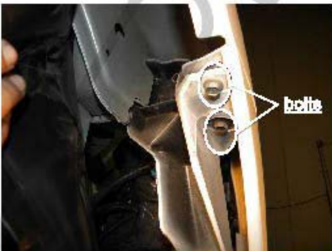
15. Remove two 10mm bolts (Both side)