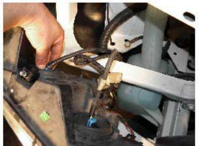
22. Disconnect all wire harness from the headlight