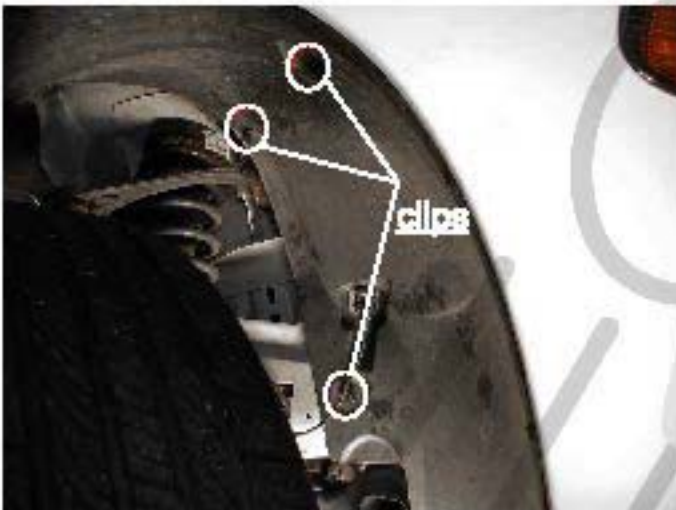
13. Remove three clips (Both side)