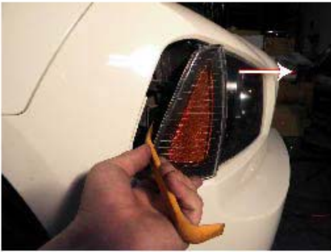
17. Pull out the corner light (Both side)