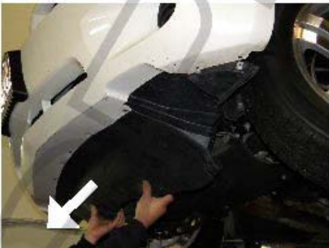
9. Remove the cover: