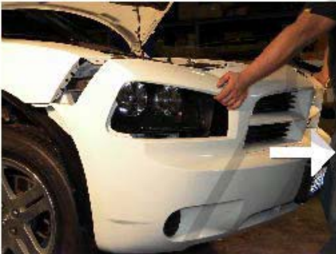
19. Remove the bumper