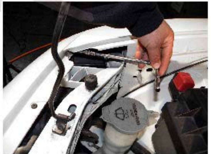
4. Remove one 10mm bolt by using 1/2" drive ratchet (Both side)