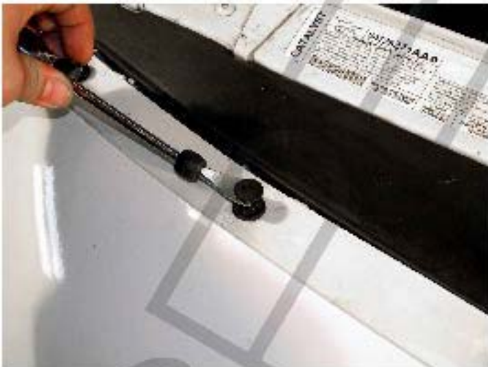
3. Remove the clips by using trim pad remover