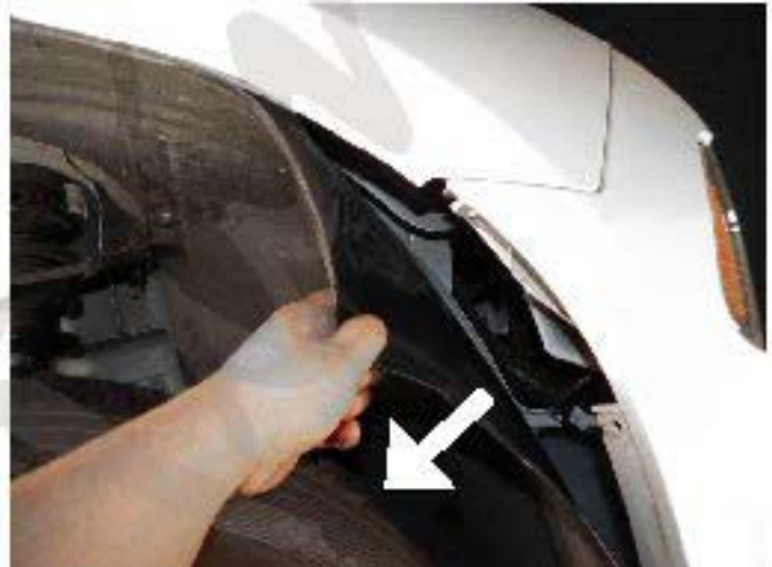
14. Pull out the cover (Both side)