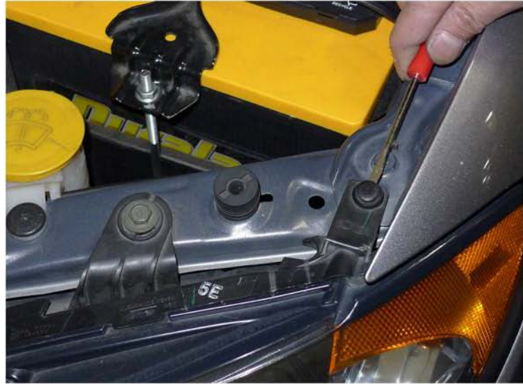
18. Remove the plastic clip