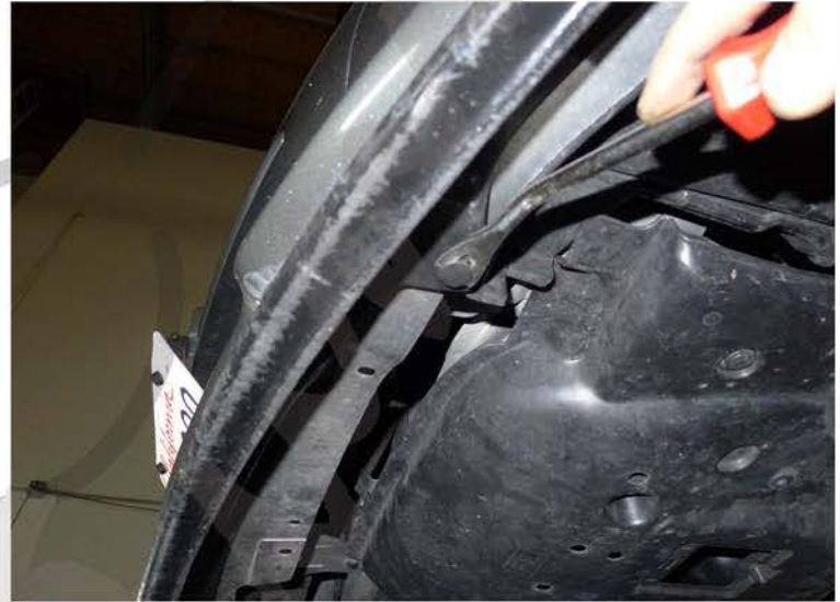
2. Remove the (7) plastic clips