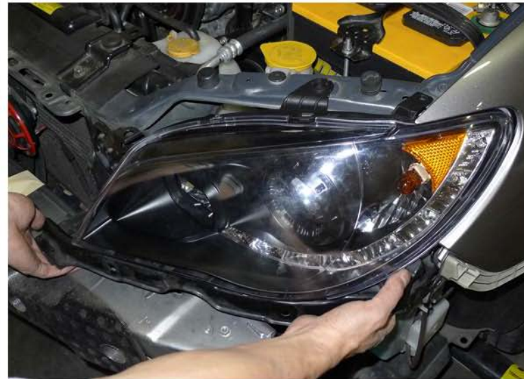
26. Place the new headlight in the stock location