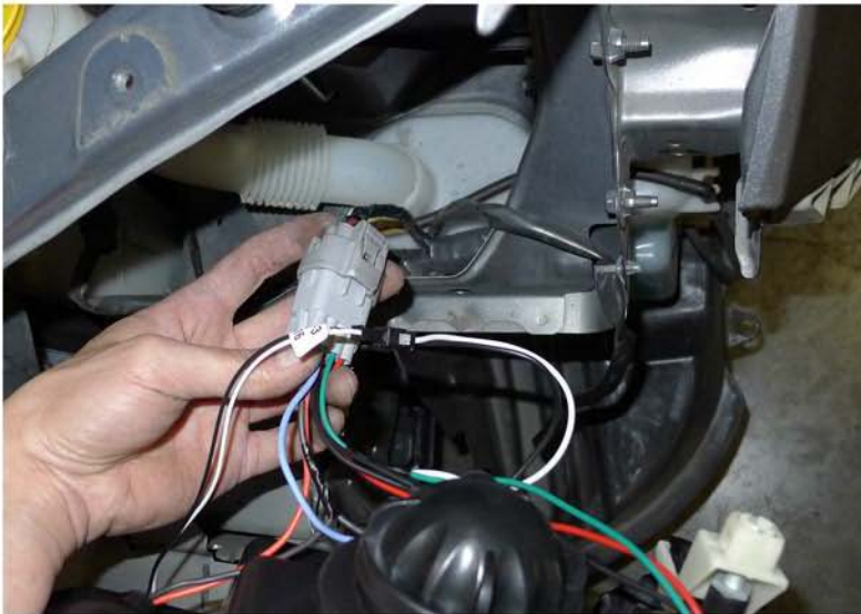
25. Connect the headlight harness to the new headlight