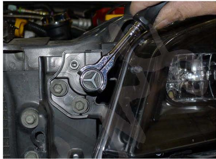
30. Tighten the (2) 10mm nuts and the (2) 10mm bolts