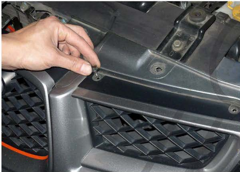
7. Remove the (2) plastic clips