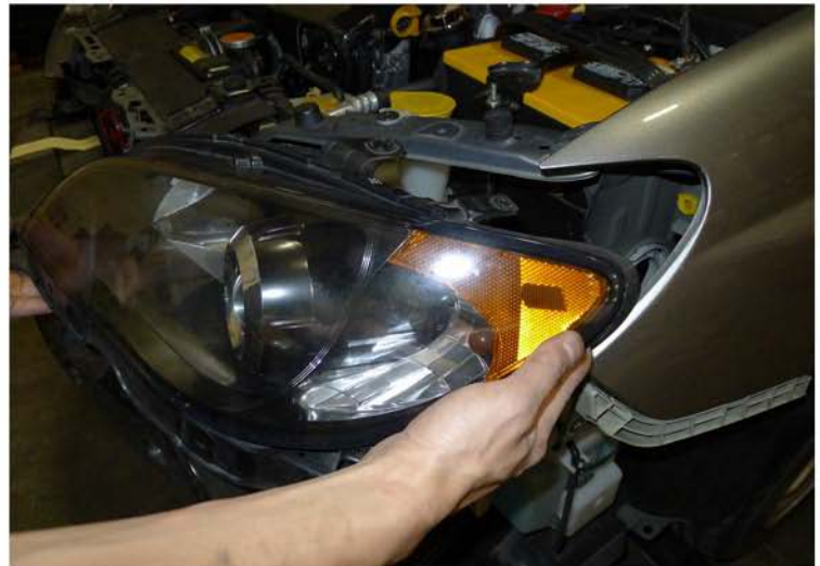
22. Remove the headlight