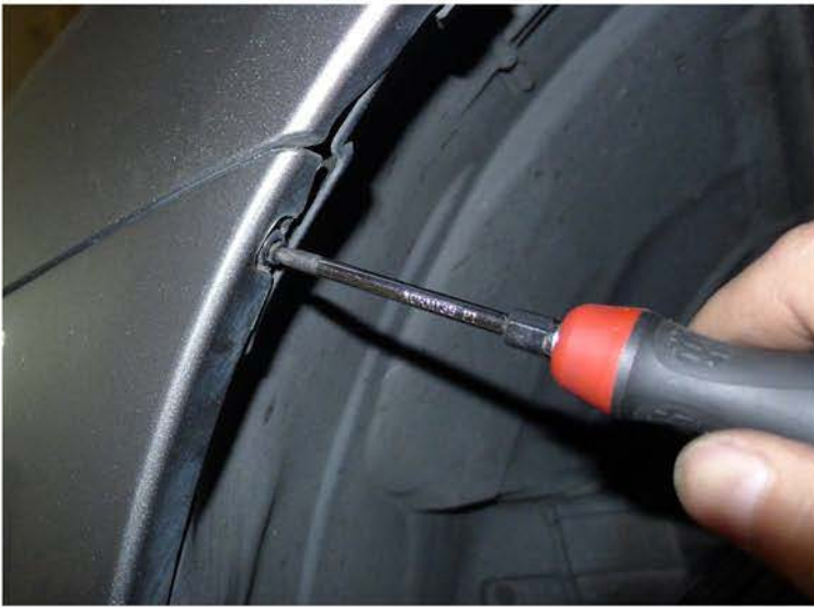
11. Remove the plastic clip