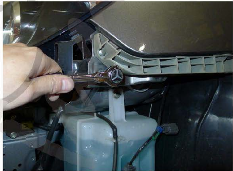
14. Remove the 10mm bolt