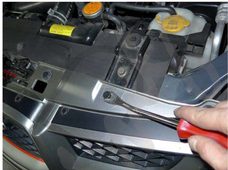
6. Remove the (6) plastic clips