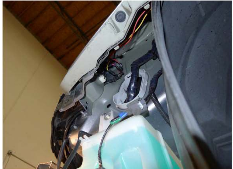
20. Undo the plastic retainer