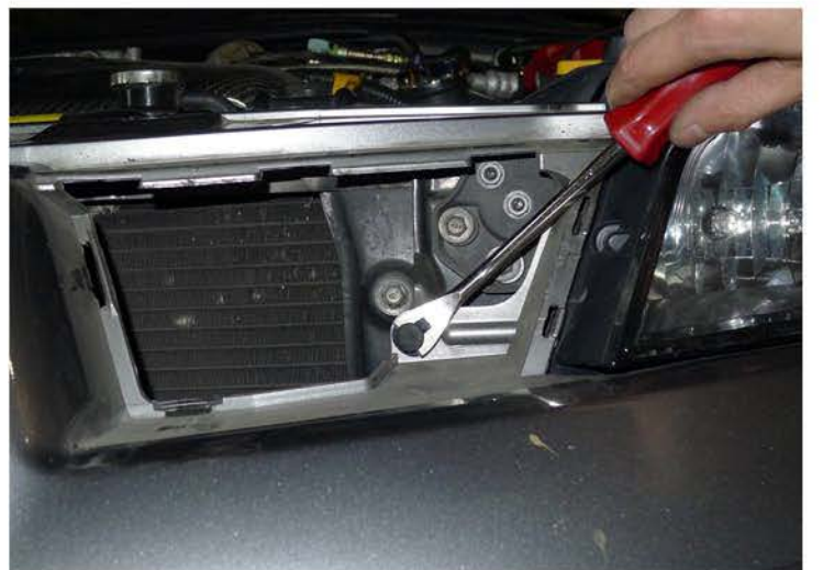
10. Remove the plastic clip