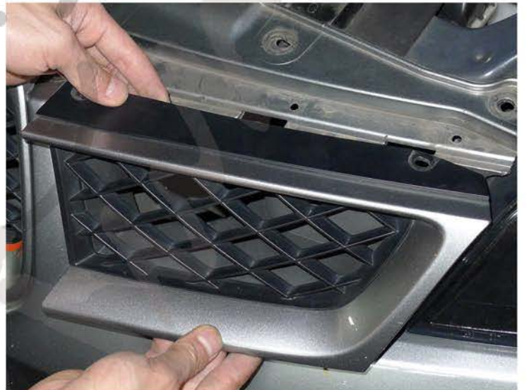
8. Remove the grill