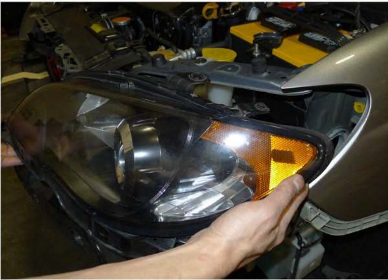
17. 10mm bolt and the plastic clip location