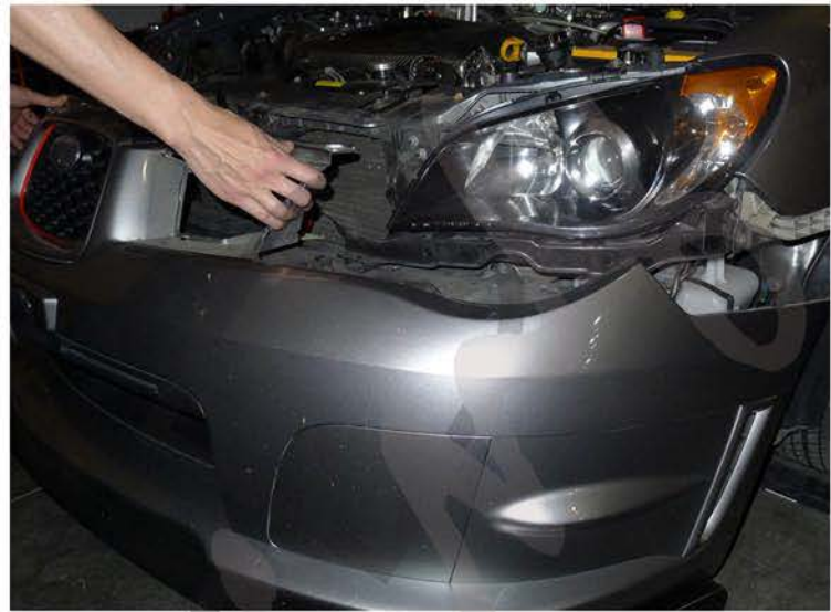
12. Remove the front bumper