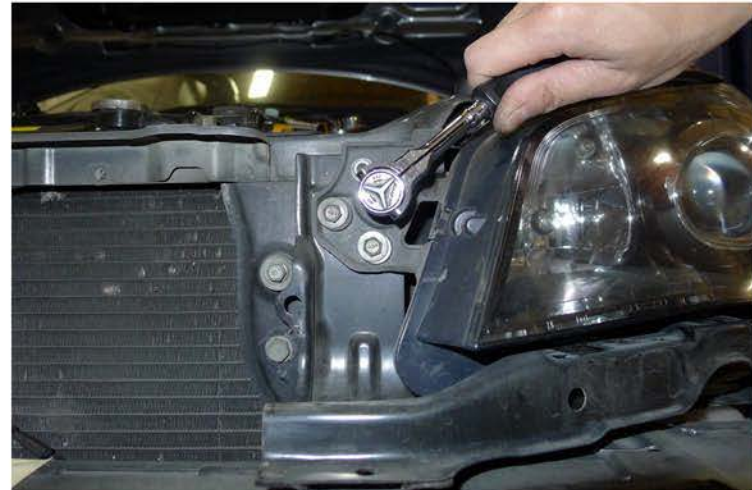
16. Remove the (2) 10mm nuts and the (2) 10mm bolts