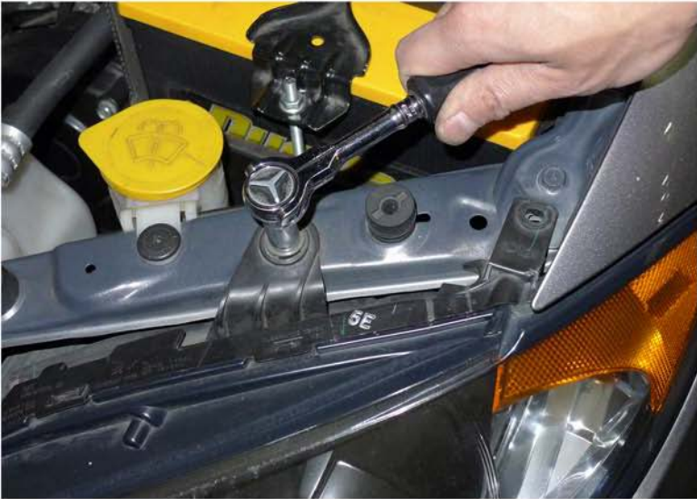
19. Remove the 10mm bolt