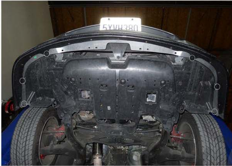
1. (7) Plastic clips location

Do not make direct contact with the halogen bulbs or the wire assembly until the unit has cooled down after use.