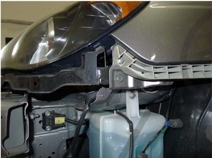
13. 10mm bolt location