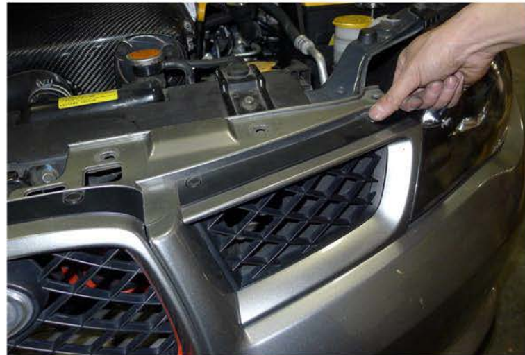
34. Replace the (10) plastic clips on the top side of the bumper