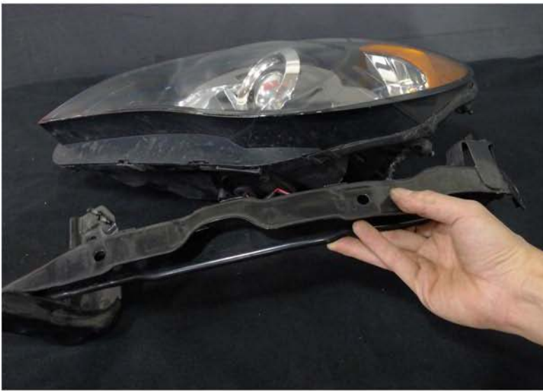
23. Remove the metal bracket