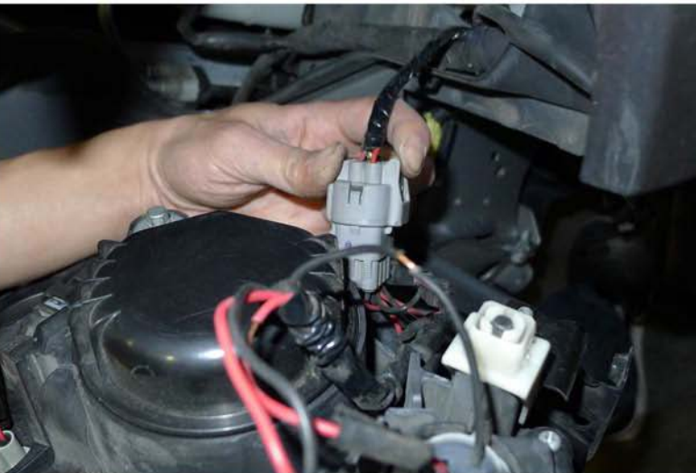
21. Disconnect the headlight harness Please see the "Halo and L.E.D installation instructions" If your headlights don't have HALO or L.E.D. You can skip this step