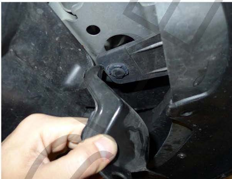
3. Plastic clip location