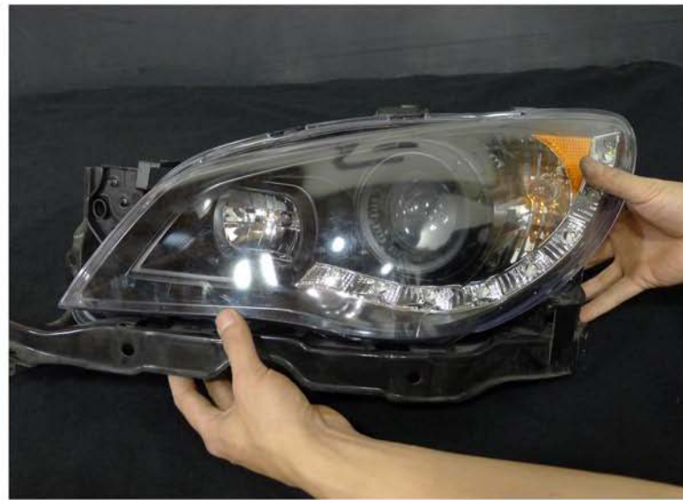
24. Place the metal bracket on the new headlight