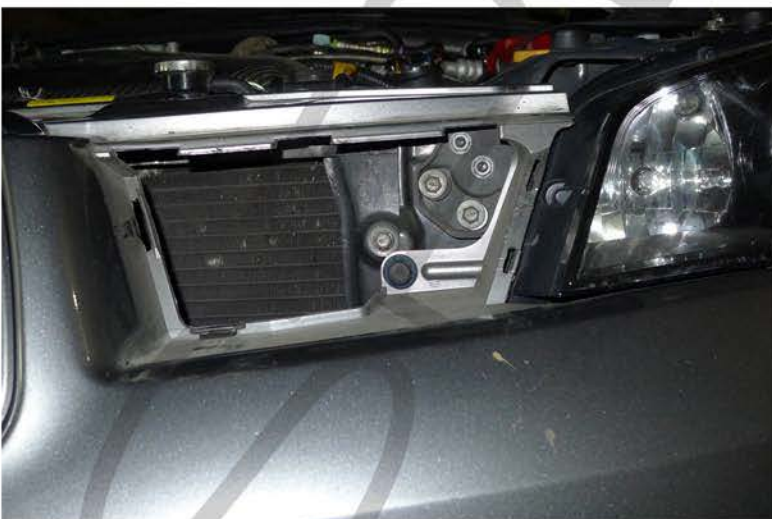
9. Plastic clip location