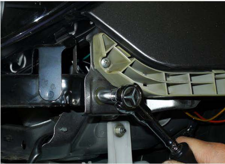
29. Tighten the 10mm bolt