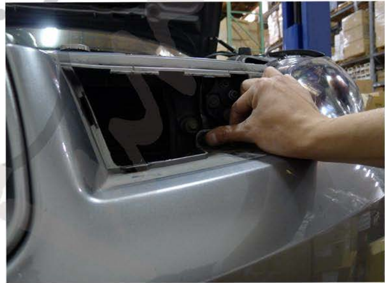
32. Replace the plastic clip