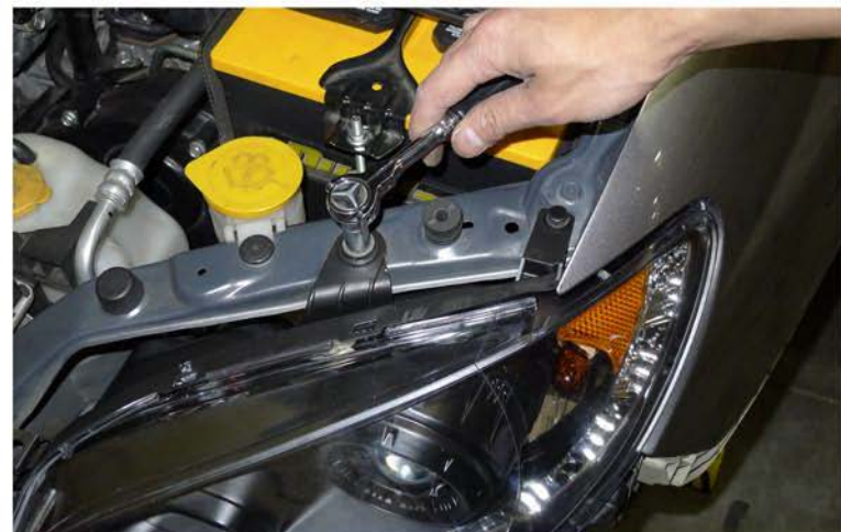
28. Tighten the 10mm bolt