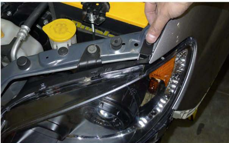
27. Replace the plastic clip