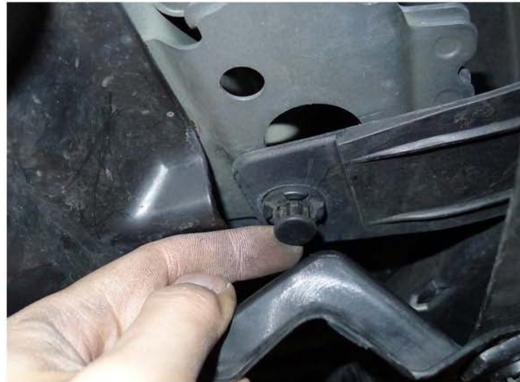
36. Replace the plastic clip located under the splash guard