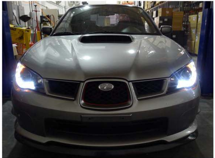
38. The installation is now complete