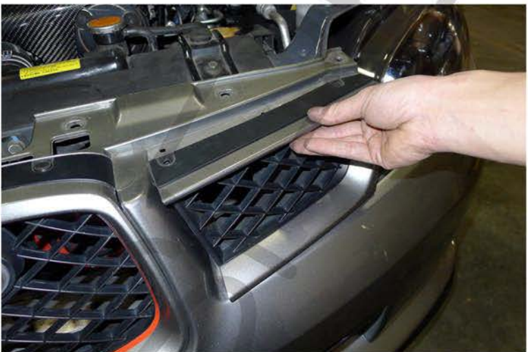
33. Replace the grill