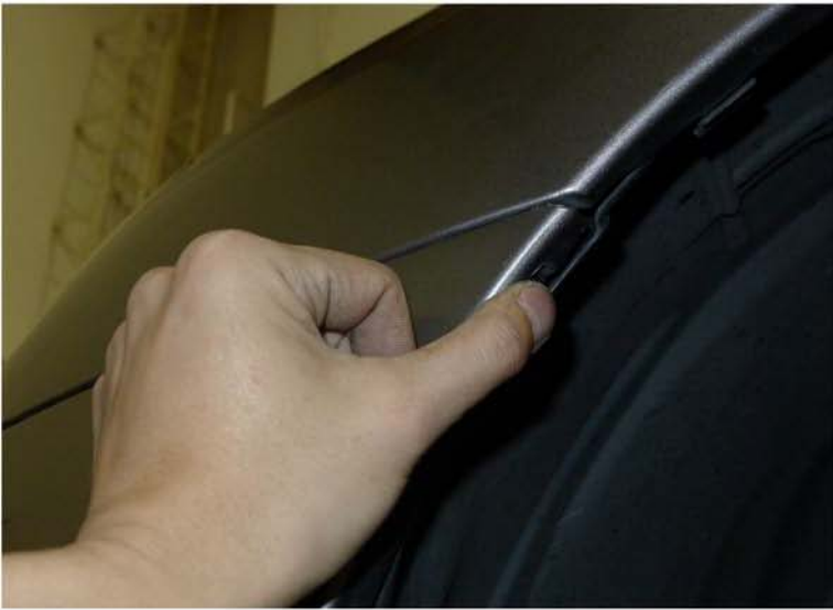
35. Replace the plastic clip