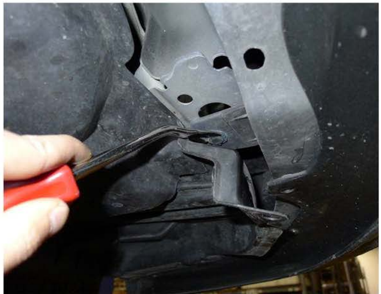
4. Remove the plastic clip located under the splash guard