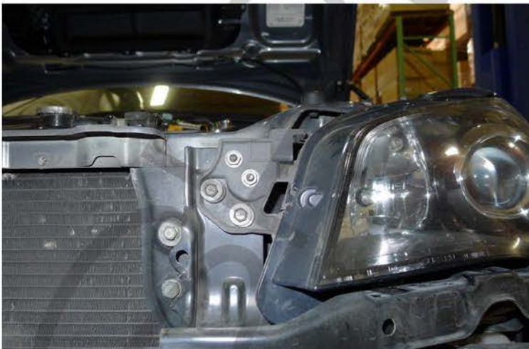
15. (2) 10mm nut and the (2) 10mm bolts location