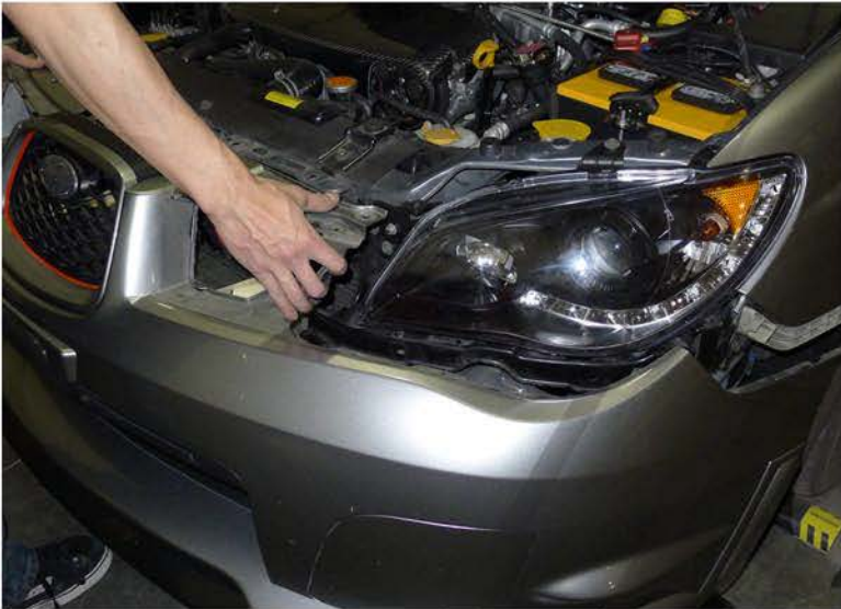
31. Replace the front bumper