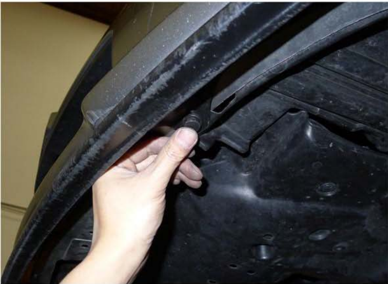
37. Replace the (7) plastic clips