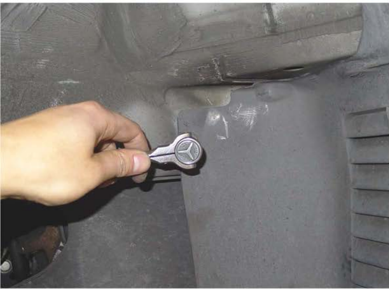
5. Remove (5) T25 screws