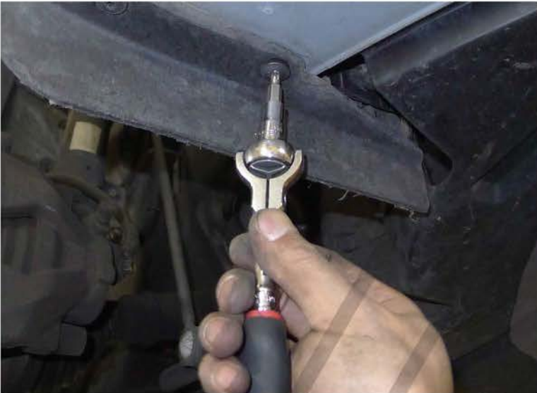
37. Tighten (4) T25 screws Please repeat the steps from 1 to 37 for the opposite side