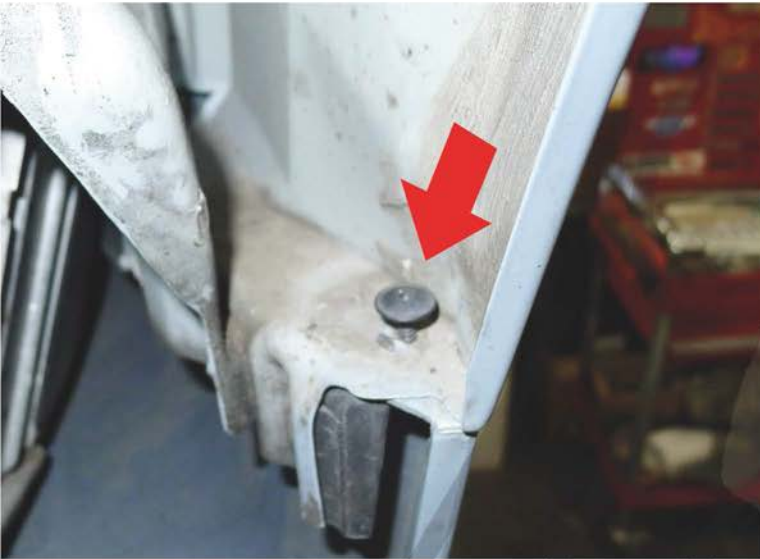
7. T25 screw location