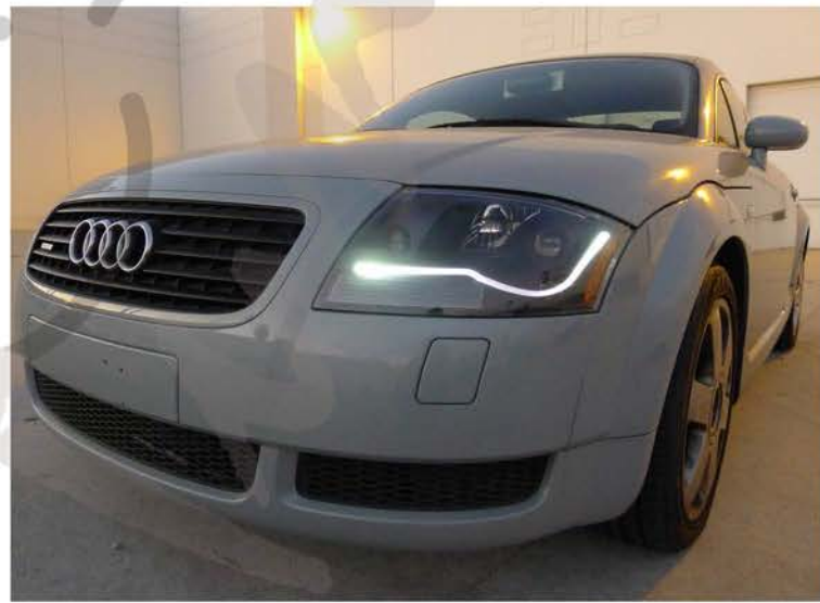
38. The installation is now complete