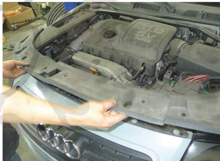
14. Remove the plastic cover