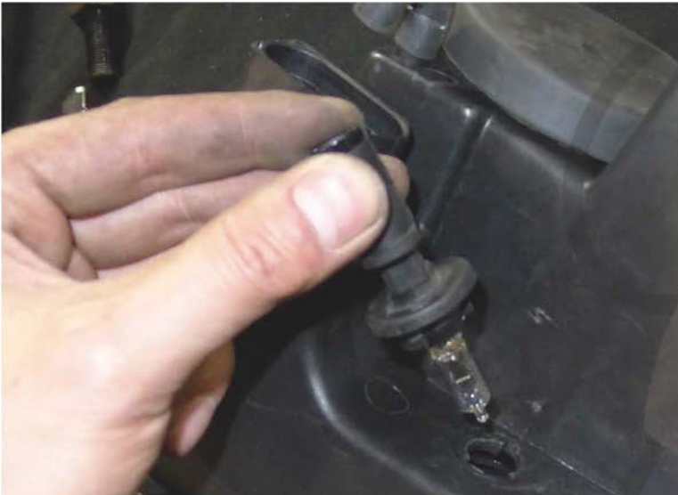
25. Place the turn signal bulb into the new headlight