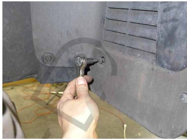
36. Tighten (5) T25 screws