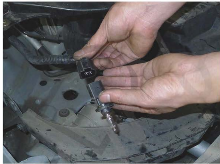
24. Remove the turn signal bulb