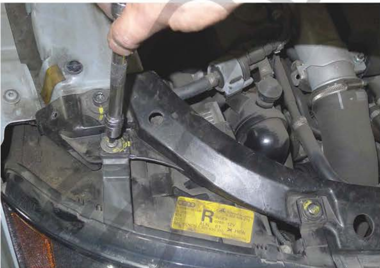
21. Remove (2) T30 bolt