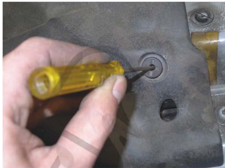
12. Press down the center button of the plastic clips