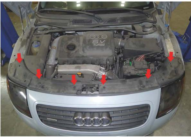
11. (6) Plastic clips location