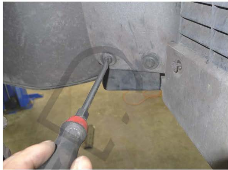
6. Release (2) plastic clips