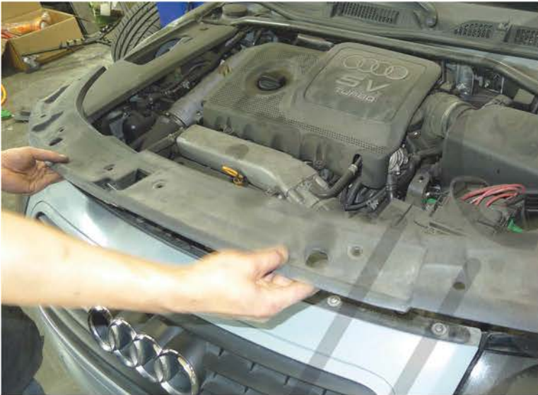
31. Replace the plastic cover