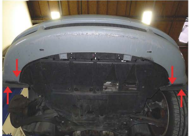
2. (4) T25 screws location