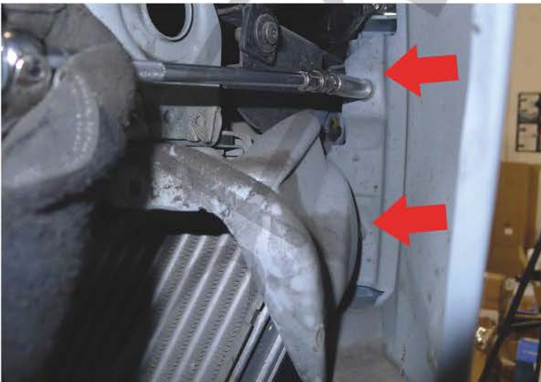
33. Tighten (2) 10mm nuts