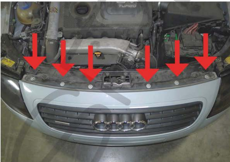
15. (6) T30 bolts location