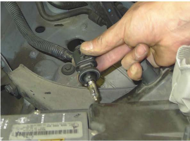
23. Disconnect the turn signal socket