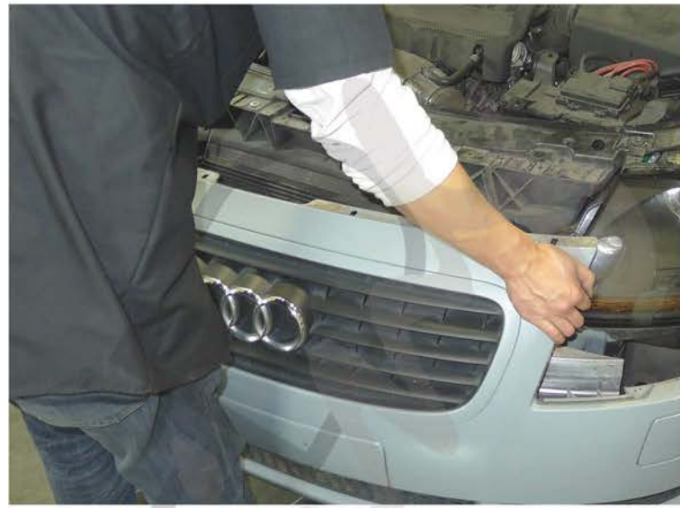
18. Remove and set aside front bumper