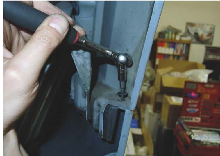
34. Tighten the T25 screw