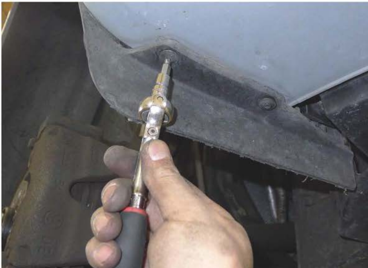
3. Remove (4) T25 screws