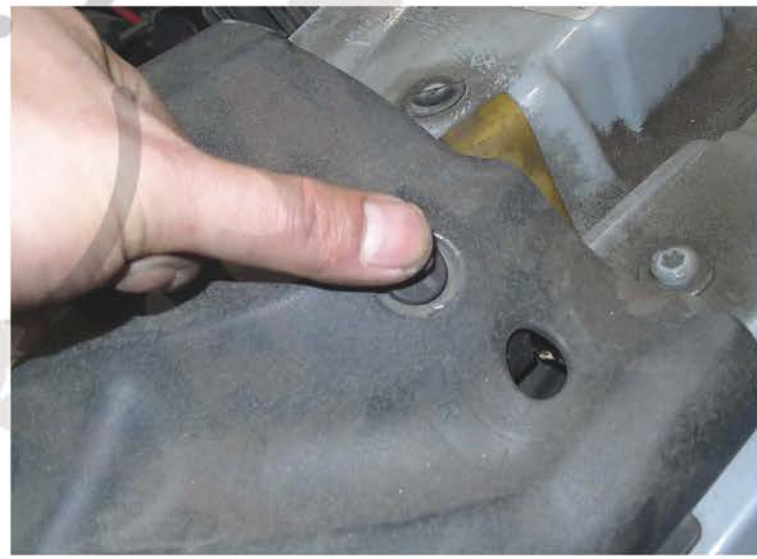
32. Replace (6) plastic clips