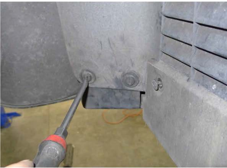
35. Lock (2) plastic clips