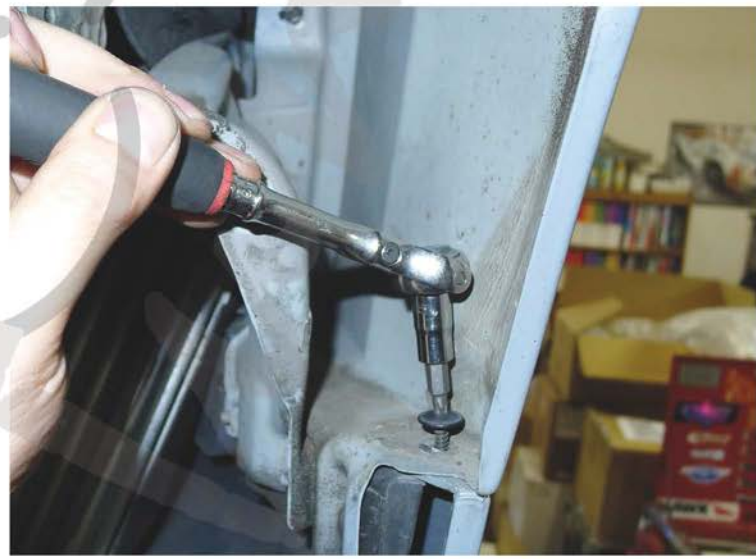
8. Remove the T25 screw