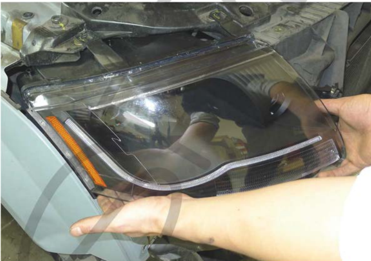
27. Place the headlight in the stock location

Please see the " L. E. D. head lights installation instructions" If your head lights don't have L.E.D. You can skip the installation instruction.