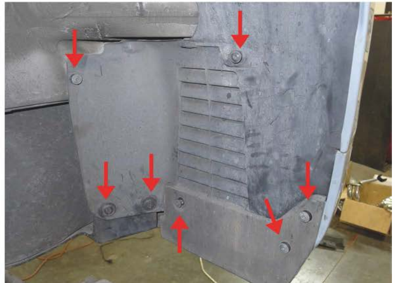
4. (5) T25 screws and (2) plastic clips location