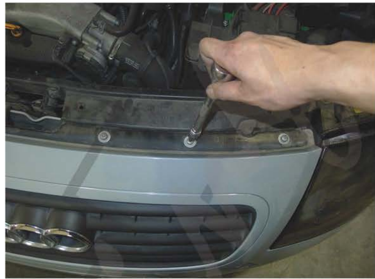
30. Tighten (6) T30 bolts