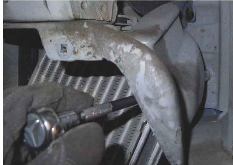
10. Remove (2) 10mm nuts