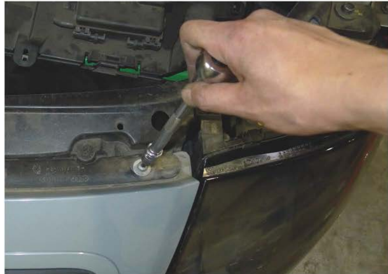
16. Remove (6) plastic bolts