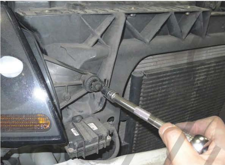
19. Remove the plastic clip