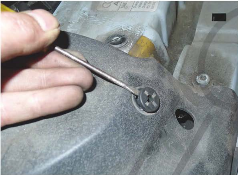
13. Remove (6) plastic clips