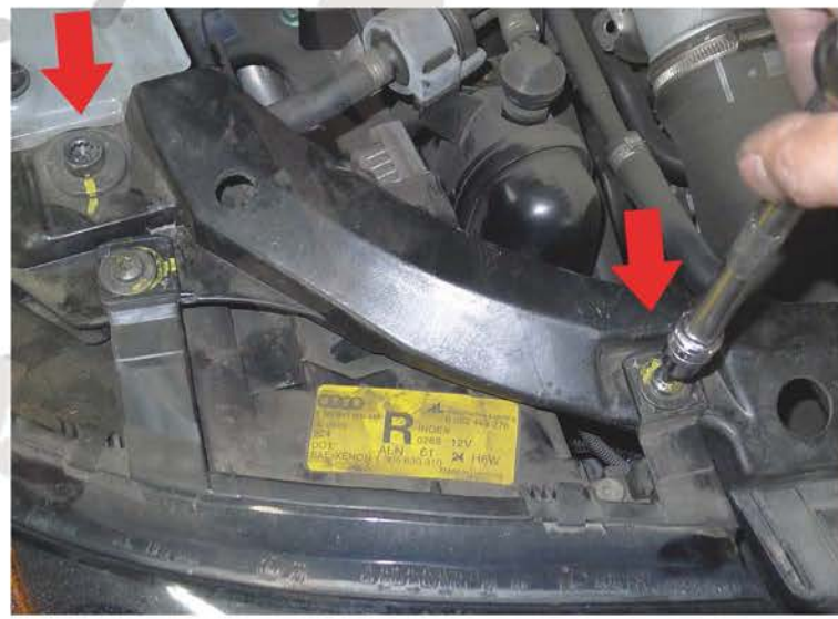
20. Remove (2) T30 bolt