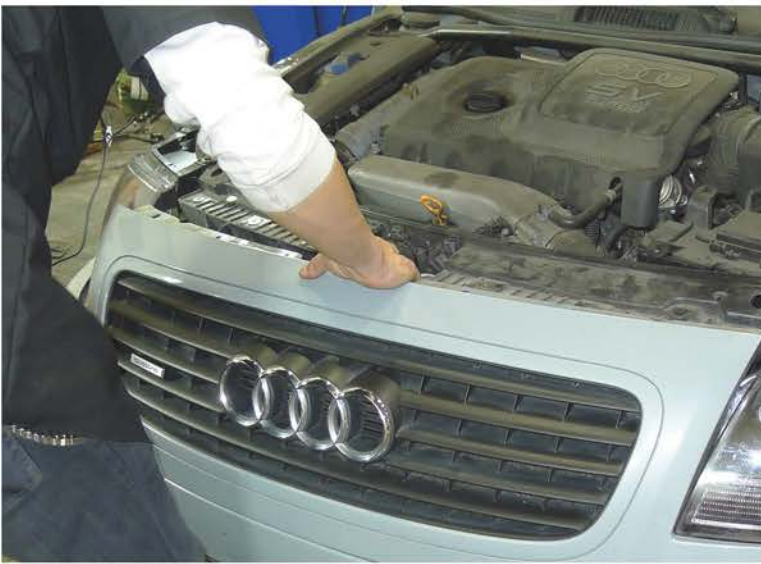
29. Replace the front bumper