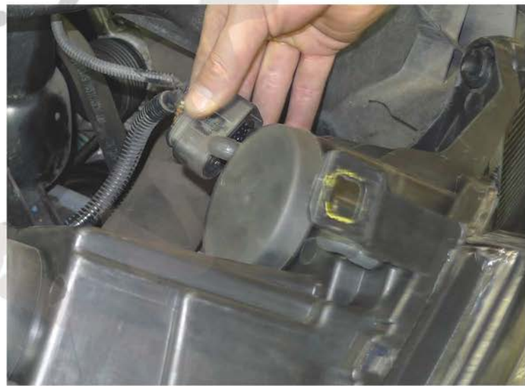
26. Connect the headlight harness to the new headlight

Please see the " L. E. D. head lights installation instructions" If your head lights don't have L.E.D. You can skip the installation instruction.