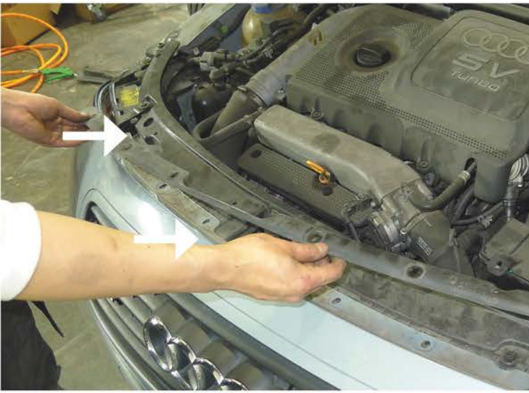
17. Remove the metal bracket