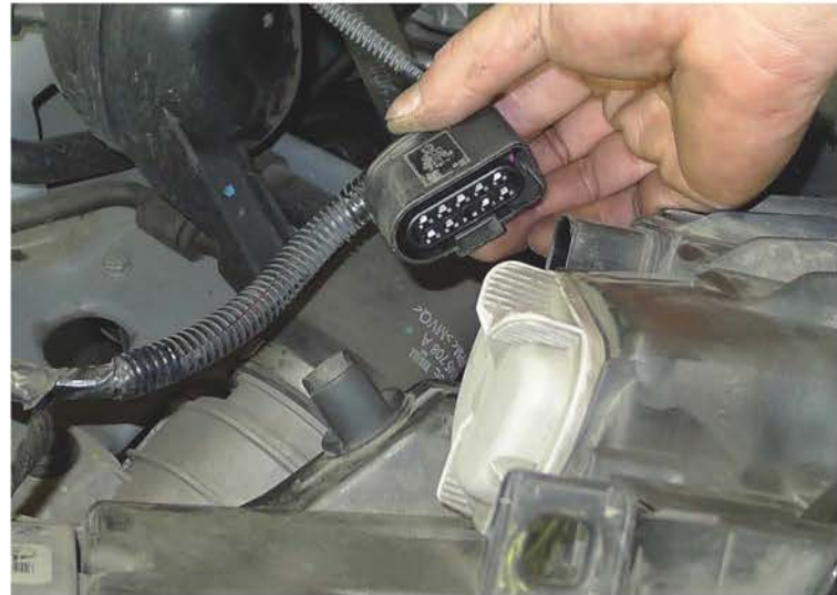
22. Remove the headlight and disconnect the headlight harness