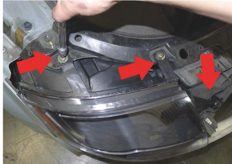
28. Tighten the T30 bolt